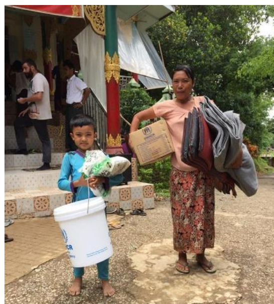
Distribution of emergency relief items.