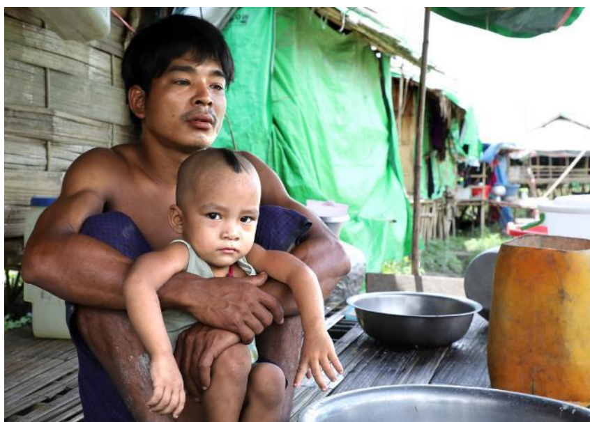
Father and son in War Taung displacement site in Kyauktaw Township.

Humanitarian organizations continue their attempts to increase their responses despite significant access restrictions and operational challenges resulting from the Government's shutdown of mobile internet data services in several townships in Rakhine State (Ponnagyun, Mrauk-U, Kyauktaw and Minbya).