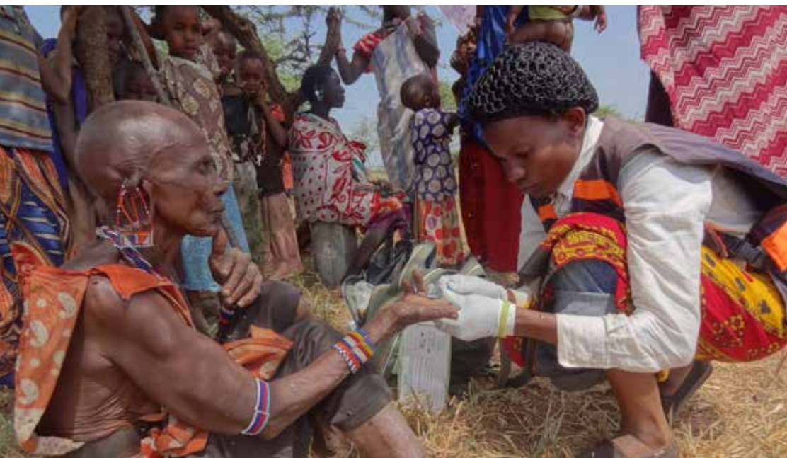
LVCT Health, Kenya

LVCT shows how collaboration between the government, health care workers and key population communities strongly improves access to prevention, testing and treatment for key populations in Kenya.