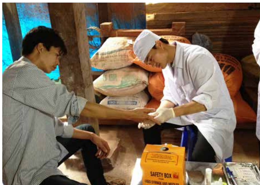
Viet Nam Authority on HIV/AIDS Control – Viet Nam

observed at the district PHC facilities. The results of this pilot programme suggest that community-based HIV testing services are a feasible and efficient method of increasing knowledge of HIV status in people who inject drugs and their partners, as well as other key populations. Peer educators and village health workers were instrumental in reaching the target population. This model will inform development of national guidelines on community-based HIV testing services.