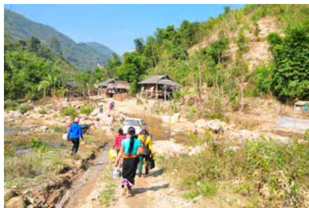
Viet Nam Authority on HIV/AIDS Control, Viet Nam

From September 2014 to January 2015, 8.9% of people tested were newly diagnosed HIV-positive. This is approximately four times higher than the positivity rates