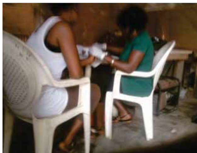
Excellence and Friends Management Care Centre - Nigeria

Sex workers. Prior to implementation of programme activities, EFMC mobilizes community engagement, advocating and creating demand for HIV testing services using storytelling techniques and informal meetings with key gatekeepers. During this period, owners of brothels and potential participants are identified and befriended. Behaviour change communication covers topics such as goal setting, income-generating activities and condom use. HIV testing services are offered to all sex workers in the brothels. One strategy for success was the provision of 'room-to-room' HIV testing services as many sex workers wanted more privacy when testing for HIV. Sex workers and clients who test HIV-positive are then linked to care and treatment services.