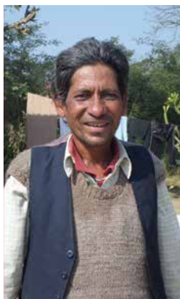
Naya Goreto, Nepal

Naya Goreto has catalyzed strong partnerships, creating a sense of solidarity to collectively address the issues that affect the injecting community. Those issues are now included in the yearly action plans of local government and civil society organizations; annual budgets are provided by local government bodies to conduct drug awareness programmes; and a member of the injecting community now sits on the District AIDS Coordination Committee. Overall, there is greater community awareness of issues that affect people who inject drugs.