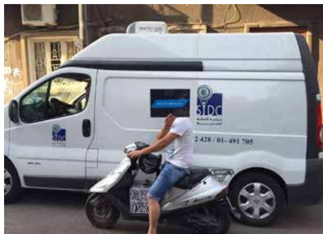
SIDC - Lebanon

From 2010 to 2012, Escale reached around 1,600 people who inject drugs, the majority of whom were aged 20–35 years, and 17% of opioid substitution therapy patients in the country were managed by Escale. However, opioid substitution therapy is not free in Lebanon, and many people who inject drugs cannot afford to pay for the service. Recruitment and retention of outreach workers is another challenge for Escale; hotspots are difficult to access, people who inject drugs fear the police when carrying syringes on their person, and many are reluctant to ask for help due to long-term alienation.