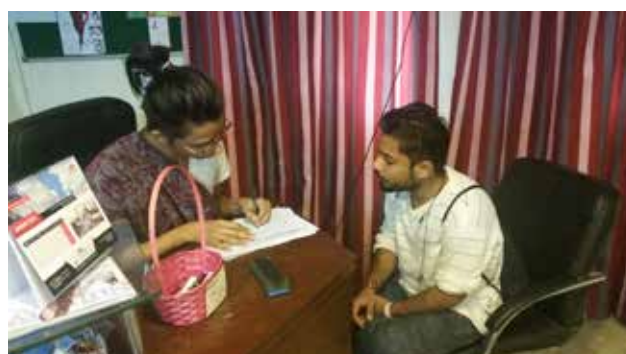
Naz Male Health Alliance, Pakistan

Naz operates six service delivery centres—which have been established as community-based organizations with direct financial, institutional and technical support from Naz—in five cities, with 47,000 registered clients. Each community based organization has a clinic and a drop-in centre that provides a safe and relaxing atmosphere for the target populations. The centres are strategically located, close to hotspots for the community and near concentrations of ‘hijra deras’ (dwellings of transsexual people). Drop-in centres and outreach activities are complementary; drop-in centres allow the establishment of long-term relationships with the clients, and outreach provides linkage to the drop-in centres. Service sites are separate for each key population group in order to effectively address their specific needs. Each centre has a multidisciplinary team of around 15 people, including physicians who are sexually transmitted infection specialists, a psychologist, and peer educators. The teams consist primarily of community members; more than 95% of staff are men who have sex with men or transgender.