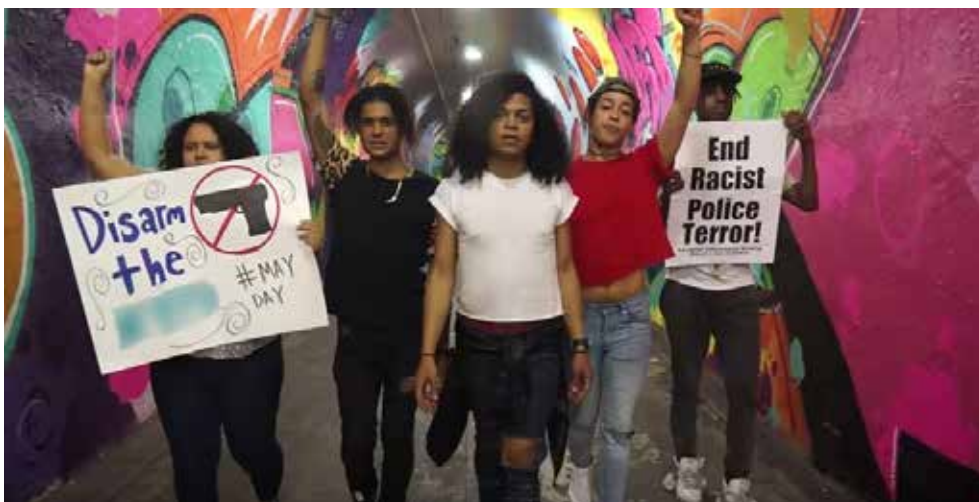
Streetwise and Safe, USA

SAS views discriminatory policing and criminalization as critical public health issues for youth who sell sex. Condoms or other safer sex tools found by police during stop and frisk encounters are sometimes confiscated or used as evidence for charges penalizing the sale of sex or trafficking. This practice particularly affects youth who are homeless, or otherwise without a stable place to live. For this reason, SAS and the Access to Condoms Coalition are currently campaigning for a comprehensive ban on the use of any reproductive or sexual health device as evidence of any prostitution or trafficking-related offense, including but not limited to, male and female condoms, pre-exposure prophylaxis, lubricant, and antiretroviral drugs.