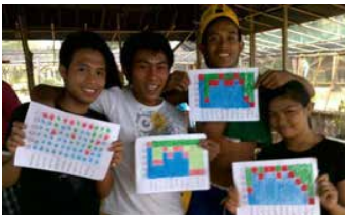
River of Life, Philippines

ROLi combines various methods of learning to influence changes in individual and group risk behaviours and to strengthen the engagement of young key populations with law enforcement and health providers. The programme has now been adapted to serve other young key populations, including young women who sell sex and young people who inject drugs. ROLi has reached 10,000 young people with interventions that allow them to assess their HIV risk and take actions to reduce it.