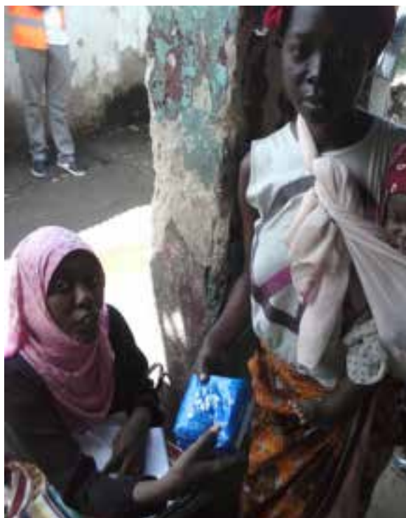
Muslim Education and Welfare Association - Kenya