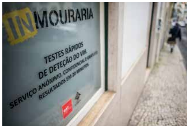
IN-Mouraria - Portugal

In 2012, the NGO Grupo Português de Ativistas em Tratamentos (GAT) started the IN-Mouraria project. The project offers harm reduction interventions and HIV testing services, primarily for people who inject drugs and migrant populations. Services are provided without an appointment, free of charge, and without the need for personal identification. The centre is located in an urban area of Lisbon where migration, drug use, sex work, and homelessness coexist. IN-Mouraria is part of a broader network of organizations established and led by local government to promote the rehabilitation of the area.