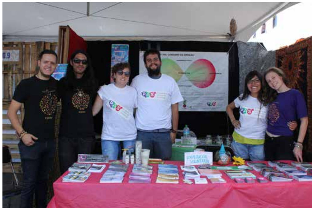
Espolea, A.C., Mexico