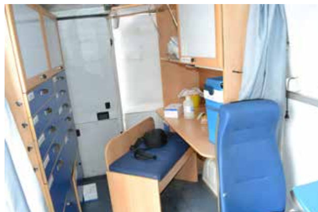
HERA - FYROM

HERA recruited and trained 60 counsellors, 25 laboratory workers and more than 100 local gatekeepers to participate in delivery of outreach HIV testing services. From 2007 to 2014, 13,071 clients received HIV testing, of which 85% were from a key population. Although annual detection rates vary, HERA mobile units report an average of 27% of all new HIV cases in Macedonia. Collaboration between government institutions and civil society organizations has created a favourable environment for increased access to HIV testing services for key populations.