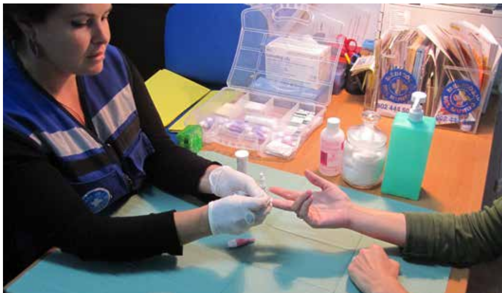
Médicos del Mundo - Spain