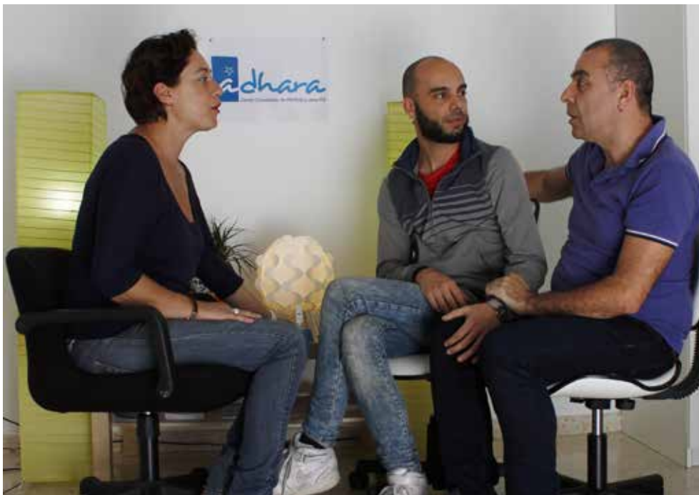
Adhara - Spain

Index testing in key populations to increase uptake of appropriate care