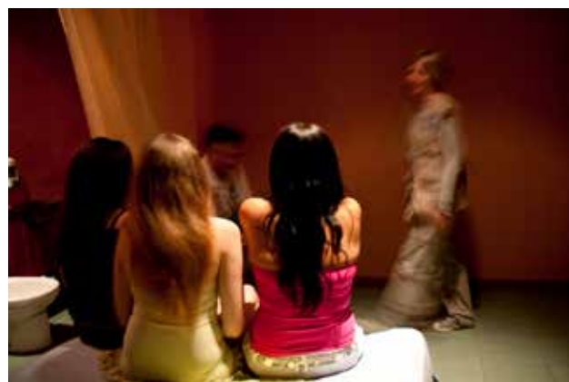
Médicos del Mundo - Spain

Between 2008 and 2012, a total of 3,251 people—2,253 women, 897 men, and 101 transgender people—were tested and referred to public hospitals for confirmatory HIV testing. First-time testers accounted for 32.3% of the total number of people tested. There were 72 new HIV diagnoses confirmed by the public hospital. Key to the success of this programme is the provision of services to clients without an appointment, free of charge, and without the need for personal identification. These services supplement the traditional HIV testing programmes offered through the NHS.