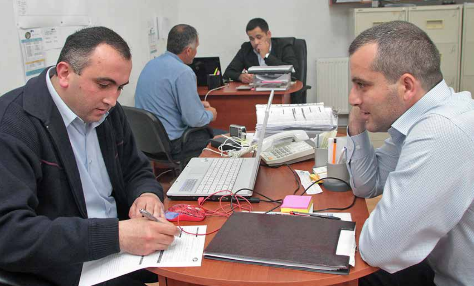
Thanks to a World Bank backed line of credit, livestock production in Georgia has increased.