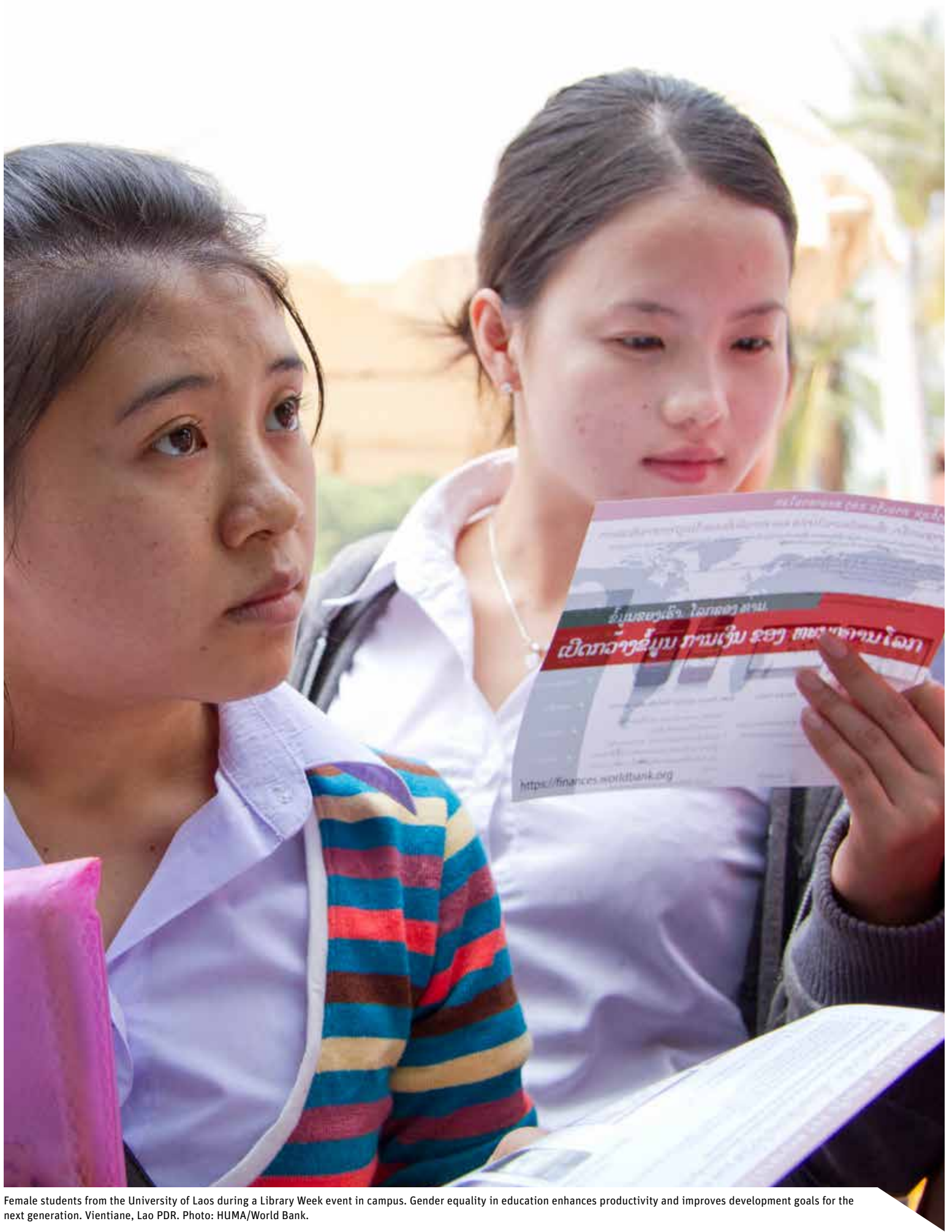
Female students from the University of Laos during a Library Week event in campus. Gender equality in education enhances productivity and improves development goals for the next generation. Vientiane, Lao PDR.