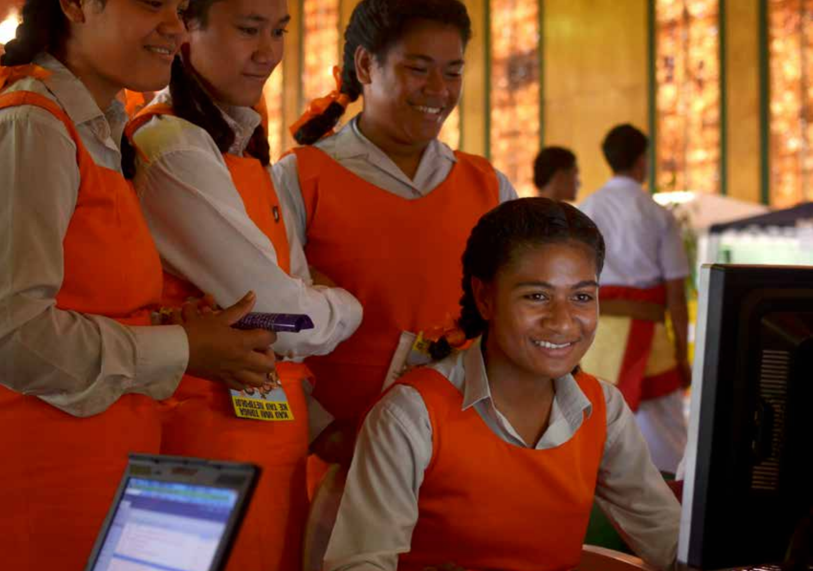
Students from Tonga's Tailulu College making the most of new high-speed broadband services at 2013 World Telecommunication and Information Society Day celebrations in the the Tongan capital, Nuku'alofa. Nukua'lofa, Tonga.

their community with reliable and timely recovery information. This barrier can be easily overcome by government sharing of information with community leaders, and by supporting community leaders in disseminating such information widely.