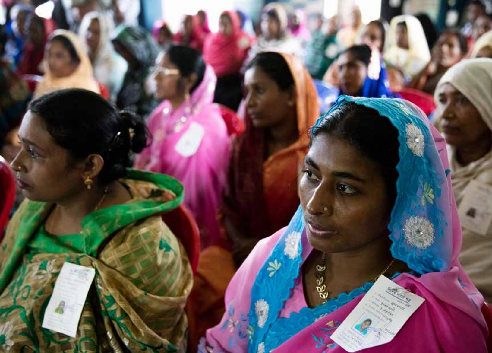
Women beneficiaries of Nuton Jibon (livelihood) Project at the Nuton Jibon Community Center, Barisal District, Bangladesh.

This Guide is accompanied by a list of resources that is also available on the World Bank’s Global Facility for Disaster Reduction and Recovery’s (GFDRR) Recovery Hub website, under the “Communication” section.