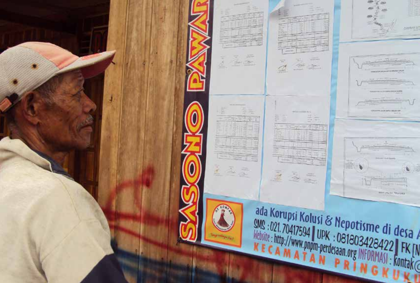
Community member scrutinizing project budget on information board. Pringkuku, East Java. Project: PNPM Rural.