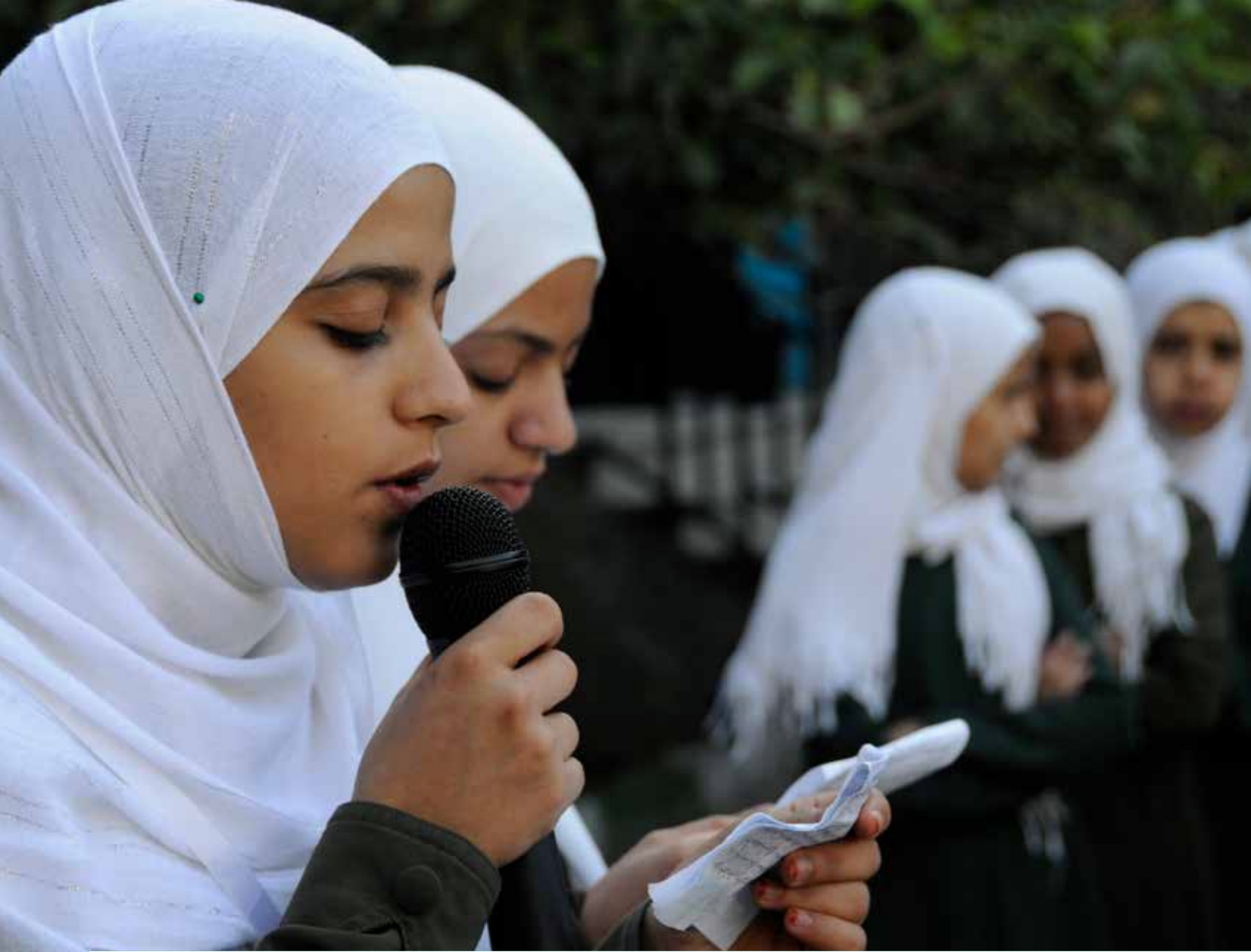
Girls attend morning assembly at the Shaheed Mohamed Motaheer Zaid School in Sana'a. The Social Fund for Development provided funds to the school as part of their 'quality of education' program. Republic of Yemen.

example, schools, churches, sports groups (that is, groups that meet regularly) may be deployed as communication platforms.