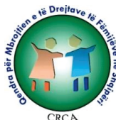
Children's Human Rights Centre of Albania CRCA,