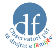
Observatory for Children's Rights, (Observatory)