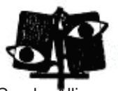
Gender Alliance for Development Centre (GADC)