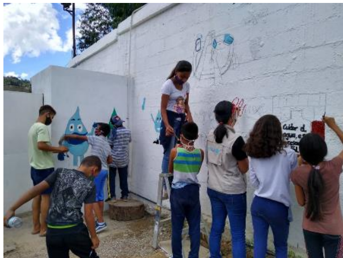
As part of activities during Handwashing Day, UNICEF -together with members of the community Ojo de Agua and partner FUNDAN -, painted a wall with key hygiene messages in the community, Baruta, Miranda state.

Implementing partner ASONACOP created and published 14 videos involving children on handwashing and hygiene practices from different states. ASEINC reported an active participation of 86 children with special needs . FUNREAV carried out a story on hand washing with sign language. Printed material was distributed in PASIs located in Gran Caracas, including 4,624 flyers promoting menstrual hygiene -bearing in mind that UNICEF WASH kits contain sanitary pads-, and 1,500 flyers guiding families on the return to distance school. More than 2,657 people received messages via instant messaging and a total of 10,637 printed material items were delivered in priority