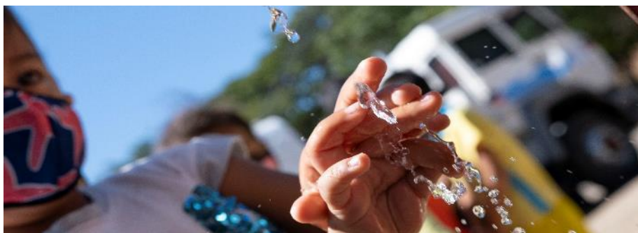
Yermaris, age four, learns proper handwashing techniques during an activity for Global Handwashing Day in Antonio Pinto Salinas neighbourhood, Táchira, Venezuela.