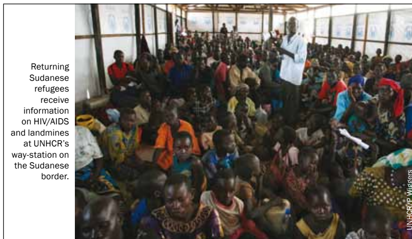
Returning Sudanese refugees receive information on HIV/AIDS and landmines at UNHCR's way-station on the Sudanese border.

The SPLA – the army of the Government of South Sudan (GoSS), previously the armed wing of the main southern Sudanese rebel movement (the SPLM) – is in the process of transforming from a guerrilla army to a professional military force. Challenges during the transition include ambiguity surrounding command structures, and increased cultural variation among soldiers (as all other armed groups, based on mainly tribal identity, had to be absorbed into the SPLA). The SPLA plans to downsize through the DDR process, which presents an opportunity for HIV interventions as soldiers make the transition to civilians.