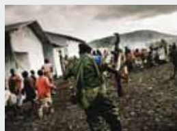
Kibati camp for displaced people, DRC.

People displaced in conflict (and on return home) often find themselves in contact with people carrying weapons in various guises. Equally, people carrying weapons are themselves generally mobile, whatever their relation to a conflict or its aftermath. In particular, members of security forces in situations of forced displacement can be agents of positive change in relation to HIV and AIDS – or part of the problem.