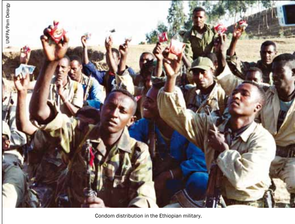
Condom distribution in the Ethiopian military.

prevention, treatment and care in regions most affected by conflict and HIV, particularly in sub-Saharan Africa