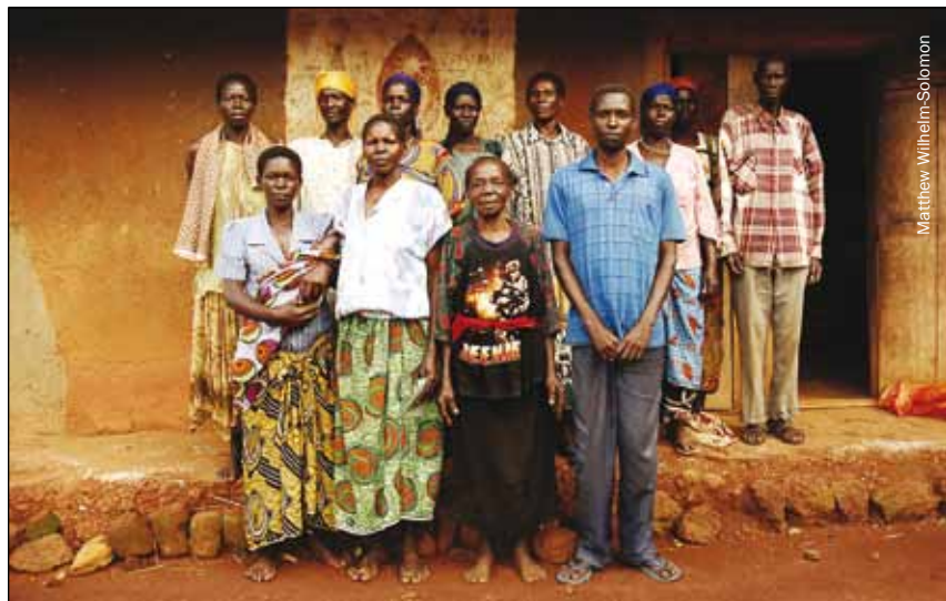
A newly formed HIV support group in a return area of Oyam district, Uganda.