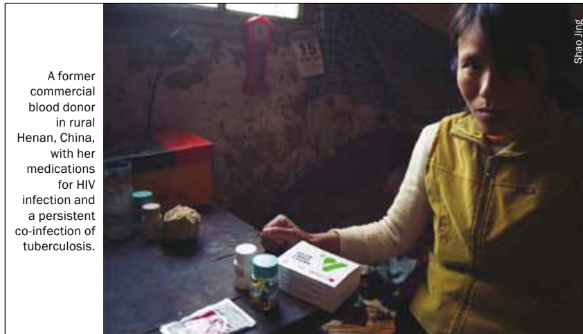
A former commercial blood donor in rural Henan, China, with her medications for HIV infection and a persistent co-infection of tuberculosis.