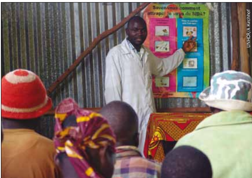
Information session on HIV/AIDS for returnees from Tanzania, Mugano transit centre, Burundi.

transmission. It is often assumed that one-off, opportunistic rape is the only form of sexual violence in conflict contexts. However, it also includes other forms such as sexual slavery and other strategic and deliberate attacks over time. There is evidence that both long-term exposure to the virus and violent sexual activity are associated with increased risk of transmission.