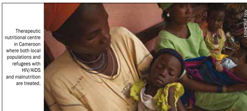
Therapeutic nutritional centre in Cameroon where both local populations and refugees with HIV/AIDS and malnutrition are treated.

Sadly, this commitment has yet to be met. Refugees and IDPs are generally excluded from national HIV strategic plans or proposals to the Global Fund to Fight AIDS, Tuberculosis and Malaria. In its 2009 annual list of the top ten ignored humanitarian crises, MSF included inadequate donor support for AIDS treatment. 4 Besides the legal obligations of those governments that have signed the 1951 Refugee Convention, there is a public health imperative to include all groups affected by conflict in HIV national strategic plans and funding proposals as well as to develop contingency plans. It is essential for their inclusion if we are to achieve universal