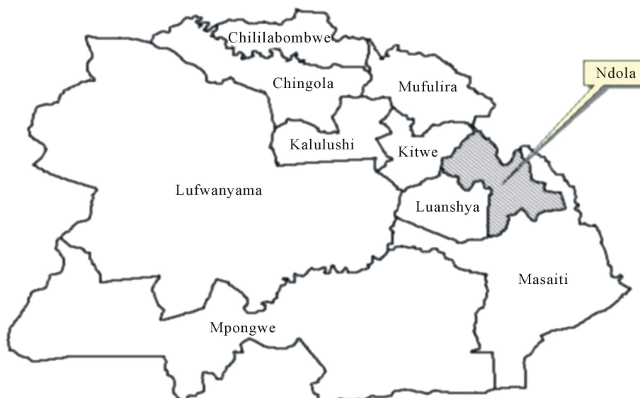
Figure 2. Map depicting Ndola district of Zambia.