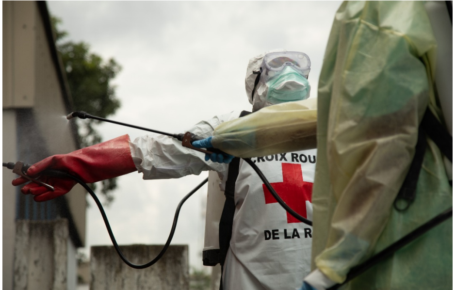
Goma's safe and dignified burial team being decontaminated at one of Goma's hospital morgues.