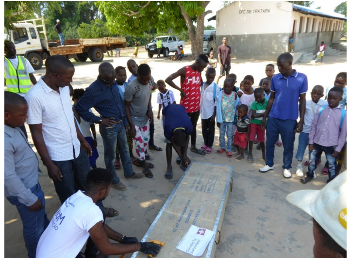
IOM distributed tents in Taratara transit camp, Metuge District benefiting 147 households, Cabo Delgado Province.

resettlement process of the families living in Muinde host community. The DTM unit is conducting the first round of baseline assessments in eight districts (16 localities) of Cabo Delgado Province to gather information on the number of households affected by shelter damage and the number of people who have left their localities or have returned.