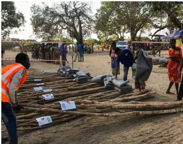
IOM continues to support families in resettlement sites in Sofala Province with Shelter-NFI items.

To date, IOM has assisted 48,653 households with shelter and NFI support, including distribution of 35,116 plastic sheets, 2,730 toolkits, 464 tents, 2,496 structural support poles, 9,408 blankets, 1,898 kitchen sets, and 1,418 solar lights.