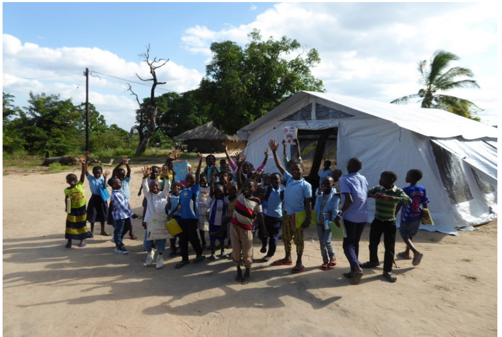
IOM S-NFI teams supported 147 cyclone-affected families in Taratara transit camp with tents including a tent to support continuation of classes for schoolchildren. Metuge District, Cabo Delgado.