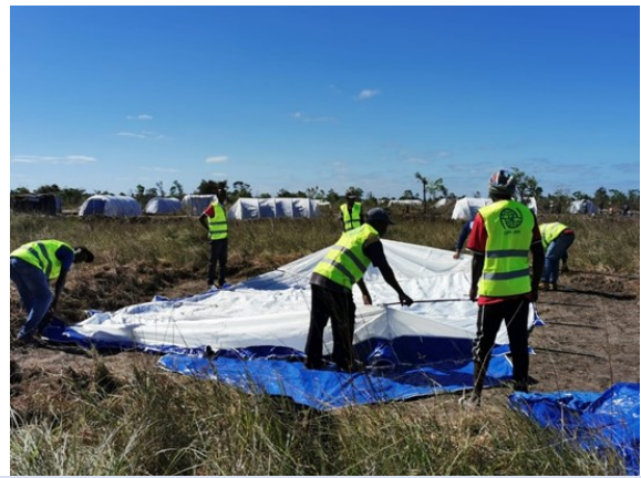
IOM providing and setting up family tents in resettlement sites. Sofala Province.

Furthermore, IOM supported the resettlement movement of 55 households from Piccoco accommodation site to Savane resettlement area in Dondo, Sofala Province.