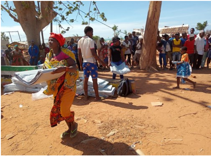
IOM Shelter-NFI distribution in Mucojo Sede aldeia, Cabo Delgado Province.

As of 15 June, IOM assisted 7,193 households with shelter and NFI support, including distribution of 5,535 tarpaulins, 296 blankets, 294 kitchen sets, and 110 toolkits. Through the Shelter Common Pipeline, IOM has supported partners in the distribution of 8,079 tarpaulins and 1,528 mosquito nets. IOM organized a tarpaulin distribution in Macomia District, Cabo Delgado Province on 10 June (Mucojo Sede aldeia) and 14 June (Runho, Nambo and Nagulue aldeias) where 2,106 families were supported with Shelter-NFI materials.