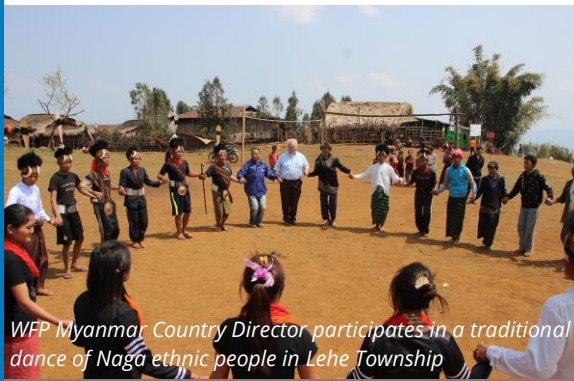
WFP Myanmar Country Director participates in a traditional dance of Naga ethnic people in Lehe Township