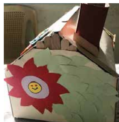
Feedback boxes created by refugee children in CRS Child Friendly Spaces