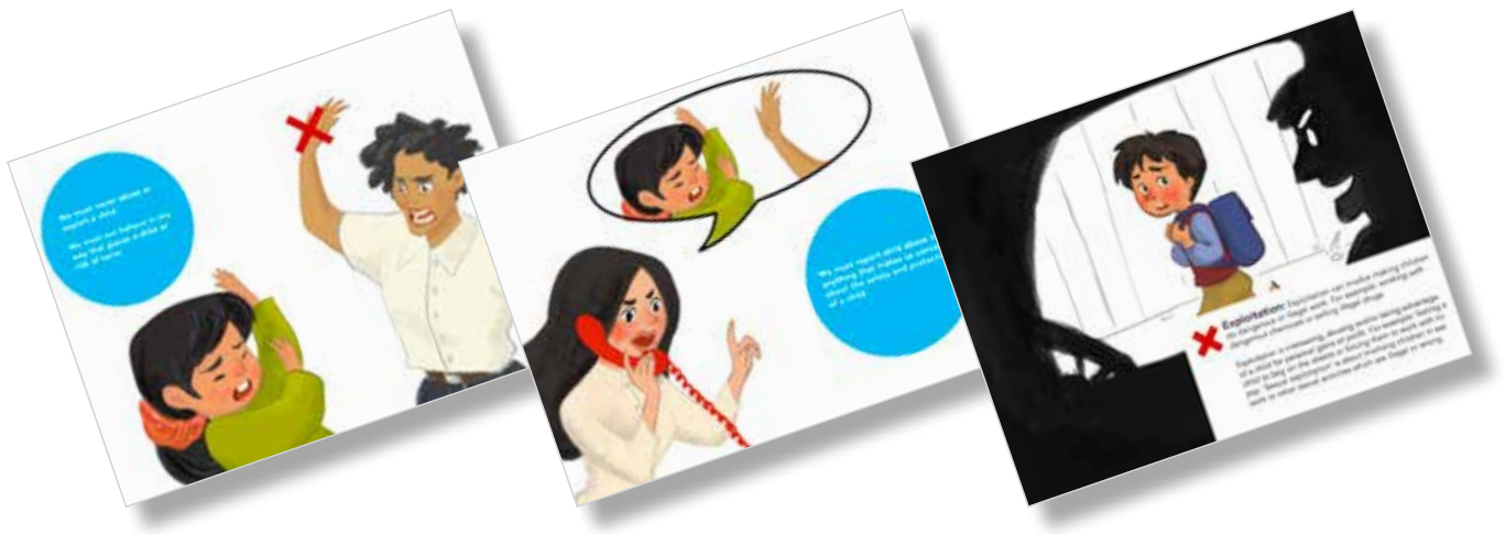
Examples of pages from the child-friendly version of Plan International's Child Protection Policy, Say yes! to keeping children safe .