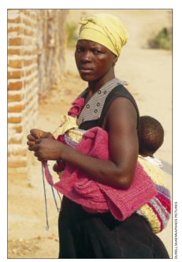
Life events and economic stressors are associated with episodes of depression

Cycle of poverty, disability, and depression—The relation between depression and change in economic status has been examined in cohorts derived from a clinic based case-control study.22 23 Economic stressors, such as having experienced hunger in the past month, were associated with both the onset of new episodes of depression and the persistence of existing episodes. Disability scores (including social, functional, and psychological) were twice as high in subjects with depression throughout the follow up period, independent of economic status.<sup>11 22 23</sup> Depressed people visit health services frequently and also consult private doctors and traditional medical practitioners. This is associated with high financial costs of health care.11 30 Similar findings in other developing countries suggest a vicious cycle of poverty, depression, illness, disability,