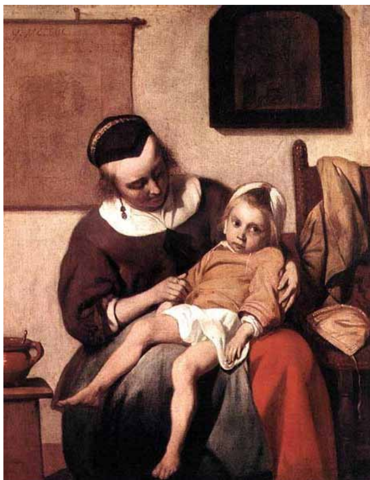
The Sick Child. Gabriel Metsu (c1660) Rijksmuseum, Amsterdam