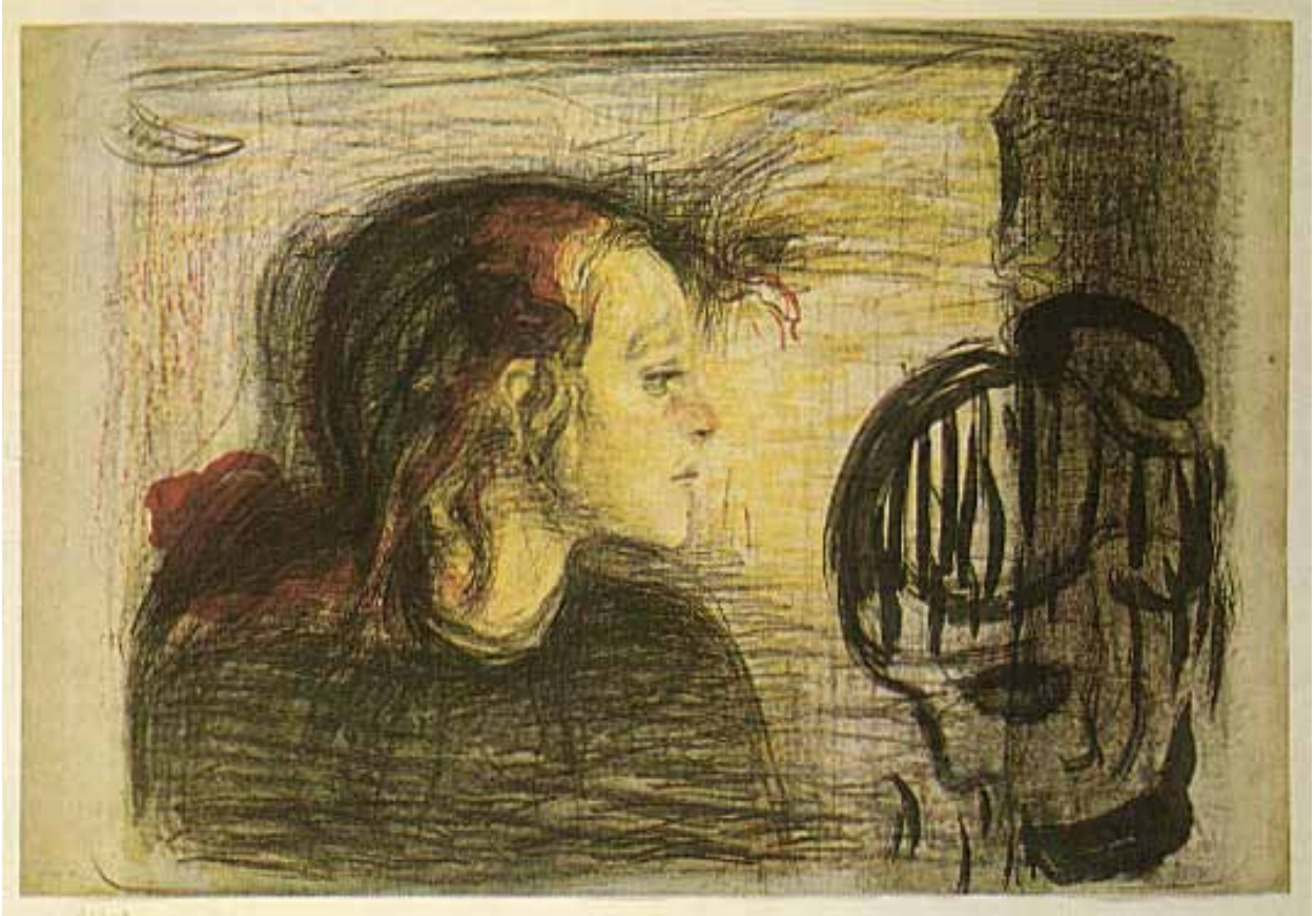
The Sick Child. Edvard Munch (1885), the Munch Museum, Oslo.

problems, assessment at this stage needs to take particular note of both physical and psychosocial contributory and maintaining factors. The best approach is to use a bio-psycho-social framework, whereby the relative contribution of biological, psychological, family and social factors is considered. However, if symptoms persist even after this level of assessment and intervention, which includes targeting the identified bio-psycho-social factors, or if symptoms are particularly severe, or there is diagnostic uncertainty, the child should be referred to a mental health service.