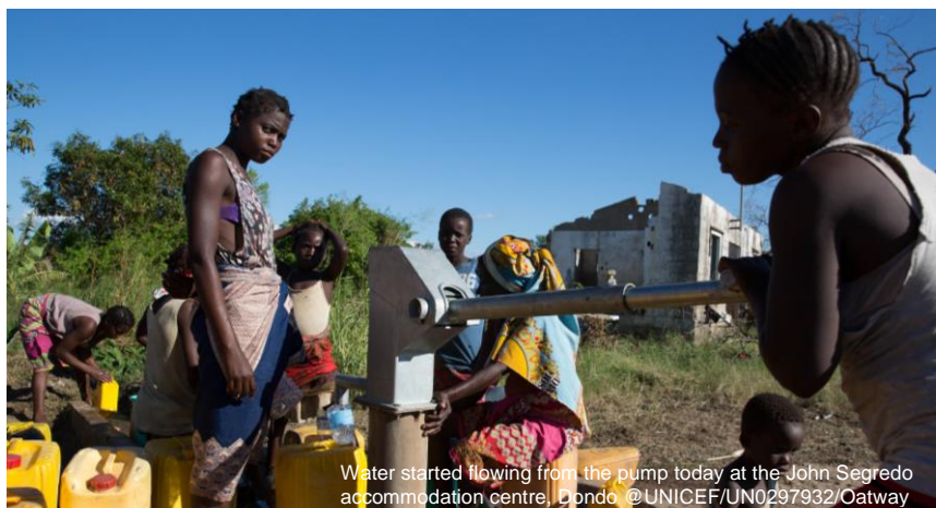
Water started flowing from the pump today at the John Segredo accommodation centre, Dondo.