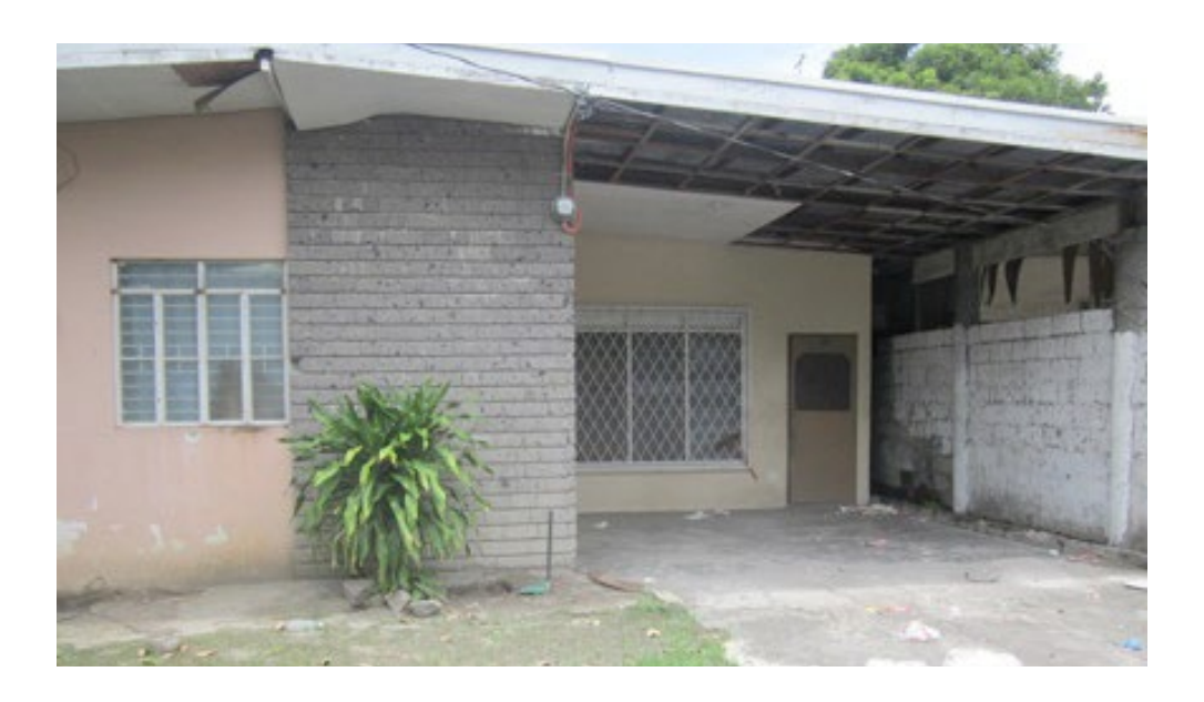
Alleged cybersex den in Angeles City

Webcam child sex tourism dens are locations in which several children are either hired or trafficked and kept against their will to perform webcam sex shows. These dens are sometimes run by criminal organizations of varying sizes and degrees of sophistication. In some cases, dens are run by foreign (non-Filipino) nationals. There is a range of varieties of webcam child sex tourism dens, from home-based operations that exploit groups of children from the same neighbourhood, to organized criminal groups that run large-scale underground online brothel operations. Front companies, such as Internet cafes or information technology companies, often conceal these dens.