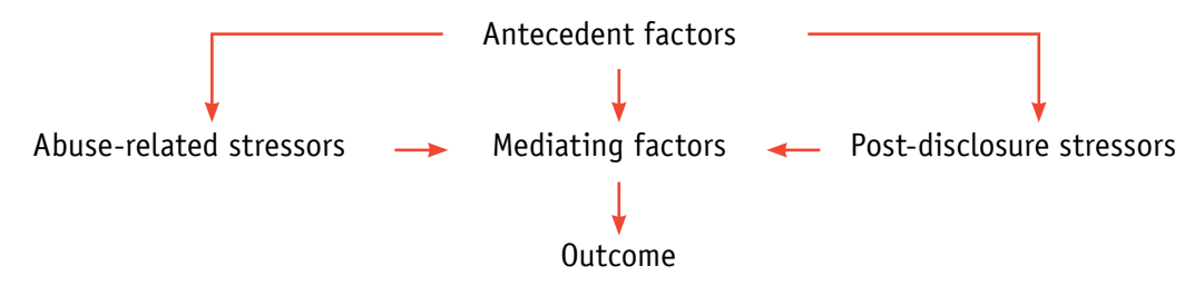
Figure 1. A conceptual model of the pyschopathology of child sexual abuse (Nurcombe et al., 2000)

Factors influencing the dynamics that play a role in the traumagenic effect of child sexual victimization are displayed in Figure 1.