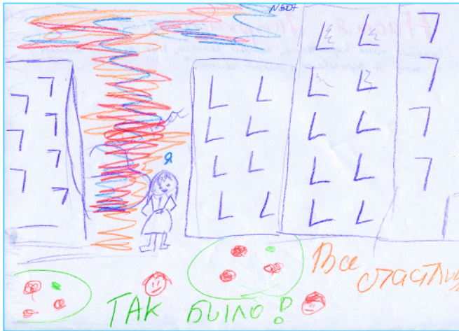
Donetsk. Girl, 11 years old. "It was! Everybody is happy." The drawing has the psychologist's comment: "At first she had drawn a tank, but then she said she didn't want tanks in the city and covered it with a "sunset".

Amidst rapid geopolitical changes and military operations in Ukraine in the recent months, UNICEF initiated a rapid assessment of the psychosocial status of children in four cities of Donetsk Oblast to gain first-hand perspective of the impacts of the crisis on children and families. Assessing and responding to psychosocial needs is one of UNICEF's Core Commitments in the event of a humanitarian or crisis situation.