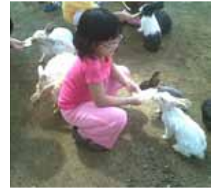
In 1873 animals had rights but children did not. In 1989, children had rights too! (CRC,1989)