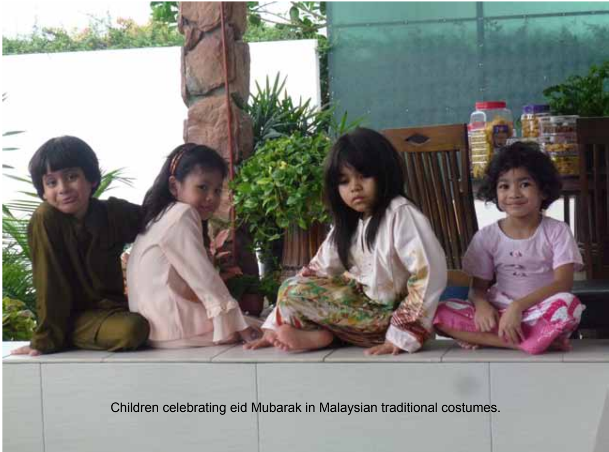
Children celebrating eid Mubarak in Malaysian traditional costumes.