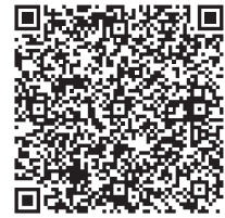
Table 4. Provider Resources

For more information about screening for depression in adults, refer to the resources listed in Tables 4 and 5. For educational products for Medicare Fee-For-Service health care professionals and their staff, information on coverage, coding, billing, payment, and claim filing procedures, visit http://www.cms.gov/Outreach-and-Education/Medicare-Learning-Network-MLN/MLNProducts/PreventiveServices.html on the CMS website, or scan the Quick Response (QR) code to the right with your mobile device.