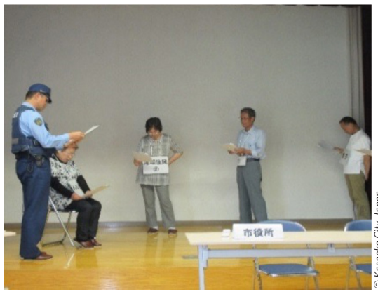
Training programme of the "SOS" network, Japan