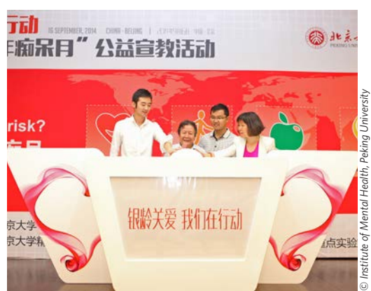
Dementia awareness campaign, Beijing, China