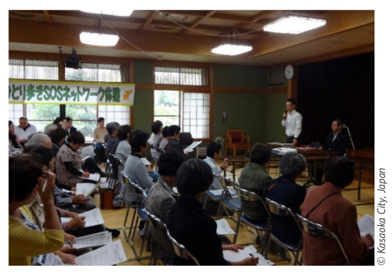
A community workshop on dementia, Japan

Social interaction and support enhance the mental well-being of older people. Various groups in the community can engage older people and foster positive relationships by creating elderly-friendly initiatives, programmes and opportunities. For example, a theatre company in Japan specializes in staging shows with the theme of ageing (see bottom-right photo below).