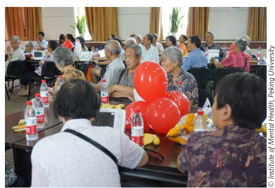
Memory café, Beijing, China