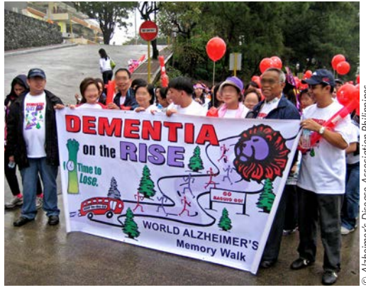
Dementia awareness campaign, Baguio City, Philippines

Raising public awareness promotes a deeper understanding of dementia, the needs of people afflicted with the disease and how the community can offer support. In addition, government agencies, non-profit organizations, charities, volunteer groups and other stakeholders can be mobilized to raise funds for dementia-related campaigns and activities.