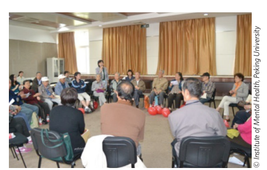
Caregiver support group, Beijing, China

As a community worker, you can encourage carers to provide proper care and practise self-care. Give them educational materials, such as the Pocket Guide in this Toolkit (see Appendix VII ) or inform them about WHO's iSupport for dementia (see Appendix VIII ) so they can learn how to take care of others and themselves. If it is possible to organize seminars or training workshops on a variety of relevant issues such as coping skills, encourage carers to find time to attend these. They may also be able to find support in their community.