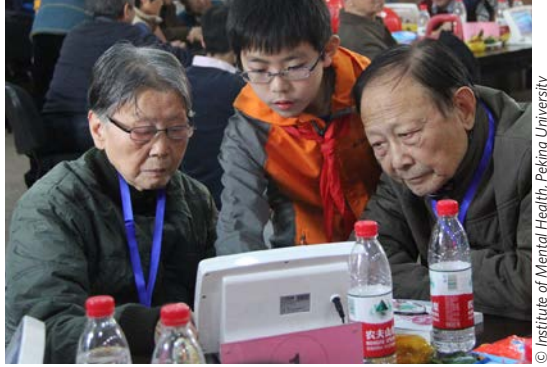
Memory café, Beijing, China

In some countries, memory cafés or dementia cafés are situated within a community to provide a safe and caring space for older people and their carers. Activities organized by such a place could be exercise classes, social activities and educational talks. It is also a place where carers may meet and find support among other carers, allowing them opportunities for social interaction as well.