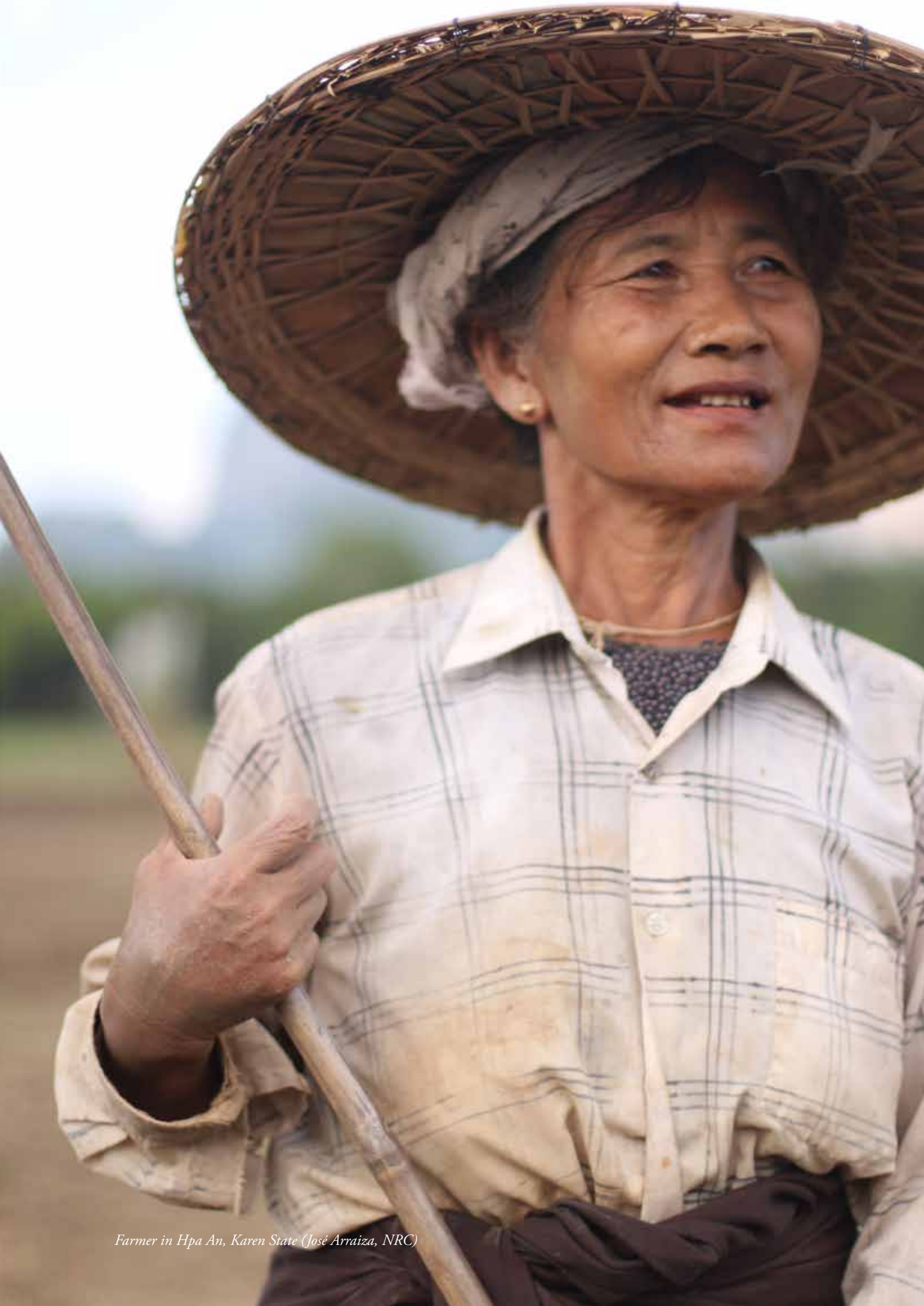
Farmer in Hpa An, Karen State