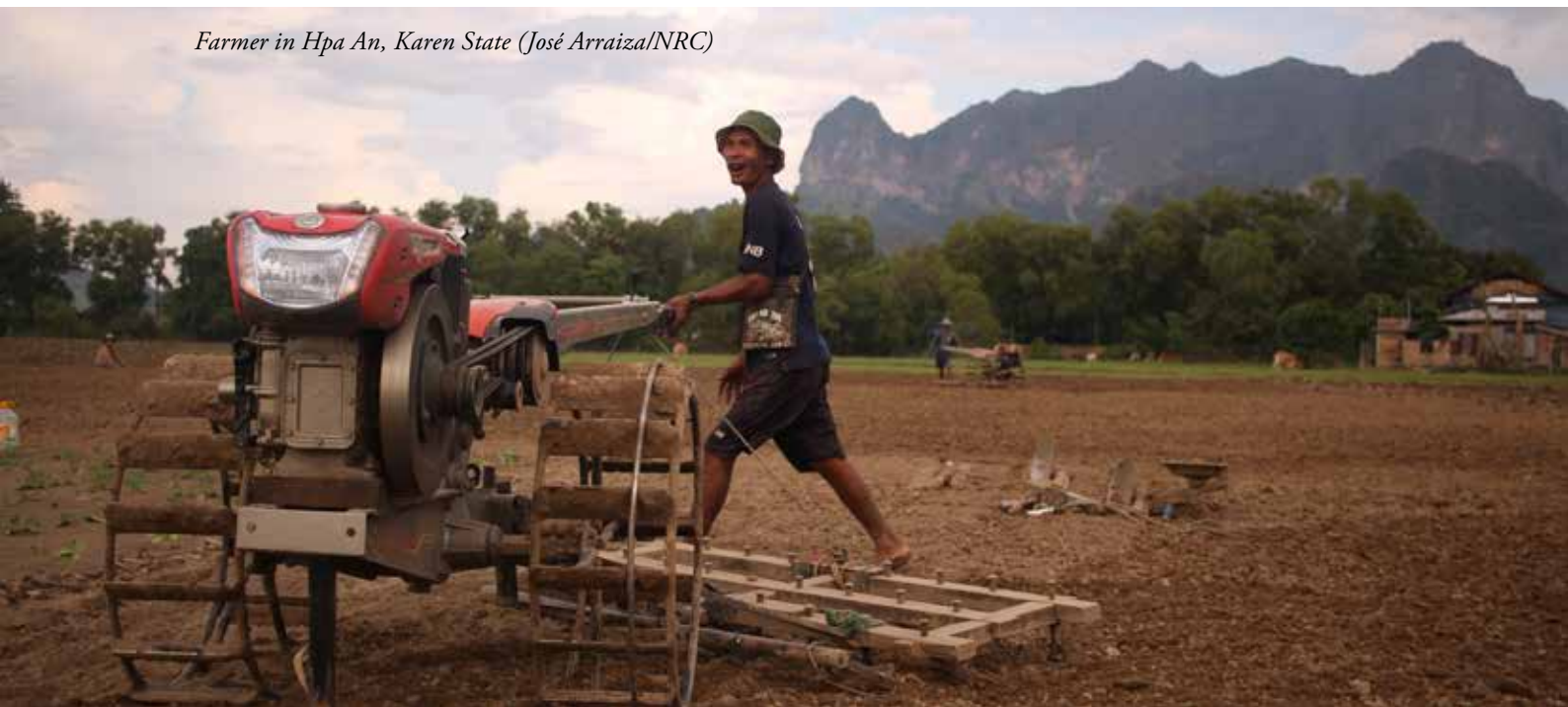
Farmer in Hpa An, Karen State (José Arraiza/NRC)

8. Several of the ethnic actors with whom the government is currently engaged in peace talks have also addressed restitution in detail, with others expected to do the same. The Karenni National Progressive Party (KNPP) has addressed land issues within an emerging land policy, while the December 2015 Land Policy of the Karen National Union (KNU) notes that “internally displaced persons have the right to reoccupy their land, which they owned previously, and to receive compensation” (1.1.7); “1.2.5 – To recognize, prioritize and promote the rights of restitution of refugees and displaced persons who have been forced from their lands, livelihoods and homes”; and “1.2.9 – To establish an appropriate, accessible and effective system for addressing and remedying tenure-related grievances and disputes”.(See Box 7) Article 4.2 of the KNU Policy specifically mentions their intent to comply with the Pinheiro Principles and to work closely with government bodies including the Central Land Committee to address restitution demands. Discussions are currently underway in Shan State, Mon State and elsewhere by ethnic groups to develop their own policies in this regard.