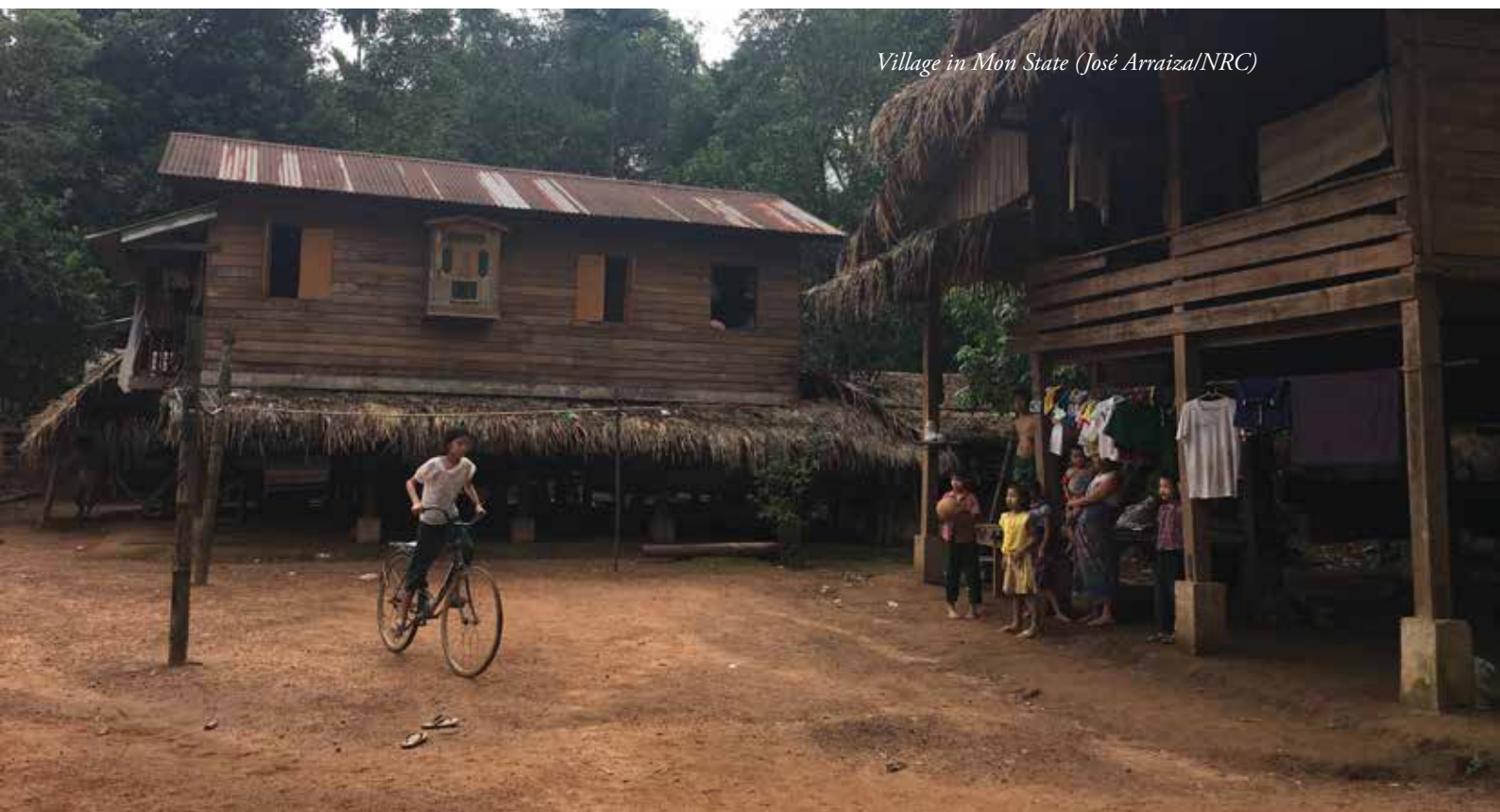
Village in Mon State

37. Myanmar Context: If any of the current measures proposed by the Myanmar government were applied differently to distinct ethnic, religious or other groups without a reasonable justification, such measures would clearly be discriminatory and thus violate both international and domestic laws. Protections against such acts will need to be included in any eventual restitution law and programme.