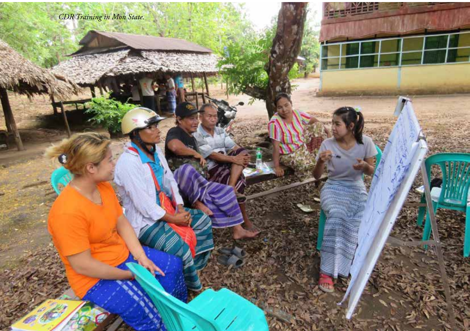
CDR Training in Mon State.

26. Loss or Destruction of HLP Records and Other Evidence of Ownership and Residence can also undermine restitution guarantees. Protecting the physical integrity of housing, land and property records combined with ensuring rights to access them by claimants and whatever adjudicative body may be deciding restitution claims, the possibilities of successful restitution are measurably enhanced.