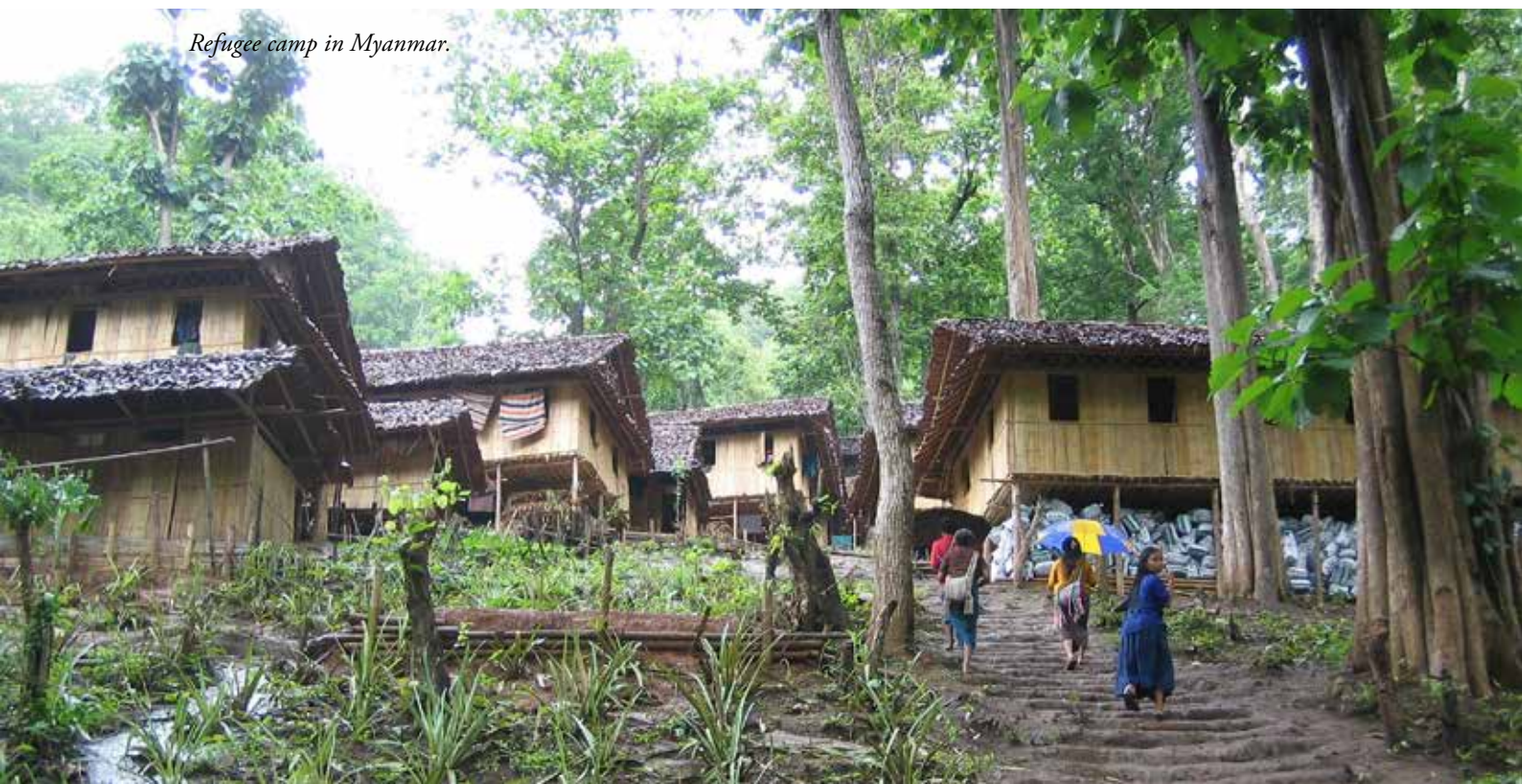
Refugee camp in Myanmar.

15. Inconsistent Legal and Regulatory Frameworks have hindered restitution programmes in a variety of countries. Effective restitution can only occur when the national legislative structures are internally consistent, as well as fully compatible with whatever additional agreements (such as peace agreements, voluntary repatriation agreements and other standards) may exist. All countries that have undertaken to confer restitution rights to refugees and displaced persons have had to adopt new laws governing the restitution process, and frequently have had to repeal or amend earlier laws that were subsequently seen to be incompatible with more current efforts at restitution.