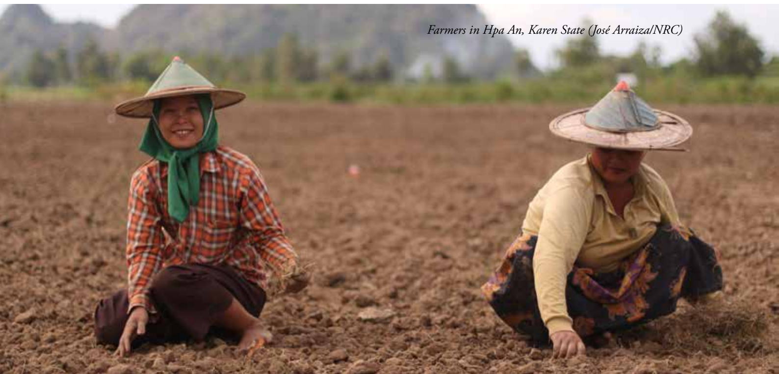
Farmers in Hpa An, Karen State

58. Principle 2.2 articulates the responsibility of States to 'demonstrably prioritize the right to restitution as the preferred remedy for displacement'. While significant and laudable steps have been taken over the past several years in Myanmar to place restitution concerns ever higher on the political agenda in the country, once again it would be difficult to argue that restitution is the preferred remedy for displacement when just a small portion of those with outstanding restitution claims have actually been either able to recover their original homes and lands or receive just and satisfactory compensation at levels consistent with generally accepted norms.