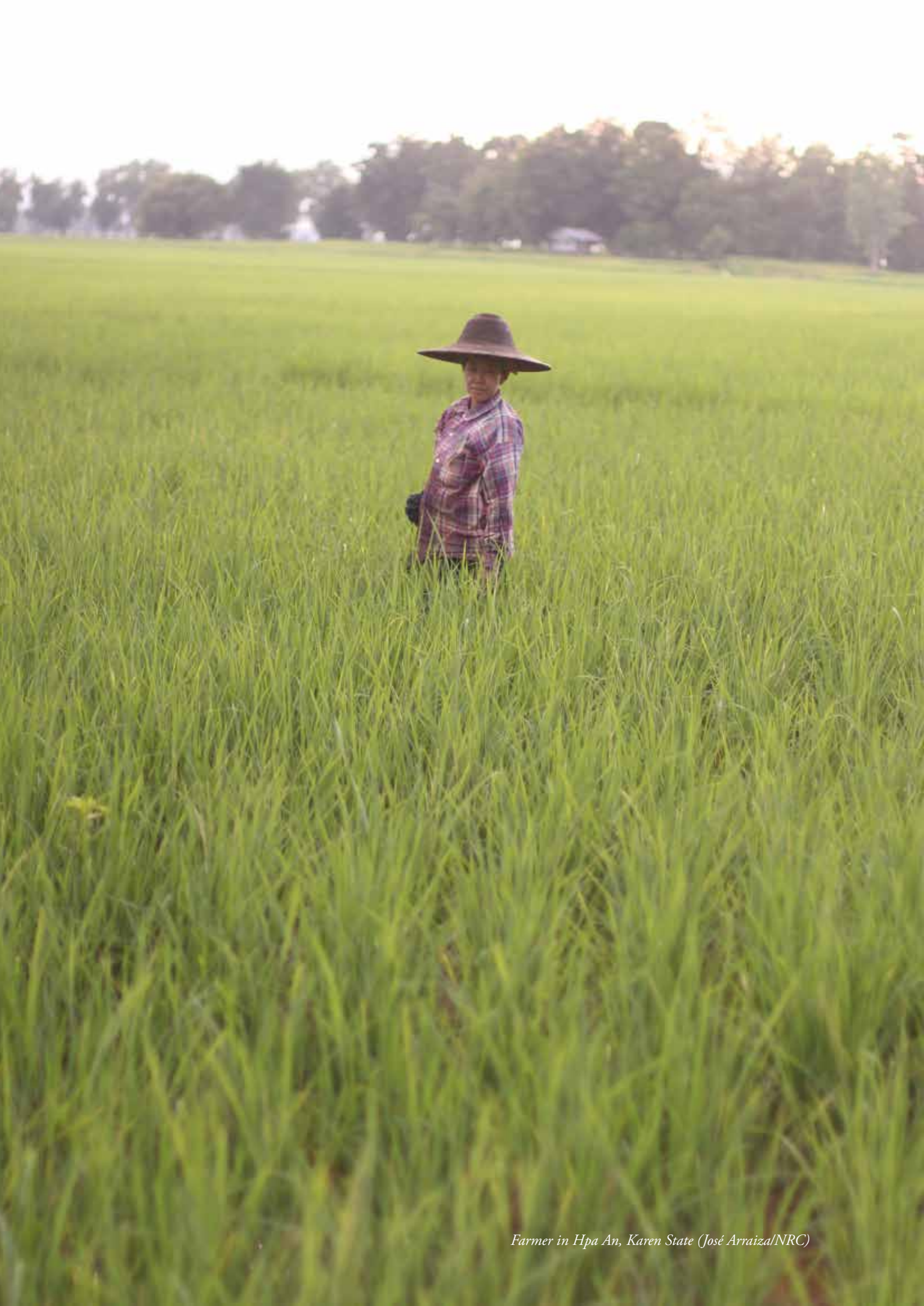
Farmer in Hpa An, Karen State