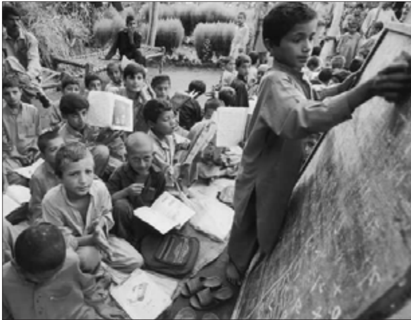
Literacy classes in an Afghan refugee camp in Pakistan

and CCF sought to generate community support for the education of Roma children. This took many forms: in some communities, Roma children were escorted to school by other children; in more hostile areas they were escorted by parents. Both organisations also sought to include the Roma in wider community activities, such as sport or cultural activities like dance.