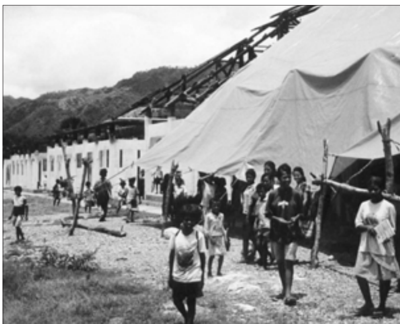
A makeshift school in East Timor

In 2002–2003, the UNESCO International Institute for Educational Planning (IIEP) and Section for Support to Countries in Crisis and Reconstruction are developing a joint programme to ‘build governments’ capacity to plan and manage education in emergencies’. Beginning with the documentation of case studies that illustrate different emergency profiles, researchers will review education responses in East Timor, Honduras, Kosovo, Palestine and Rwanda. In addition to drawing out lessons learned and producing a series of policy studies, materials will be developed to conduct training with ministries of education (Talbot, 2002). Concurrently, the UNESCO International Bureau of Education (UNESCO IBE) is undertaking a study on curriculum change and social cohesion in conflict-affected societies (Tawil and Harley, 2002). Research will take place in Bosnia-Herzegovina, Guatemala, Lebanon, Mozambique, Northern Ireland, Rwanda and Sri Lanka.