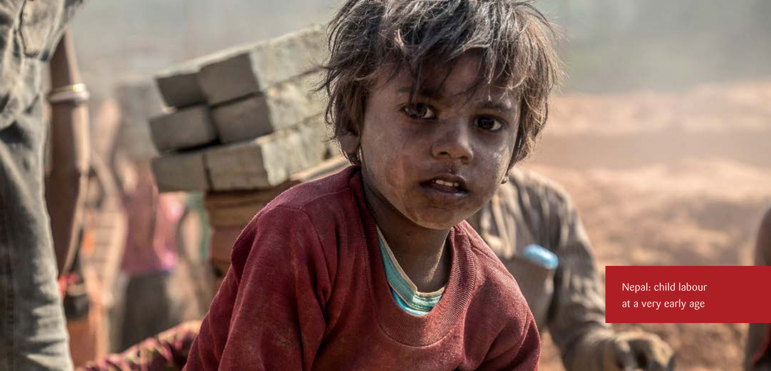
Nepal: child labour at a very early age