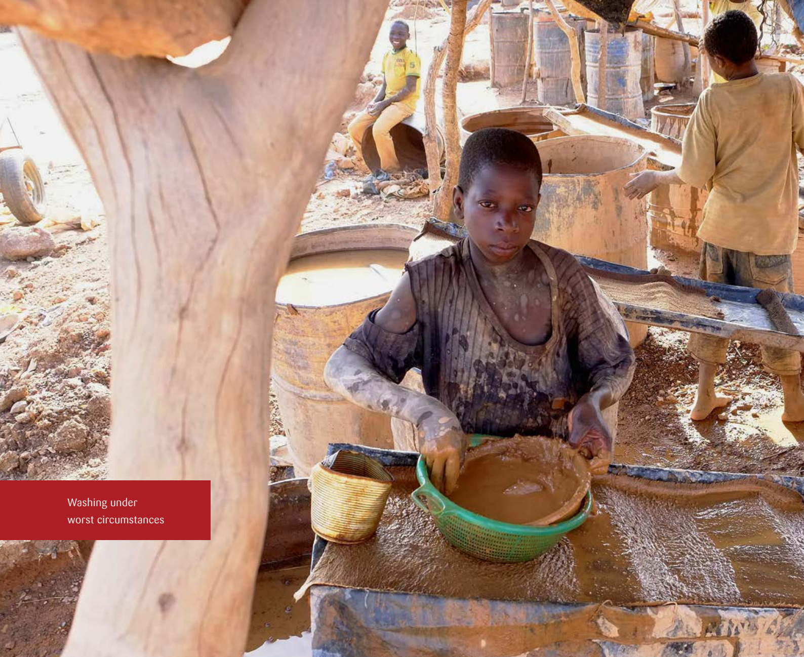
Washing under worst circumstances

record world gold prices in recent years, has led to a boom in the gold mining sector. Gold digging acts as a pull factor for child labour as it is seen as an alternative source of income and a potential way to earn money quickly. Children rush to new gold sites dreaming of a better future from the money to be made from gold. 37