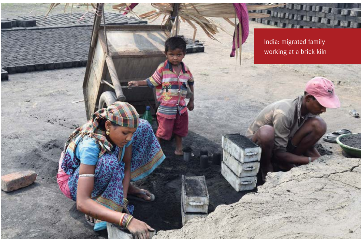
India: migrated family working at a brick kiln