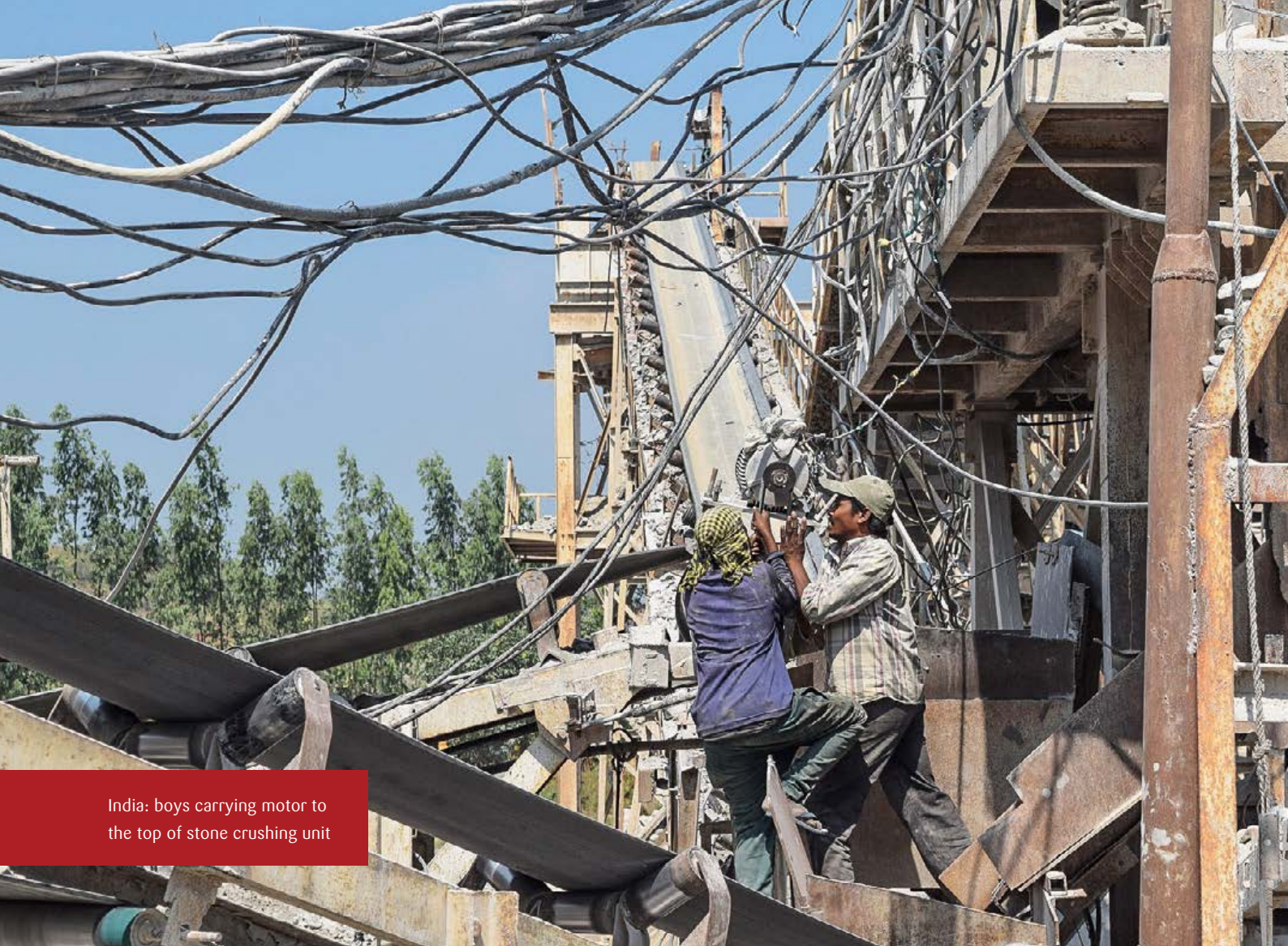
India: boys carrying motor to the top of stone crushing unit

146,000 seasonal migrant workers left Odisha for other states in 2015, compared to 87,000 in 2008. 60