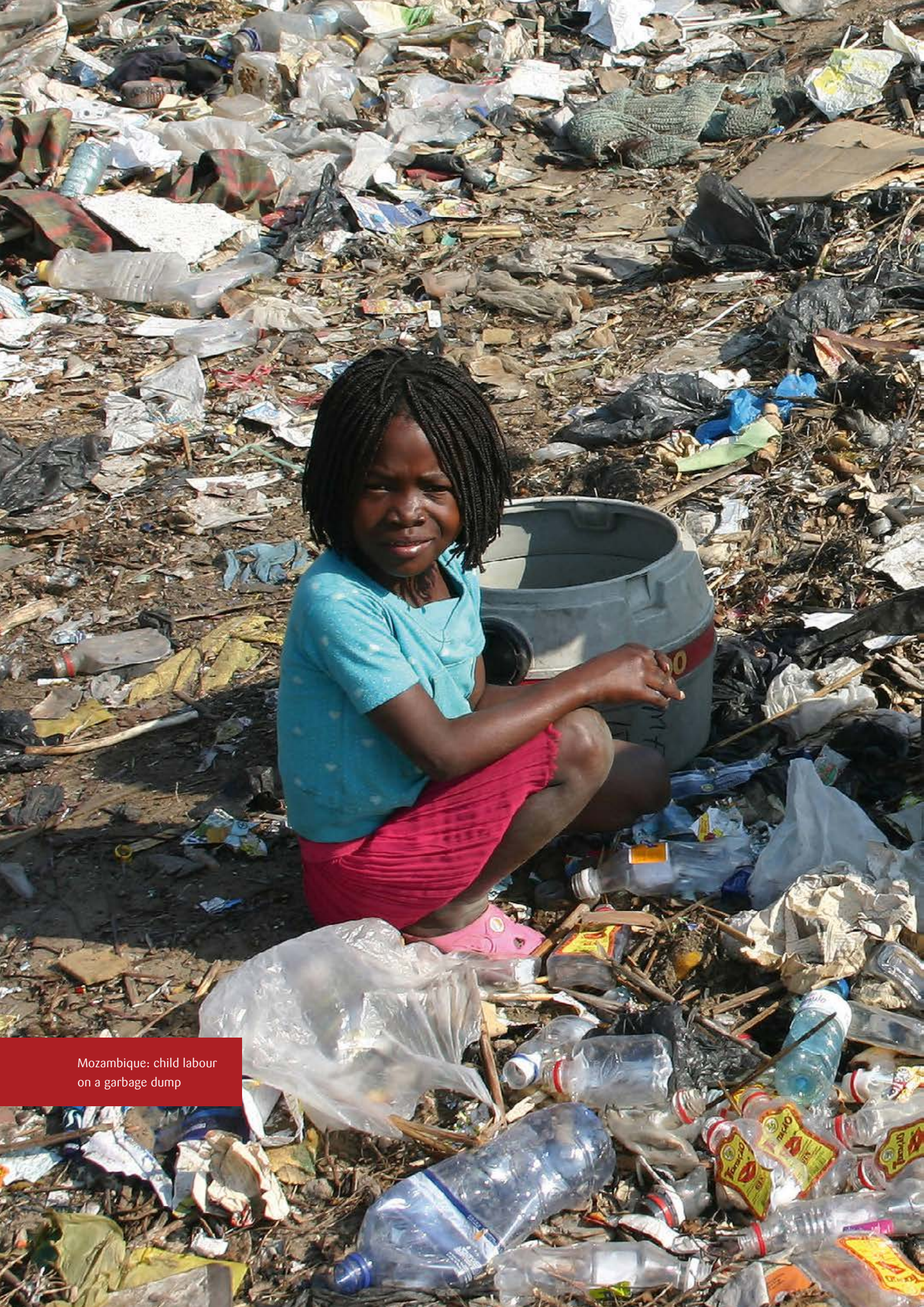
Mozambique: child labour on a garbage dump