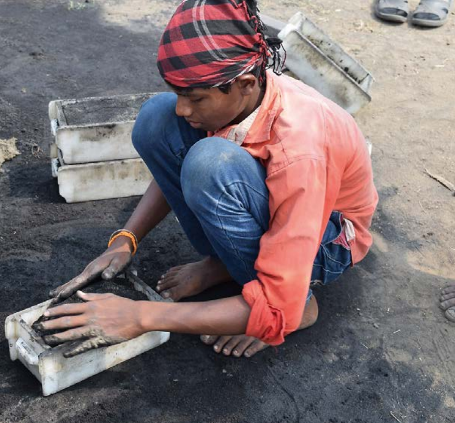
India: migrated young boy working at a brick kiln