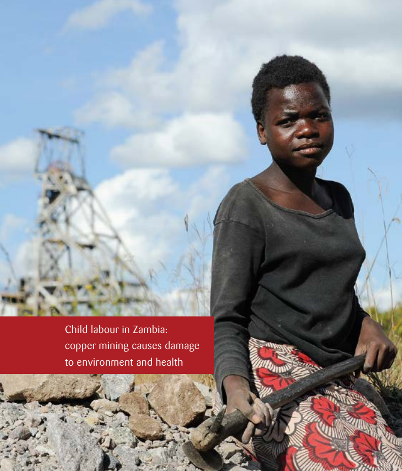
Child labour in Zambia: copper mining causes damage to environment and health