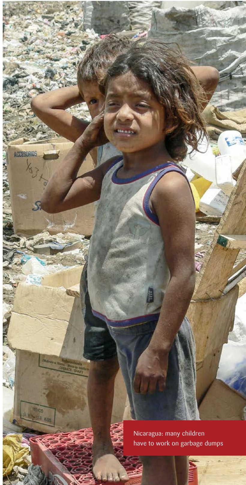
Nicaragua: many children have to work on garbage dumps

In addition, waste pickers themselves unite in cooperatives and networks to strengthen their influence on market prices, to maximize utilisation of waste, to share knowledge and build capacity and to improve their working conditions. In 2010, the network Red de Emprendedores Nicaraguenses del Reciclaje (REDNICA) has been established which has now members in departments of Matagalpa, Jinotega, Esteli, Tipitapa, Leon, Ciudad Sandino, Bluefields and Managua. The members understand themselves as part of the solution – their recycling activities contribute to a sustainable development. 110