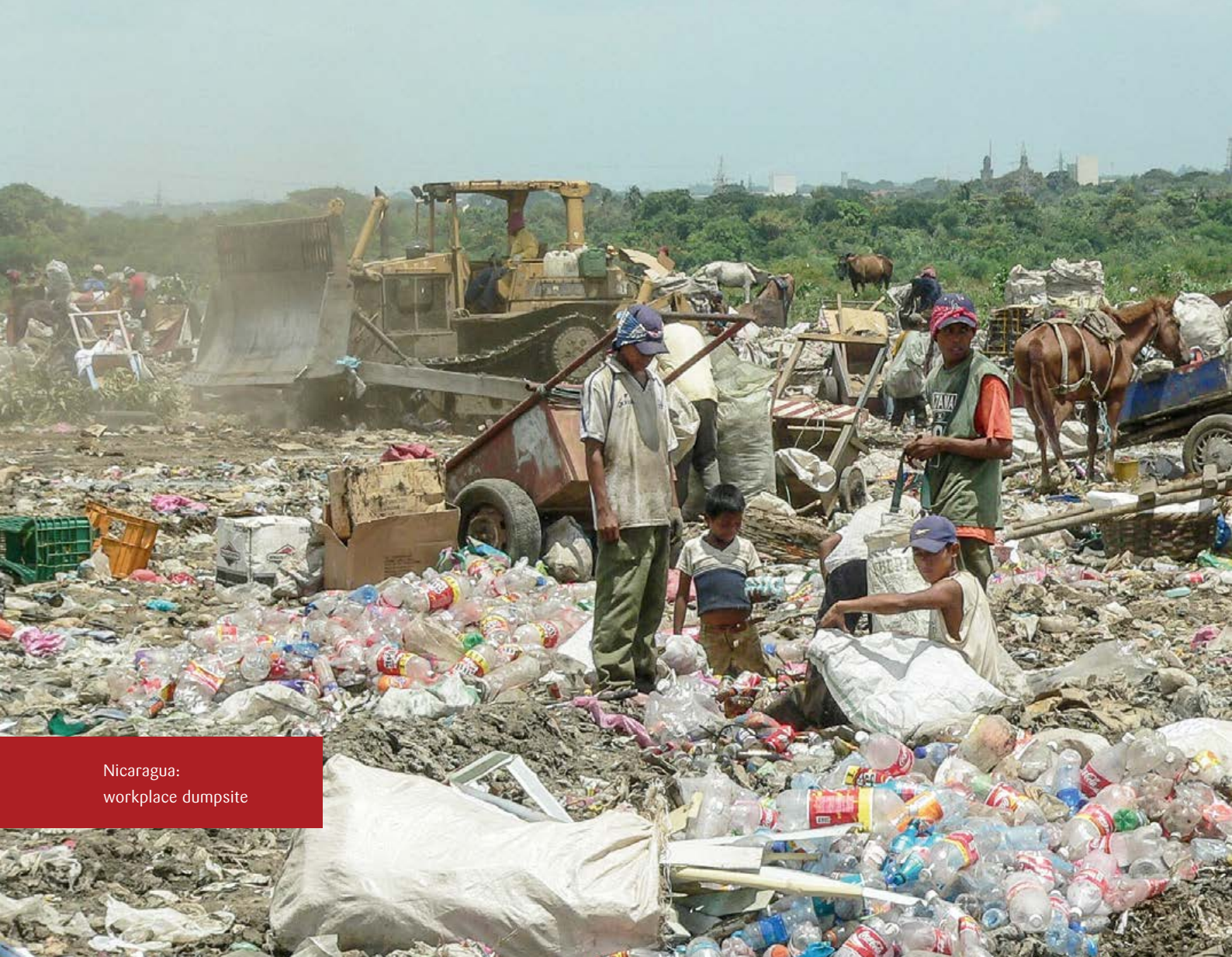
Nicaragua: workplace dumpsite

new arrivals, due to insufficient infrastructure, services, drinking water or food.