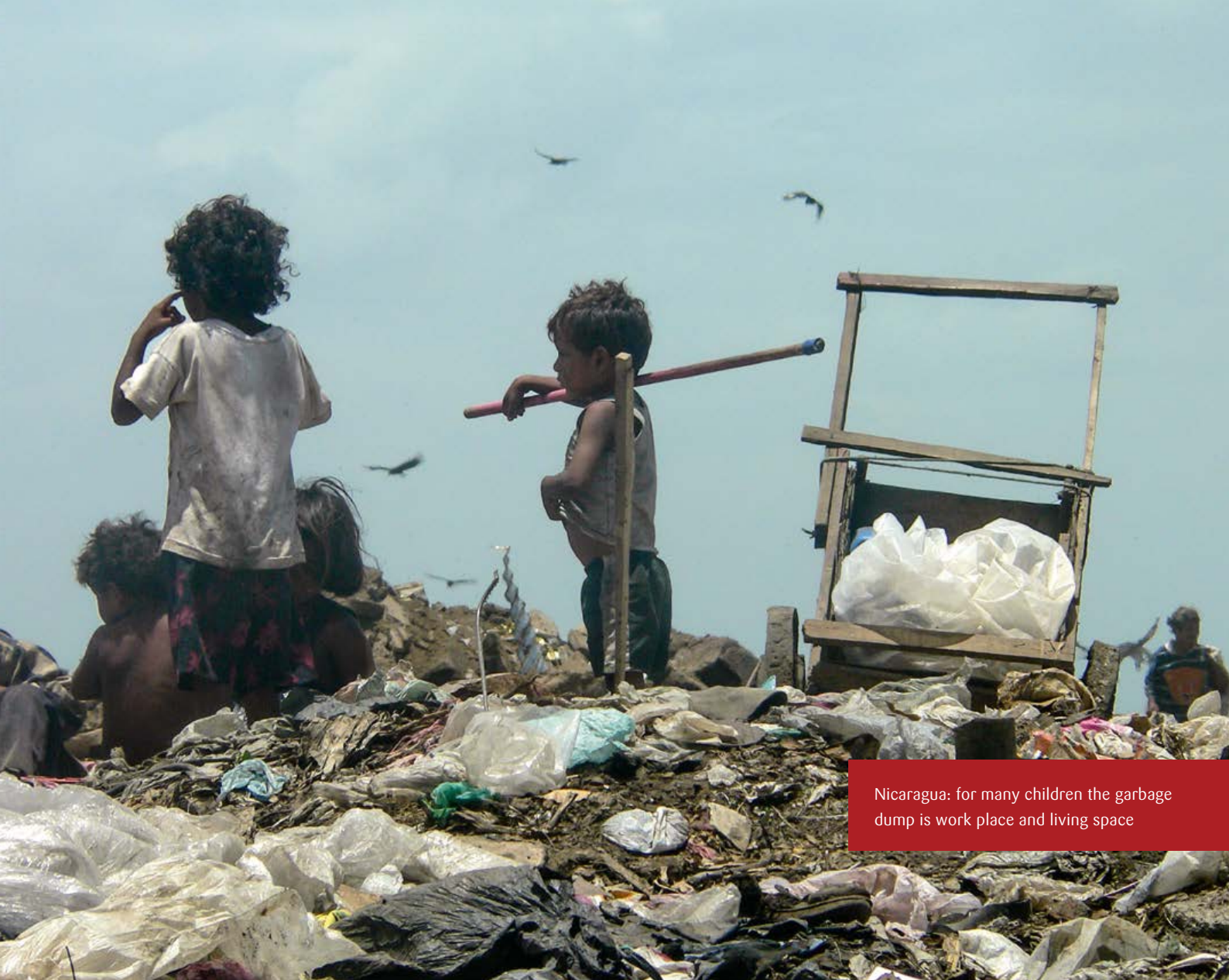
Nicaragua: for many children the garbage dump is work place and living space