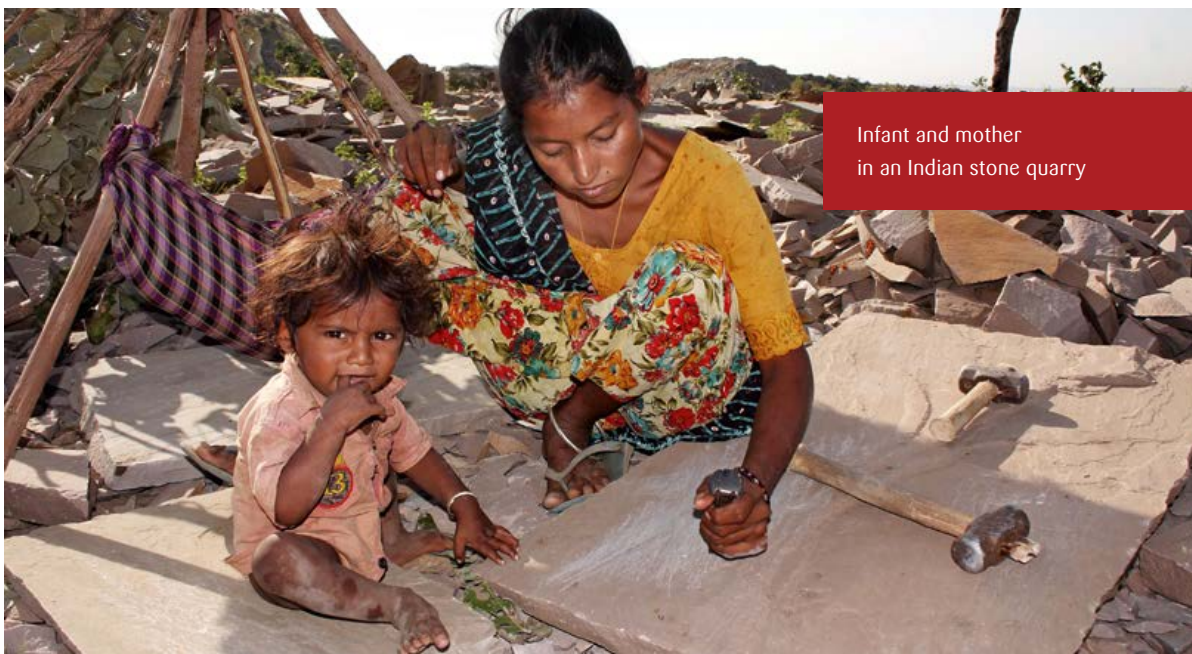
Infant and mother in an Indian stone quarry