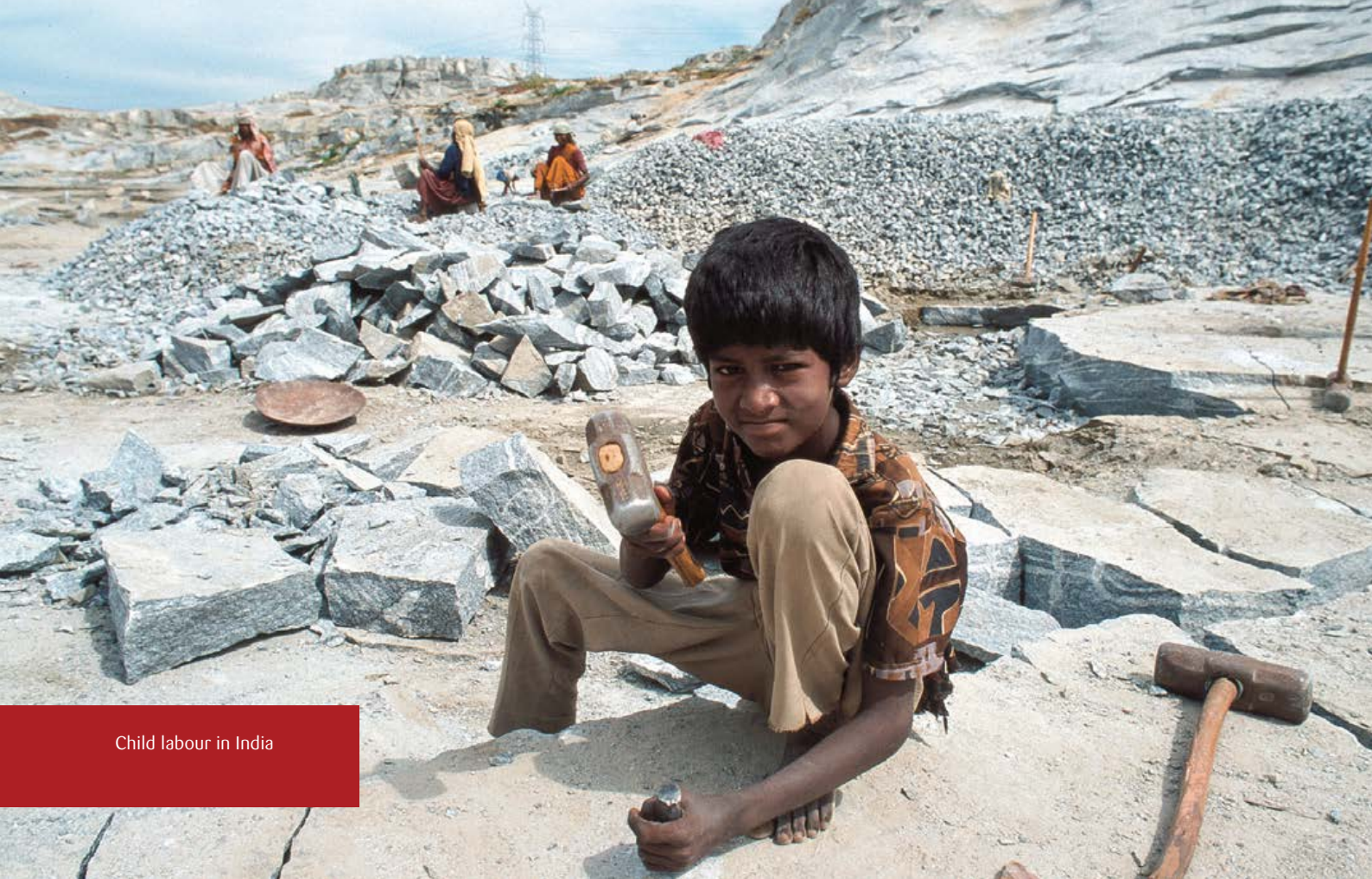
Child labour in India