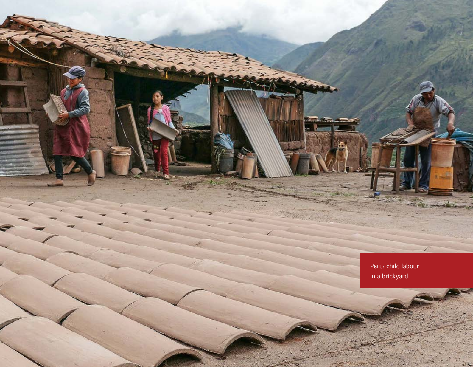
Peru: child labour in a brickyard

Terre des Hommes works to protect children in dangerous and exploitative labour conditions in Peru. This case study includes information from a project run by the Asociación Civil Inti Runakunaq Wasin in Cusco and its surrounding rural areas, which supports 350 children between the ages of 10 and 17.