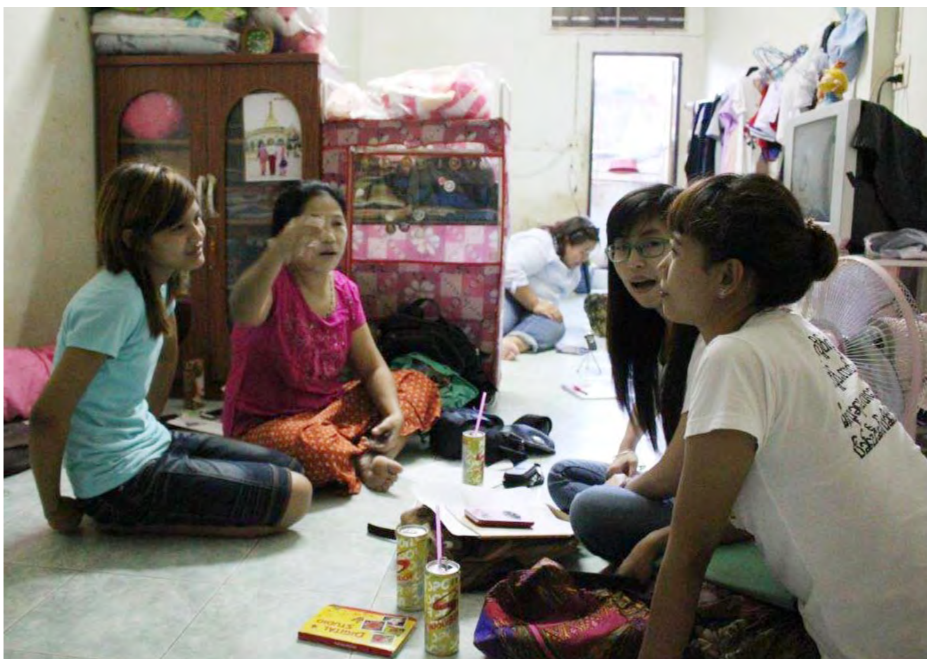
LPN staff visiting a 16-year-old girl who works in a shrimp processing unit

14-year-old: You won't be able to. The work is too hard.