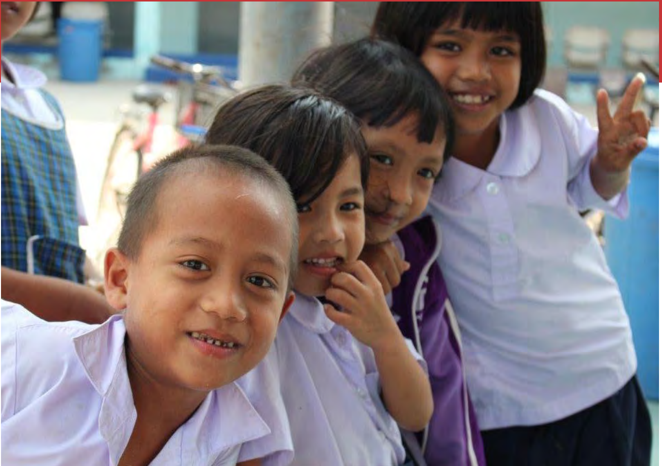
Children from Myanmar go to a Thai school cooperating with LPN