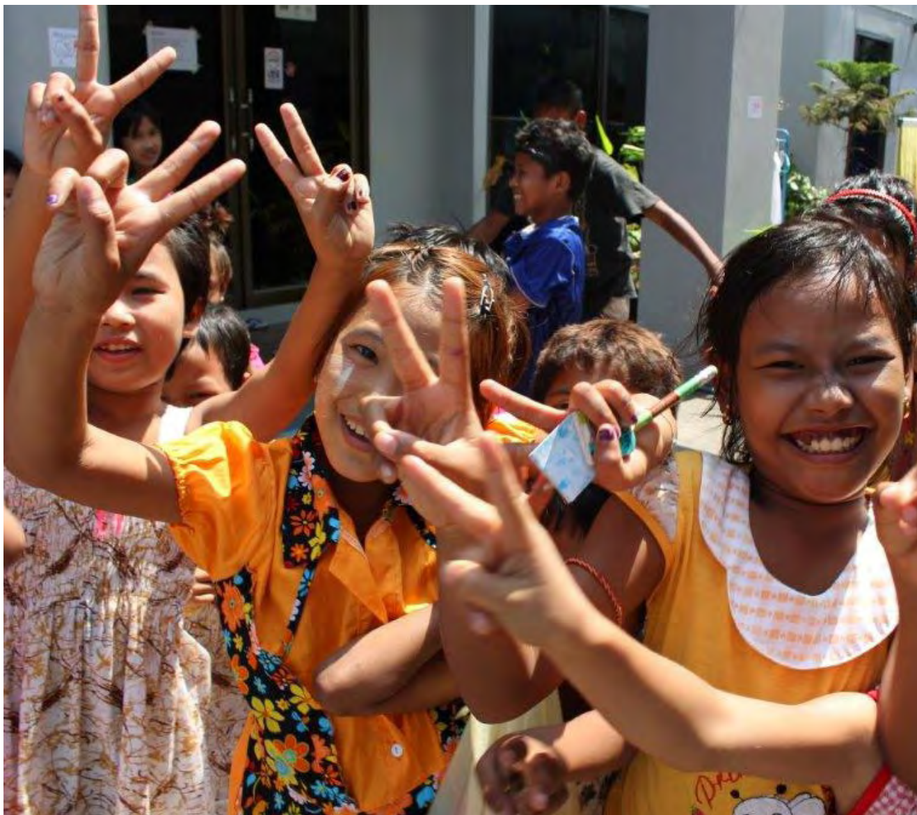
Migrant children at the LPN center in Samut Sakhon