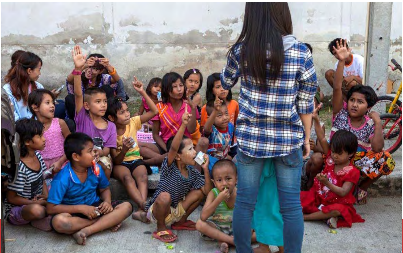
LPN staff researching living conditions and views of migrant children

Of the child workers surveyed, two-thirds were employed in factories that process seafood. The remaining third had previously also worked in this industry and then changed to other fields.