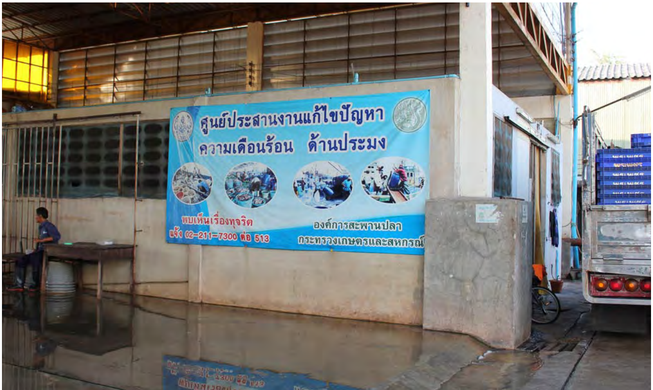
A poster at the port of Samut Sakhon calls on local fishermen to report cases of exploitation and corruption

The shrimp industry also carries direct responsibility for this situation. Their shrimps are fed with fishmeal made from fish that is in part caught by boats engaged in illegal practices and manned by forced labourers.