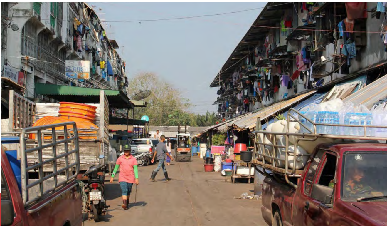
Migrants' homes at the shrimp market of Samut Sakhon

A 2006 law offering workers from Myanmar, Laos and Cambodia legal but limited work visas is theoretically also an immigration policy measure. But the process is so complex and so tangled in red tape that many potential immigrants are forced to hire so-called brokers to deal with the formalities. These 'brokers' demand high fees for their services (ILO 2013b: 26).