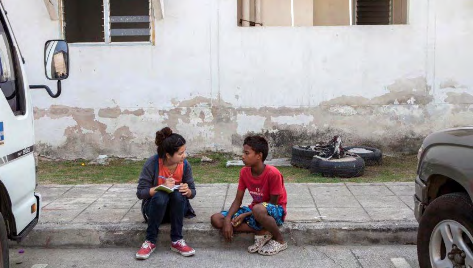
LPN staff member asks migrant child in Samut Sakhon about his life

children either can speak Thai moderately or quite fluently, 29% cannot speak Thai at all (LPN 2015: 39).