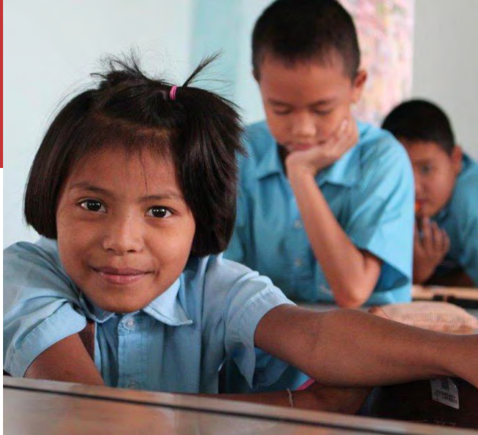
Right to education: migrant children from Myanmar in a Thai school

Conditions in the Thai shrimp industry are exemplary for many sectors of the globalized economy. Companies scour the world for the cheapest suppliers – who produce where salaries and taxes are lowest and environmental and social standards are most lax.