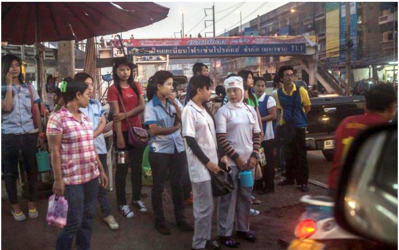
Migrant workers waiting for the bus to their company in the early morning