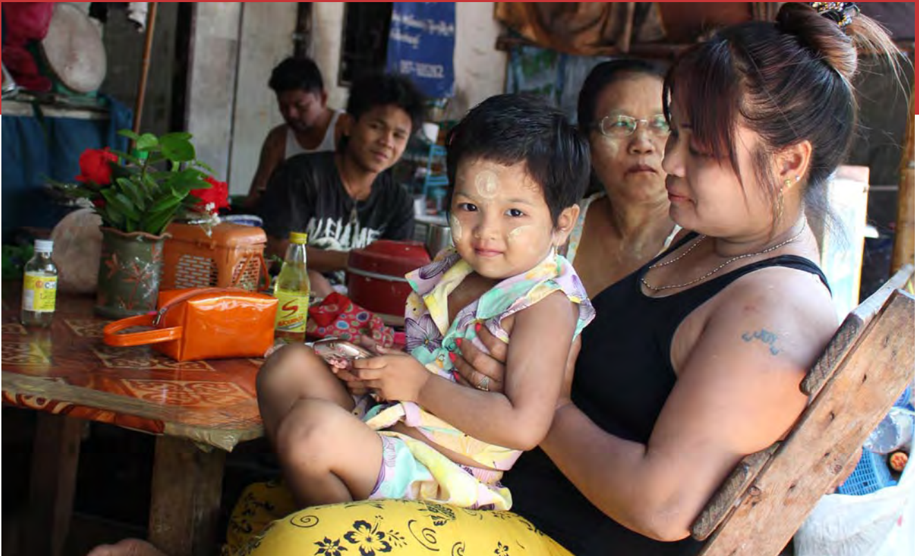
Enjoying a free Sunday: a migrant family from Myanmar in Samut Sakhon