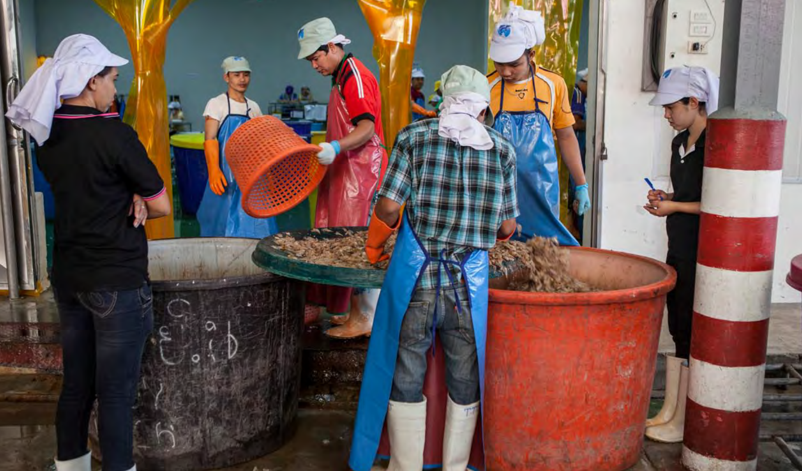
Small shrimp processing plants often work as subcontractors for big companies