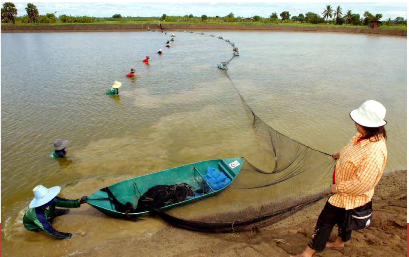
Shrimp farmers wading through a fresh water pond with a net to collect prawns

Larval development usually takes between 23 and 25 days (ILO 2011: 14). Depending on demand, there are an estimated 1,000 to 5,000 small hatcheries in Thailand that rear around 80 billion shrimp larvae each year. The government has supported the establishment of these hatcheries through targeted consultation. Currently, almost all the