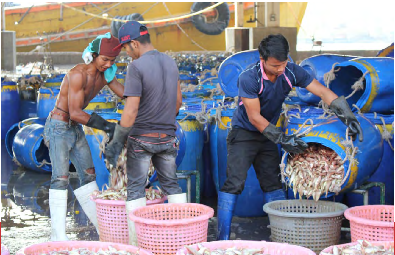
Local fish gets smaller and smaller due to massive overfishing

No comprehensive studies have been done on working conditions on breeding farms. Since most of the farms are small family business and have little need for workers in comparison with the rest of the supply chain, most likely less workers are exploited here than in other areas of the shrimp production industry. It is however necessary to find out whether the families that manage the farms receive an income that allows them to live in dignity.