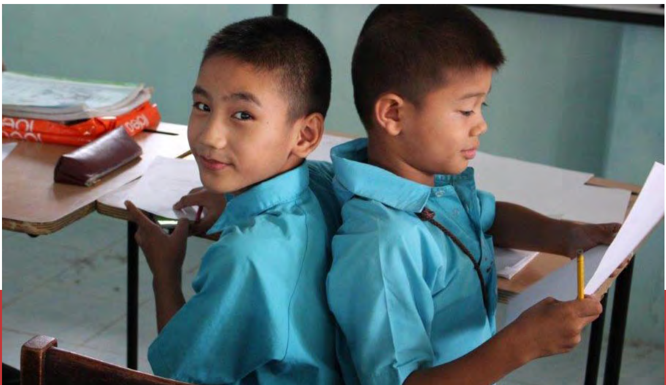
The right to education applies to all children – regardless of their migration status