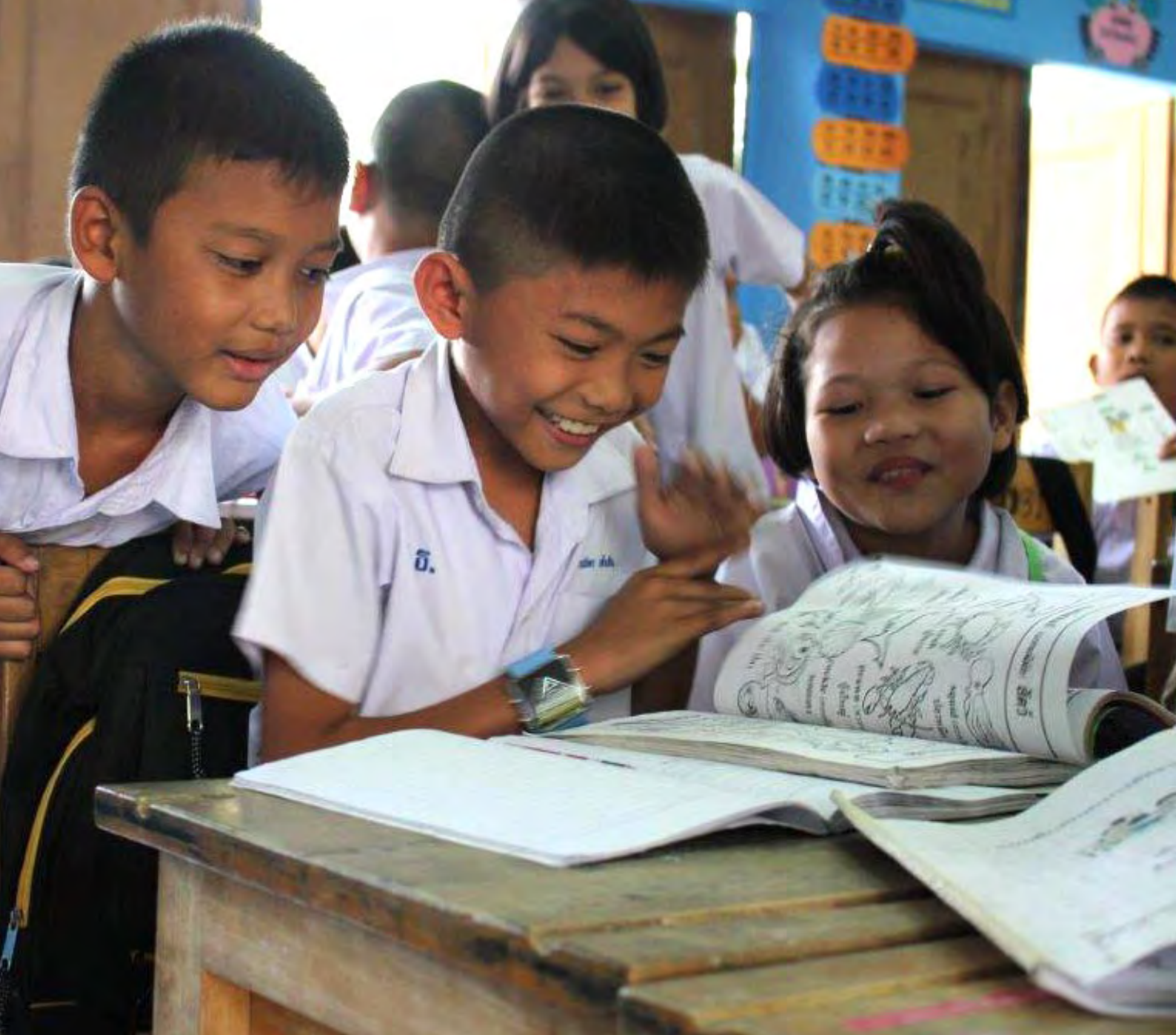
Migrant children in a Thai school

This ruling applies to both Thais and migrants. Furthermore, 12 migrant registration centres should simplify registration process and reduce registration costs while improving the reliability of data. Thailand also plans to cooperate more with its neighbours to stop trafficking and open avenues for legal immigration (Seafish 2014: 3).