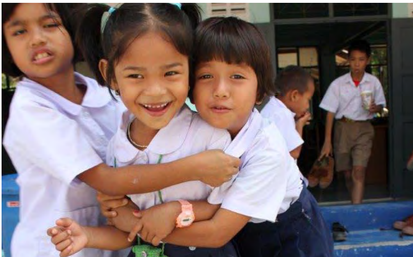
Most migrant children in Thailand come from Myanmar, Cambodia and Laos