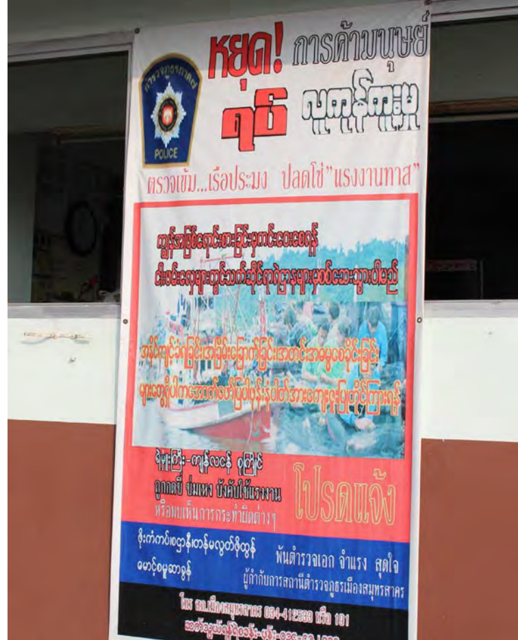
Thai authorities call for an immediate stop of human trafficking and slave labour

Most of the practices described above are in conflict with existing Thai laws. Furthermore, the country has ratified numerous international United Nation and International Labour Organization (ILO) conventions. Although these conventions guarantee worker protection, the government does nothing to enforce them. Neither the ILO convention on freedom of association nor the convention on collective bargaining was signed by the Thai government. This is a clear signal that strong unions are not wanted (Table 8).