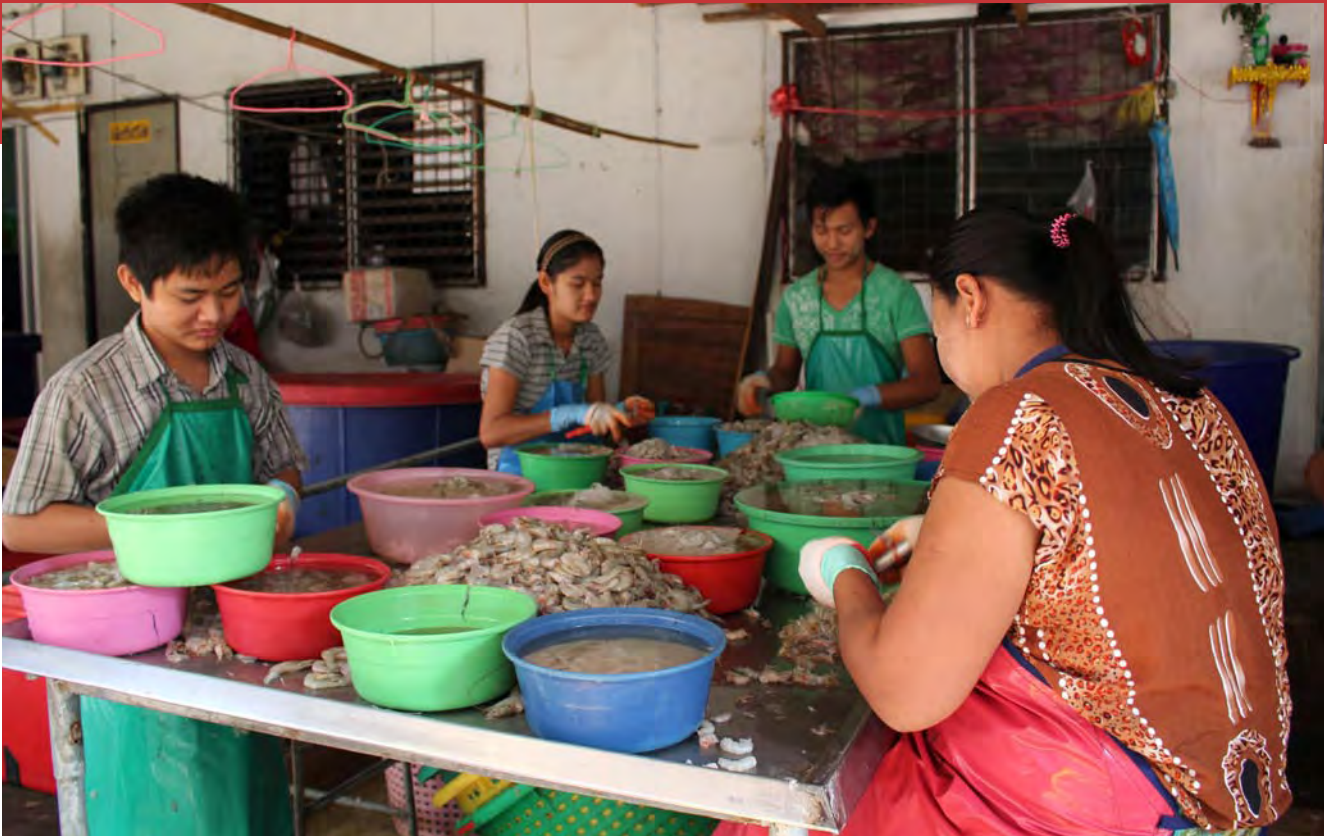
Shrimp peeling migrant family from Mon-State (Myanmar)

The children's main task was to wash seafood and clean it, cut it to size or remove the shells. Some children also worked in factories where seafood is packaged and prepared for freezing. Nine per cent loaded and unloaded vehicles and equipment or were responsible for other transport activities (LPN 2015: 41). The children's labour frequently took place in illegal or semi-legal areas: many of the fish and seafood processing operations in Samut Sakhon are not registered.