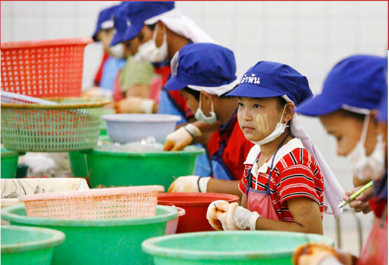
Some migrant children work in shrimp processing units at an early age