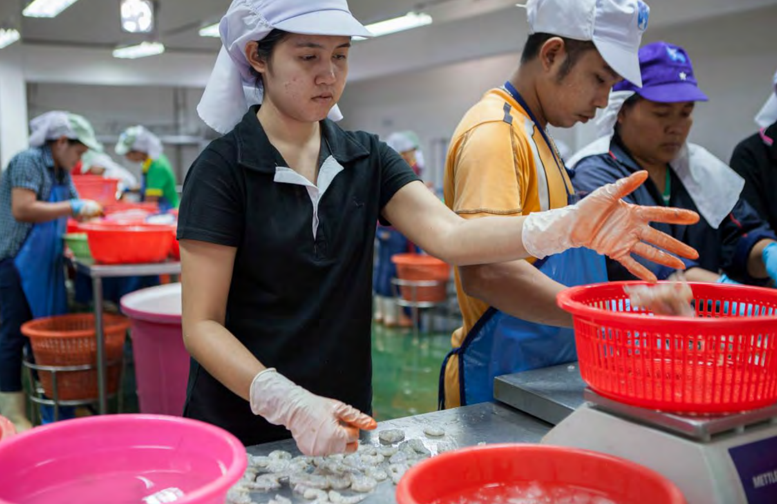
Removing heads, guts and shells: the labour-intensive jobs are done usually in small facilities

break times are not adhered to, many work night shifts from six o'clock in the evening to six o'clock in the morning and most of the children do not attend school (Tang 2013: 33).