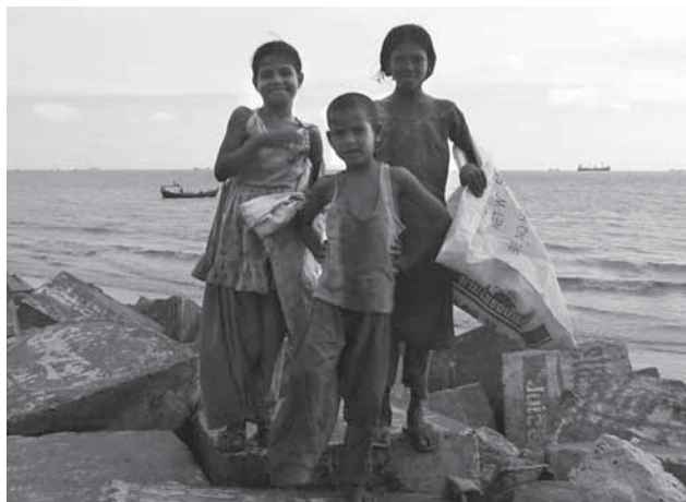
Photo 9 Girls working on Patenga beach (Bangladesh) after attending school.

that some alternatives and to empower them to make decisions for themselves, including the decision NOT to migrate in communities where this has become the norm. It seems that the recent priority given to the importance of attending school may have prevented some project planners from appreciating the importance of making other alternatives available to children, which are better than the ones facing them. If a child of 12 or 13 is faced with being sent away to work in harsh conditions, enabling the child to make money without going away, or enabling the child to find employment which does not involve such harsh conditions both represent an improvement.