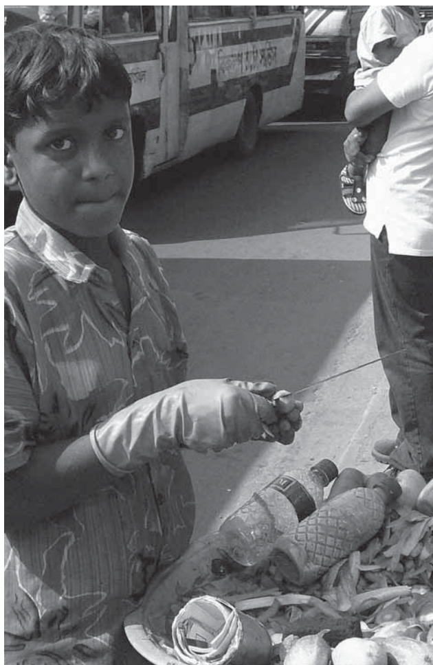
Photo 4 Boy selling food to travellers, Bangladesh.

Faced with large numbers of street children and the employment of vast numbers of young children (not just under 14, but even under 10) in agriculture, as domestics in private houses and in the informal economy, and the exclusion of most of these children from government-run schools, NGOs have developed schemes, over many decades, to prevent children from leaving home prematurely and to provide assistance to unaccompanied children who arrive in towns or