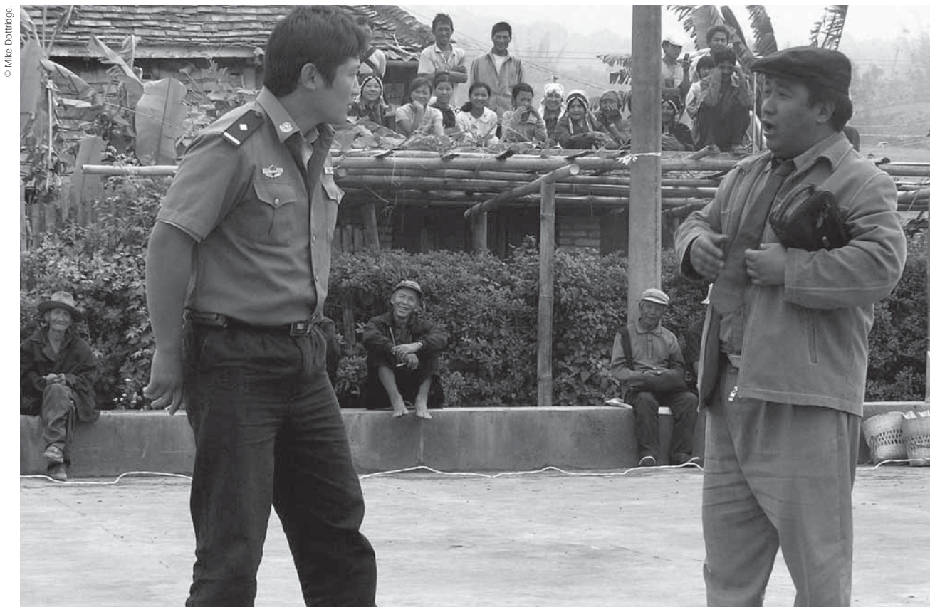
Photo 8 Policeman confronting a trafficker during a play about trafficking in persons in a village inhabited by an ethnic minority, Yunnan Province (China) 2006.