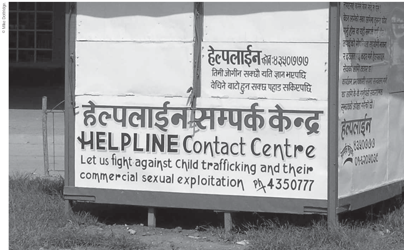
Photo 5 Advertisement for a Helpline in Kathmandu Bus Station (Nepal)

About 16 per cent of the calls in 2006-2007 were from children who had left home and wanted to return home, while 23 per cent concerned missing children (i.e., calls from either the parents of a child who had gone missing or from a child who had been separated from his or her parents or another concerned adult).