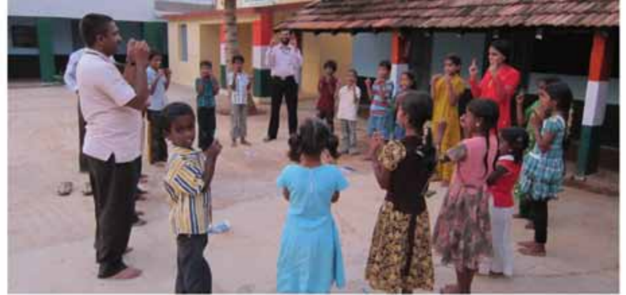
A meeting of the Kozhipalaya village Community Education Centre group.

in encouraging the government to increase its own supply or improve the quality of the assistive devices it provides to its constituents. This raises a challenge for the long term sustainability of provision of aids and appliances in Bangalore and across India. • The training of field workers and provision of rehabilitation services is expensive and hinders the sustainability of the program. By building strong networks with local hospitals and increasing the capacity of local DPOs and the cooperative society, it is hoped the work of the project will continue long after the funding period.