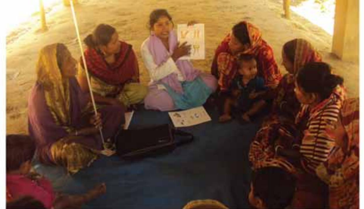
A local self help group undergoes training.

Combining education and advocacy efforts has similarly proved to be effective in Ethiopia. The Rehabilitation and Prevention Initiative against Disability (RAPID) sends field workers to meet with school principals and teachers to advocate for disability inclusion. Their efforts resulted in the provision of training to develop teaching strategies and the establishment of school disability awareness clubs.