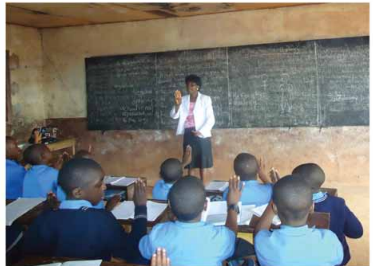
Sign language instructor teaching students sign language so that they can communicate with their peers.