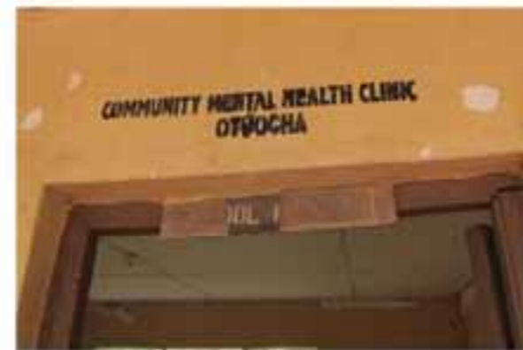
Community Mental Health Clinic