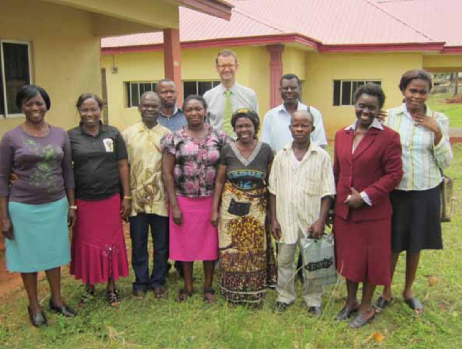
Community Mental Health Program nurse and field workers.