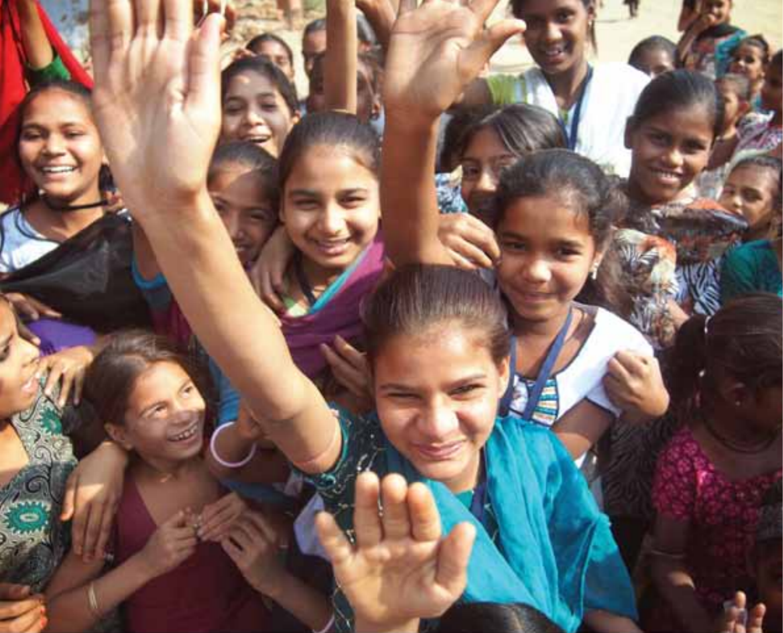
A group of classmates from a school in Gujarat, India, which now has 18 students with a disability enrolled and attending class.