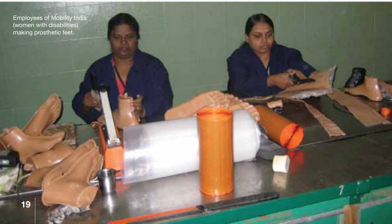
Employees of Mobility India (women with disabilities) making prosthetic feet.

If your organisation has developed a successful approach to CBR, how could you support other organisations to implement a similar approach?