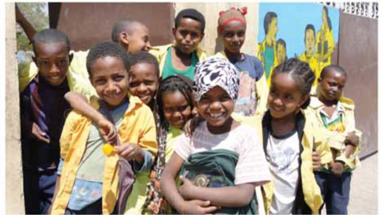
Children with and without disabilities at school together.