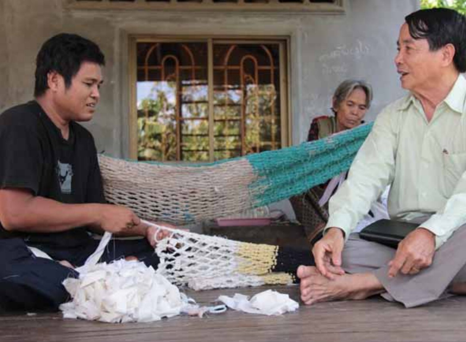
Producing hammocks as an income generation activity.