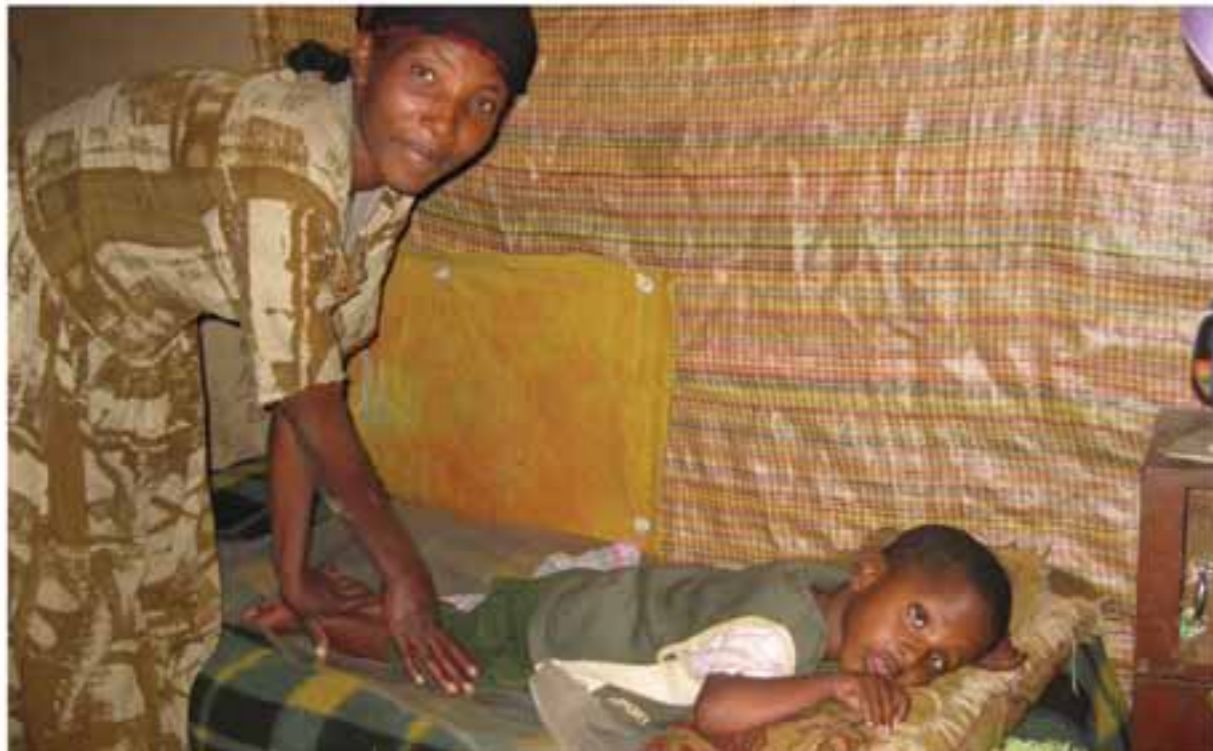
A mother carrying out daily therapy with her child, as trained by a field worker.