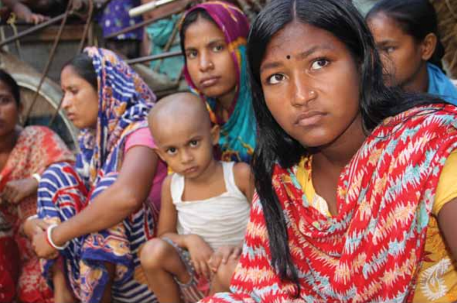
The General Secretary of Notun Jibon self help group in Gaibandha, Bangladesh.