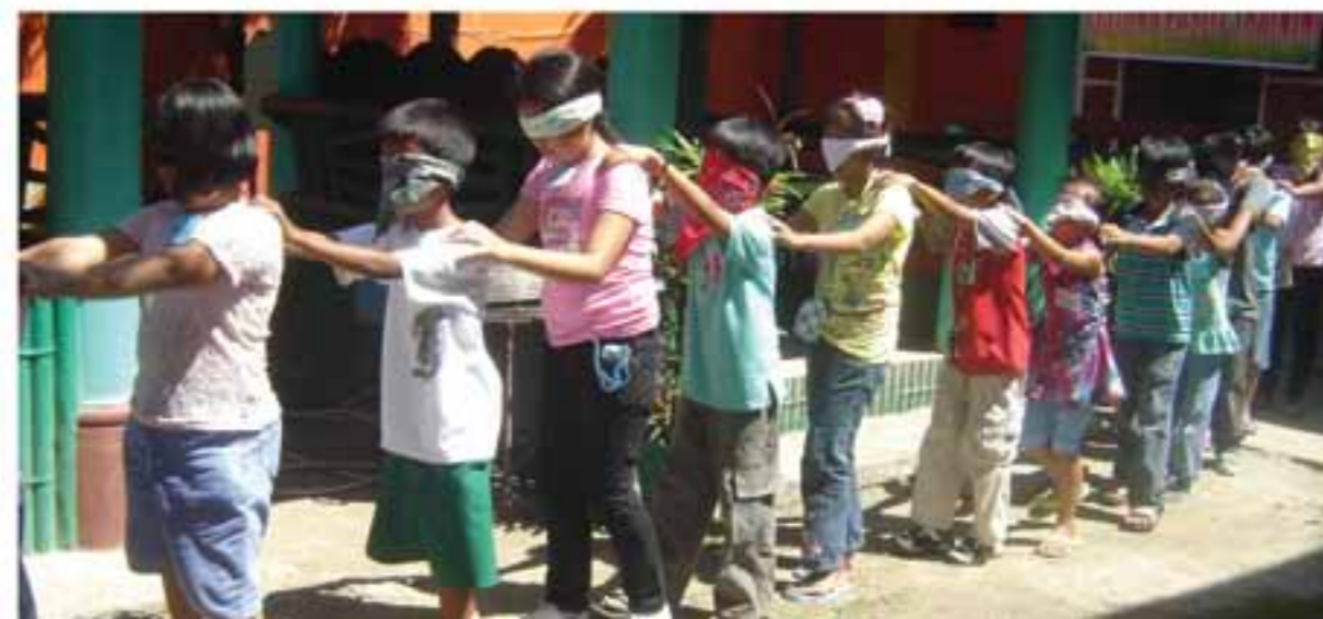
Disability inclusion training for students in a local school.