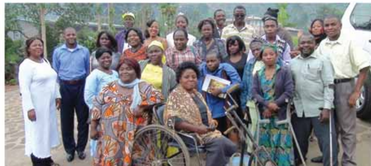
Participants of a capacity building workshop for persons with disabilities held in Bamenda, Cameroon.

Research: SEEPD undertakes research to support the implementation of the program. This research seeks to address the lack of reliable information on disability available in the region. SEEPD's research partner, the Centre for Inclusion Studies, completes baseline assessments, documents good practice approaches and conducts research on issues that support program implementation and management.