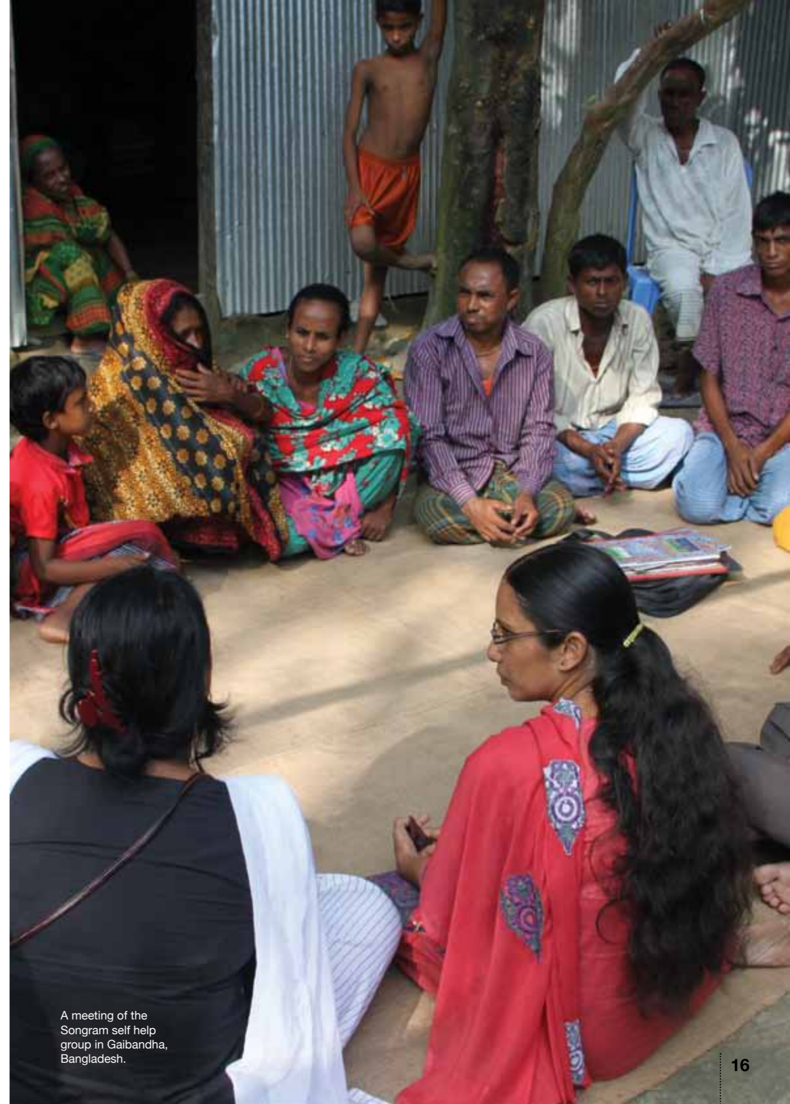
A meeting of the Songram self help group in Gaibandha, Bangladesh.

How does your project ensure that people with all types of disabilities are considered, targeted and included? Do you consider barriers beyond disability such as gender?