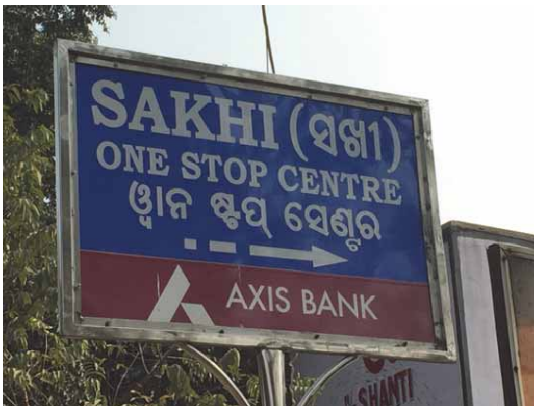
A sign of a government-run one-stop crisis center in Bhubaneswar, Odisha. The one-stop crisis centers are places where integrated services—police assistance, legal aid, medical and counseling services—are available to victims of violence. These centers can play a key role in ensuring care and justice.

The document issued in 2015 by the Ministry of Women and Child Development to guide implementation of the One-Stop Center Scheme lacks provisions for accessible infrastructure, communication assistance, or any other reasonable accommodations. The budget guidelines provided in Annexure II of the document, moreover, do not make provisions for audio-visual recording of statements and other accommodations for women and girls with disabilities mandated under the 2013 amendments and POCSO. 137