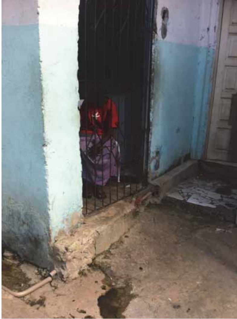
A young man with a physical disability sitting in his room in an institution in Bahia, located approximately 2000 km from the Atlantic Ocean. “My dream is to see the sea, but I have no wheelchair to go and see it,” he said.