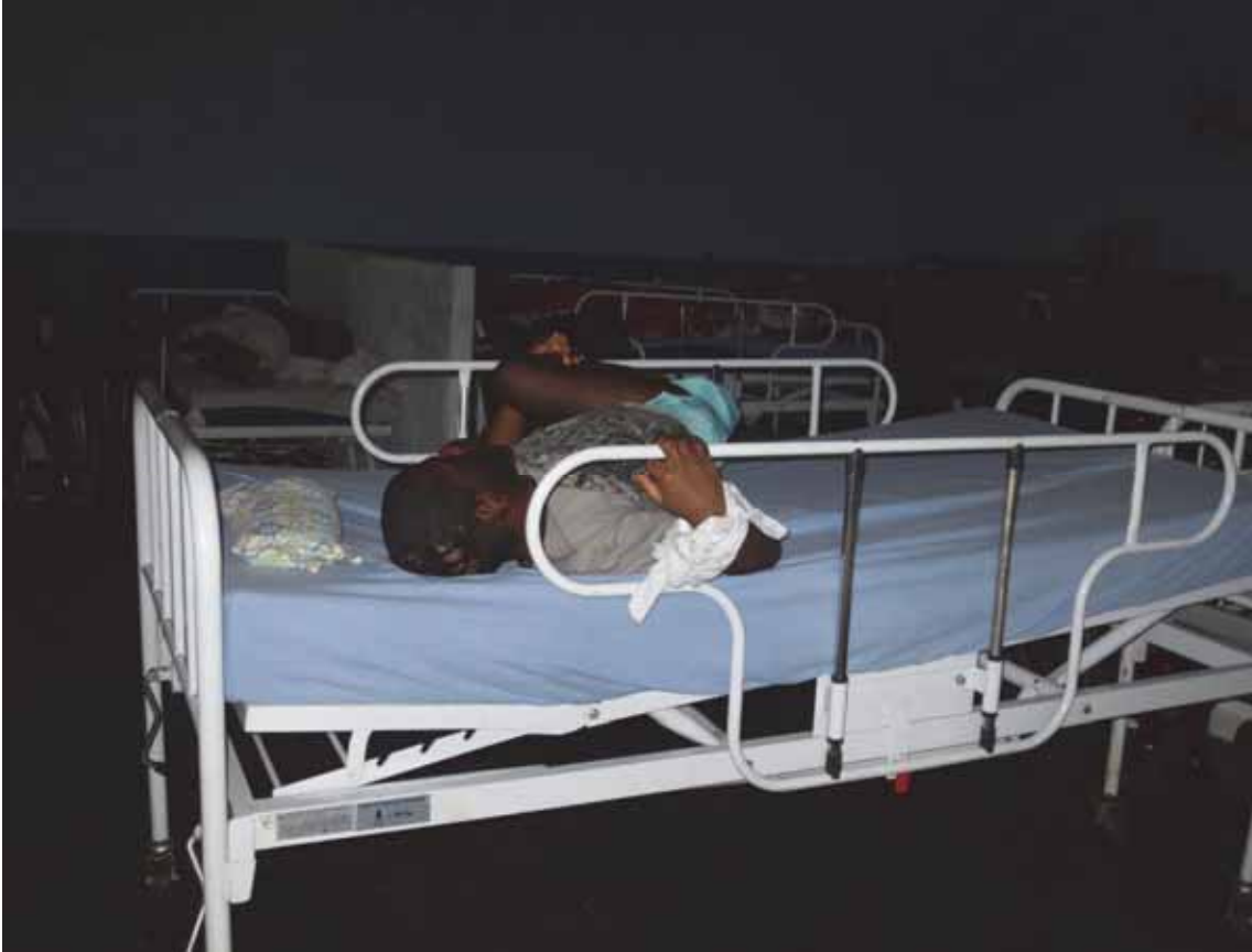
A young man restrained to his bed in an institution for 32 people with disabilities in Rio de Janeiro. Staff in some institutions for people with disabilities in Brazil physically restrained adults to bed rails with pieces of cloth bound around their waists or wrists.

At the time of Human Rights Watch’s visit to a special institution for children with disabilities in Rio de Janeiro in the middle of the day, all 12 children living there were lying in their cribs without anything to engage them. 43 In five institutions in Rio de Janeiro and São Paulo, staff placed children in front of the television to watch whatever program was on. 44 In one institution visited, dozens of children under the age of 10 were placed in front of a television for the entire time of Human Rights Watch’s four- hour visit. 45 Some activities were organized within the institutions for children and adults, including by bringing in outside groups to provide entertainment. For example, a group of volunteers dressed as clowns makes periodic visits to the institutions to entertain residents.