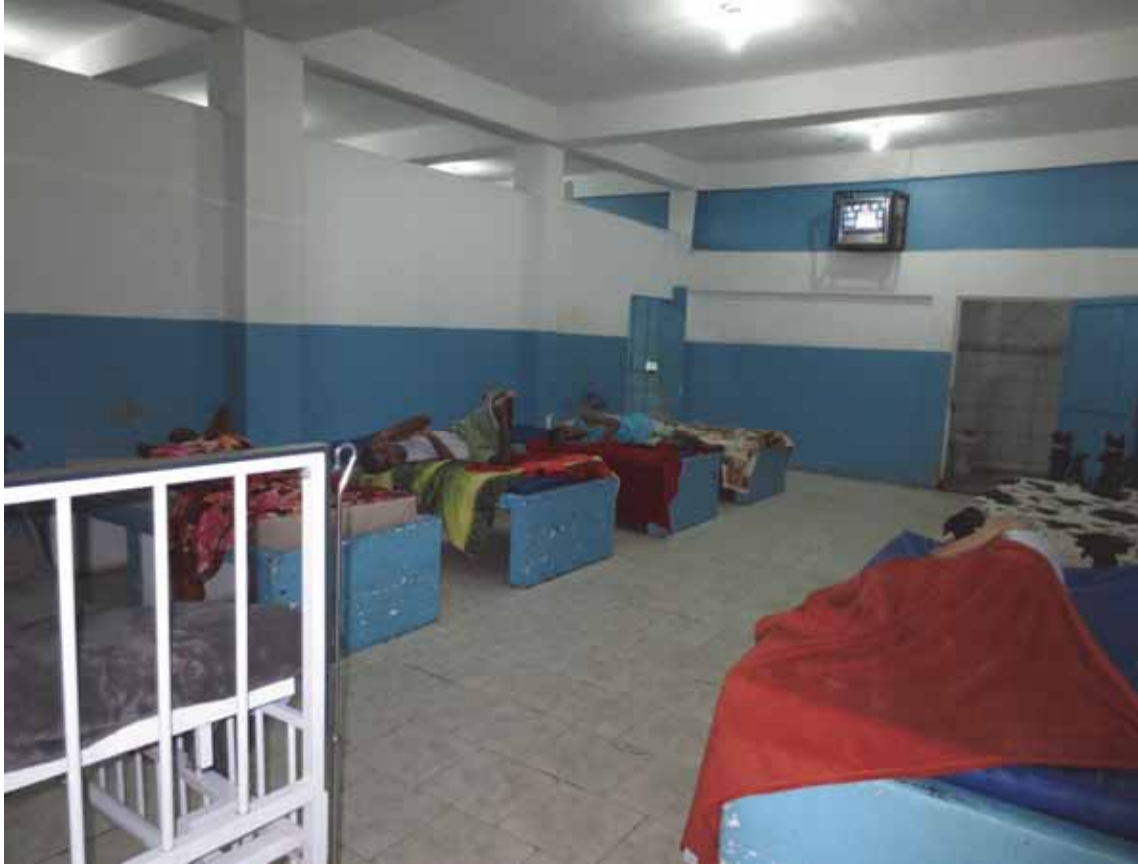
A room for 10 people in an institution for adults and children in Rio de Janeiro. Residents had little or no privacy and no personal belongings.

television for hours on end. Insufficient staff meant that children with disabilities often lacked human contact on a regular basis. Few children with disabilities in institutions visited by Human Rights Watch attend neighborhood schools. Those who did have access to education typically received limited instruction in segregated settings.