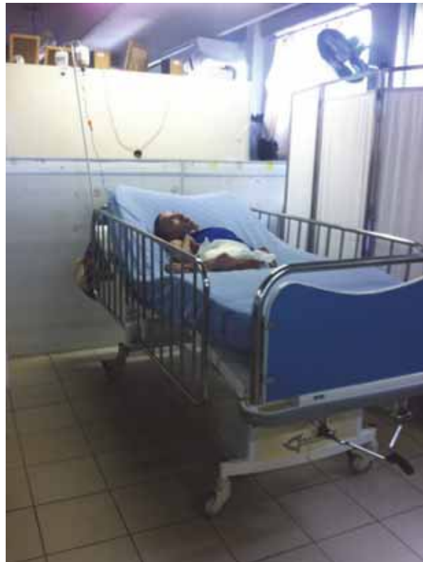
A man with a disability in an institution in Bahia wearing nothing but a diaper from the waist down. Staff in some institutions in Brazil do not fully dress adults with disabilities, in disregard for their dignity.

Human Rights Watch considers the failure to fully dress residents and the failure to ensure privacy when changing adult diapers to potentially