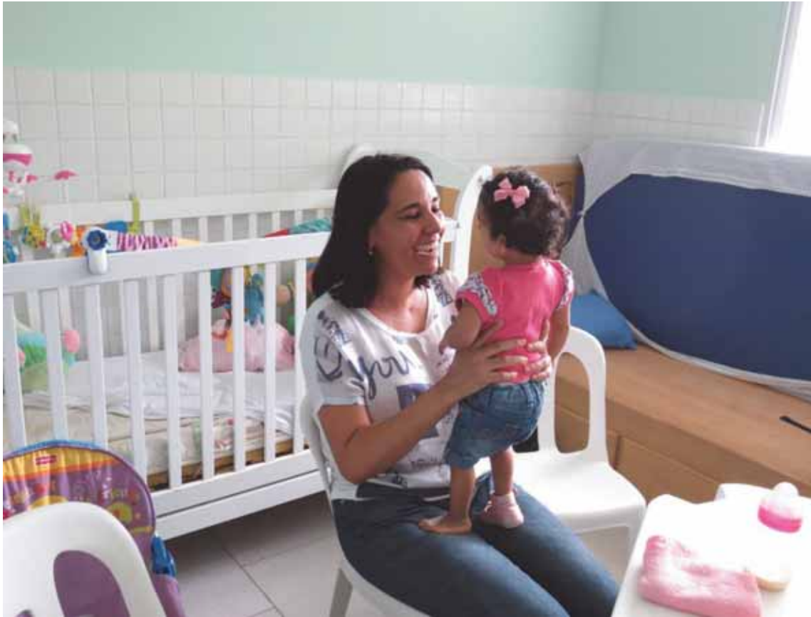
A mother with her 3-year-old adoptive daughter, who has developmental disabilities. The Brazil government should expand adoption and foster care to ensure children with disabilities can grow up in families, rather than institutions.