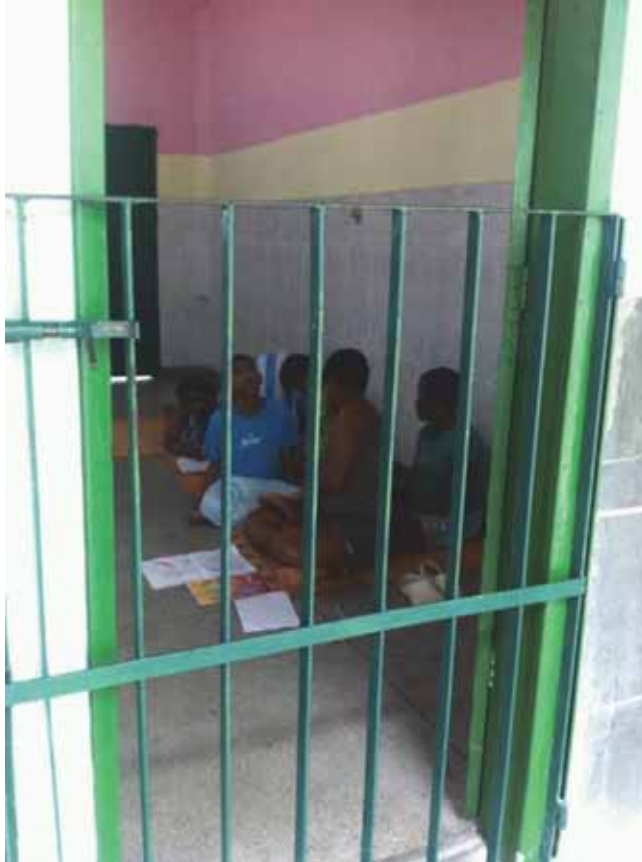
A group of children with physical and sensory disabilities drawing while sitting on the floor in a common room an institution in Rio de Janeiro. Drawing is one of the few activities that institution staff facilitate for children and adults with disabilities.

did not receive any education. In São Paulo, Human Rights Watch visited two institutions for children with disabilities with high support requirements; none of them received education. In an institution for 49 children and adults with intellectual and multiple disabilities in Ceilândia, one person was going to a regular school, the others had not received any schooling. In Bahia, Human Rights Watch visited an institution with 87 children and adults; none of whom received any education. 61 In a second large institution in Bahia of 109 children with disabilities, 37 children, either with autism or high support requirements, or both, did not receive any education. 62