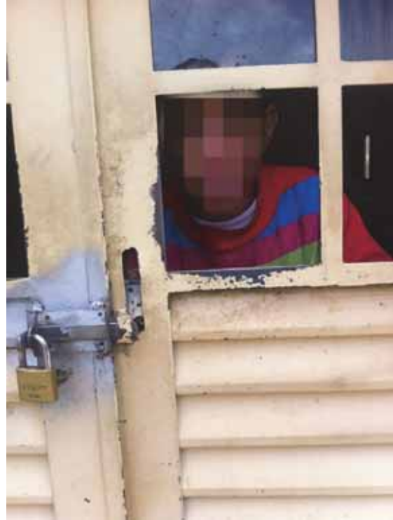
A man with an intellectual disability living in an institution for 51 people with disabilities in the outskirts of Brasília, Distrito Federal looking through a locked door.

Human Rights Watch that nearly all people living there had been stripped of their legal capacity and were under the guardianship of another person, either the institution director or a relative. Institution directors said that individuals with disabilities had been placed in an institution without asking for their consent and was based solely on the consent of the guardian, who is either a family member or the director of the institution. The denial of the legal capacity of persons with disabilities in Brazil and their detention in institutions against their will, either without their consent or with the consent of someone making decisions on their behalf, constitutes an unlawful deprivation of liberty under the CRPD. 105