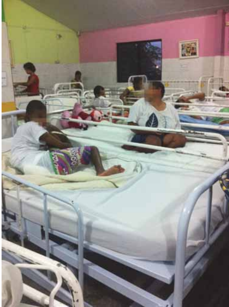
An overcrowded room with 40 children with disabilities in an institution in Bahia. Many institution managers reported that they had insufficient staff to care for the large number of residents.

Carolina (not her real name), a 50-year-old woman with a physical disability, describes her experience in the institution when she spoke to Human Rights Watch: