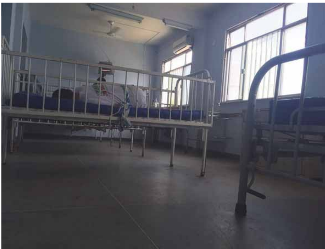
A psychiatric ward in an institution in Rio de Janeiro. Residents of most institutions in Brazil live in depersonalized conditions, have few if any personal belongings, and have little or no privacy.

Many officials and institution staff seemed essentially to justify a lack of enjoyment of rights and services by certain people, based on this vague and essentially arbitrary concept of “severe disabilities.” The term as they applied it has no clear meaning, and instead seemed to represent a subjective and careless effort to create a category of people who can be stripped of their autonomy and rights. International human rights law protects all persons with disabilities, regardless of the so-called “level of impairment.”