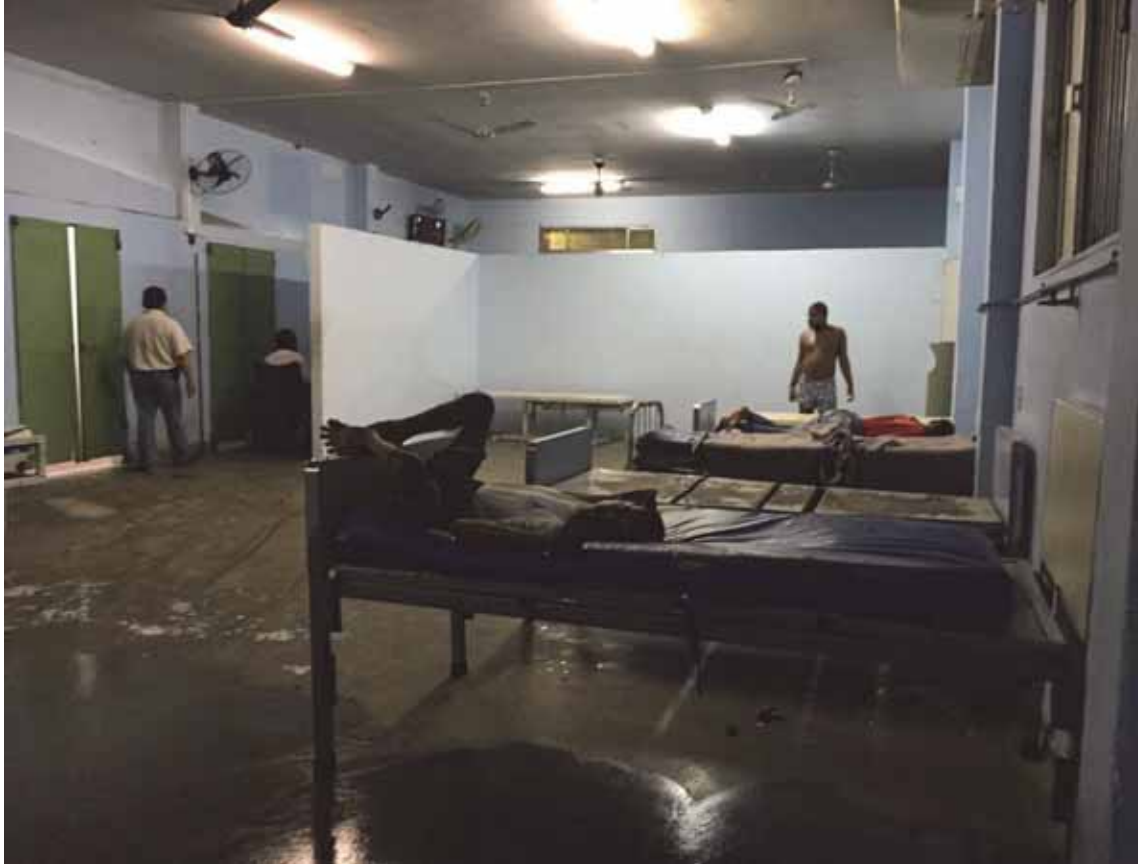
A psychiatric ward in an institution in Rio de Janeiro. Residents of most institutions in Brazil live in depersonalized conditions, have few if any personal belongings, and have little or no privacy.