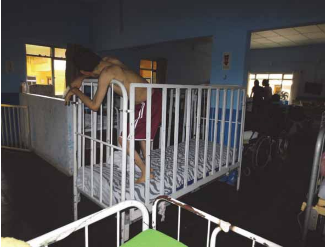
In many institutions, staff use beds with high bars to confine persons with disabilities.

one of the members of staff referred to adult residents as “children,” saying, “Why do you talk to the children themselves? They aren’t responsible for themselves, we are. You should talk to us, not them.” 120 In an institution in São Paulo, after Human Rights Watch spoke to two residents who agreed to an interview, the administrative director intervened and ended the conversation. She said, “They are people with disabilities you cannot consider everything they say as true.” She refused to acknowledge that the consent they had given to the interview as valid, saying only the institution director can give authorization. 121