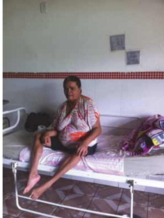
A 50-year-old woman with a physical disability in an institution in the outskirts of Brasília (Distrito Federal). She had lived in the institution for eight years and is not allowed to leave the institution without permission from her sons.

The CRPD Committee has stated that the “systematic realization of the right to independent living in the community requires structural changes,” including phasing out institutionalization. The committee’s guidance states that “no new institutions may be built by States parties, nor may old institutions be renovated beyond the most urgent measures necessary to safeguard residents’ physical safety. Institutions should not be extended [and] new residents should not enter in place of those that leave.” In conjunction with deinstitutionalization, states must provide a range of individualized support services which allow for personal choice and self-control. The aim of these individualized support services is the realization of full inclusion of persons with disabilities in society and preventing isolation and segregation from others within the community. 81