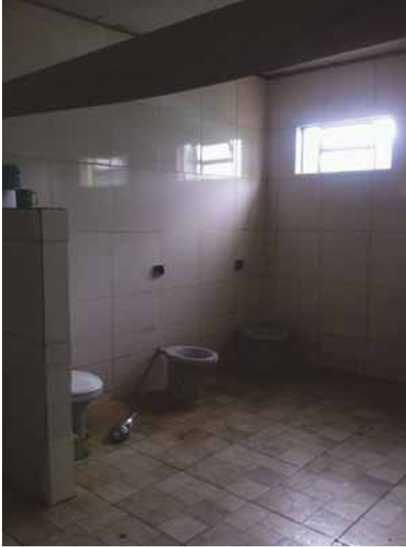
A bathroom in an institution in the outskirts of Brasília (Distrito Federal). Many institutions for persons with disabilities in Brazil do not ensure residents' privacy.

Residents overwhelmingly had no privacy and had few or no personal items. In some cases, they even had to share clothes—and in one facility, even toothbrushes—with others. In some adult institutions staff did not assist residents to get dressed, leaving them unclothed from the waist down, wearing only diapers. Several institutions advertised tours for the public and solicited donations online relying on images of persons with disabilities as needy, vulnerable, and in need of care, rather than as autonomous individuals. In many of the institutions visited by Human Rights Watch, the problems described below created an inhumane and degrading living environment for residents.