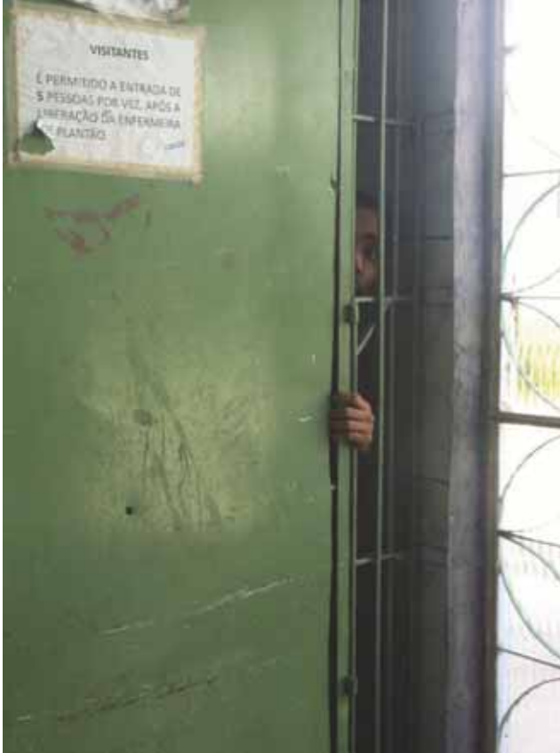
A man with disabilities looks out through the bars of a psychiatric ward in an institution in Rio de Janeiro. Persons locked in this section of the institution never left their rooms, according to staff.

we ... restrain them with sheets, or we use straitjackets for about 30 minutes while waiting for medication to take effect.” 19