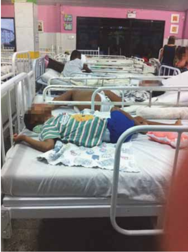
An overcrowded room with 40 children with disabilities in an institution in Bahia. Many institution managers reported that they had insufficient staff to care for the large number of residents.

with high support needs lay down almost continuously, being brought out of bed and placed in a wheelchair only for short periods. 27 In one of the institutions Human Rights Watch visited in Rio de Janeiro, dozens of people with so-called “severe” disabilities were separated on the upper floor of the building. Up to eight people lived in small rooms, some of them restrained to metal bars of the bed by a cloth around their waists. A nurse in this institution said that people there “never leave the room.” 28