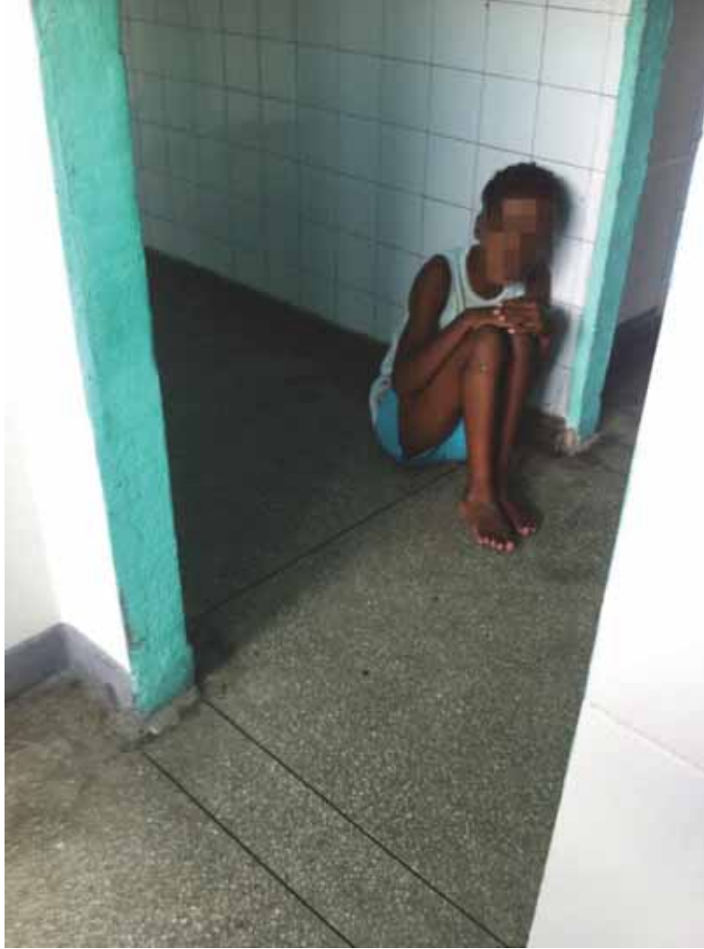
A young woman in a dormitory in an institution in Rio de Janeiro.