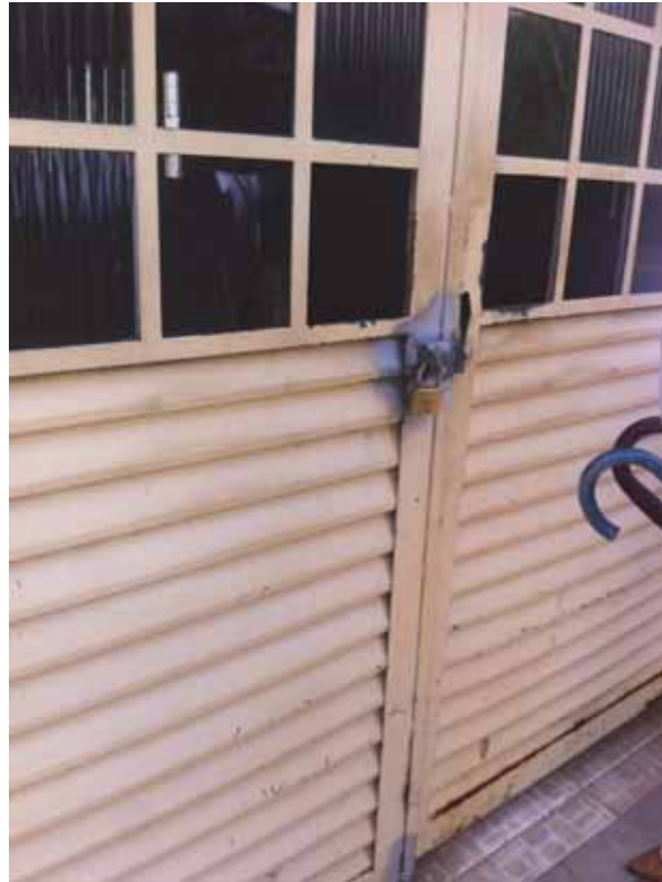
A locked door at an institution for people with disabilities in the outskirts of Brasília, (Federal District). Many institutions for adults with disabilities in Brazil have the look and feel of detention centers, with heavy doors with locks and barred windows in order to keep people inside.

Although children with disabilities are placed in institutions, including general institutions for children, for long periods of time, all three general children's institutions visited by Human Rights Watch lacked an accessible physical environment for people with disabilities. In one institution in São Paulo, for example, stairs at the entrance made it impossible for a child with physical disability to enter or exit independently. 73 One institution in Salvador had only one bathroom with enough space for a wheelchair to fit, but it was in the girls' section. 74 No bathroom in any general institution was fully accessible with toilets with raised toilet seats and support bars.