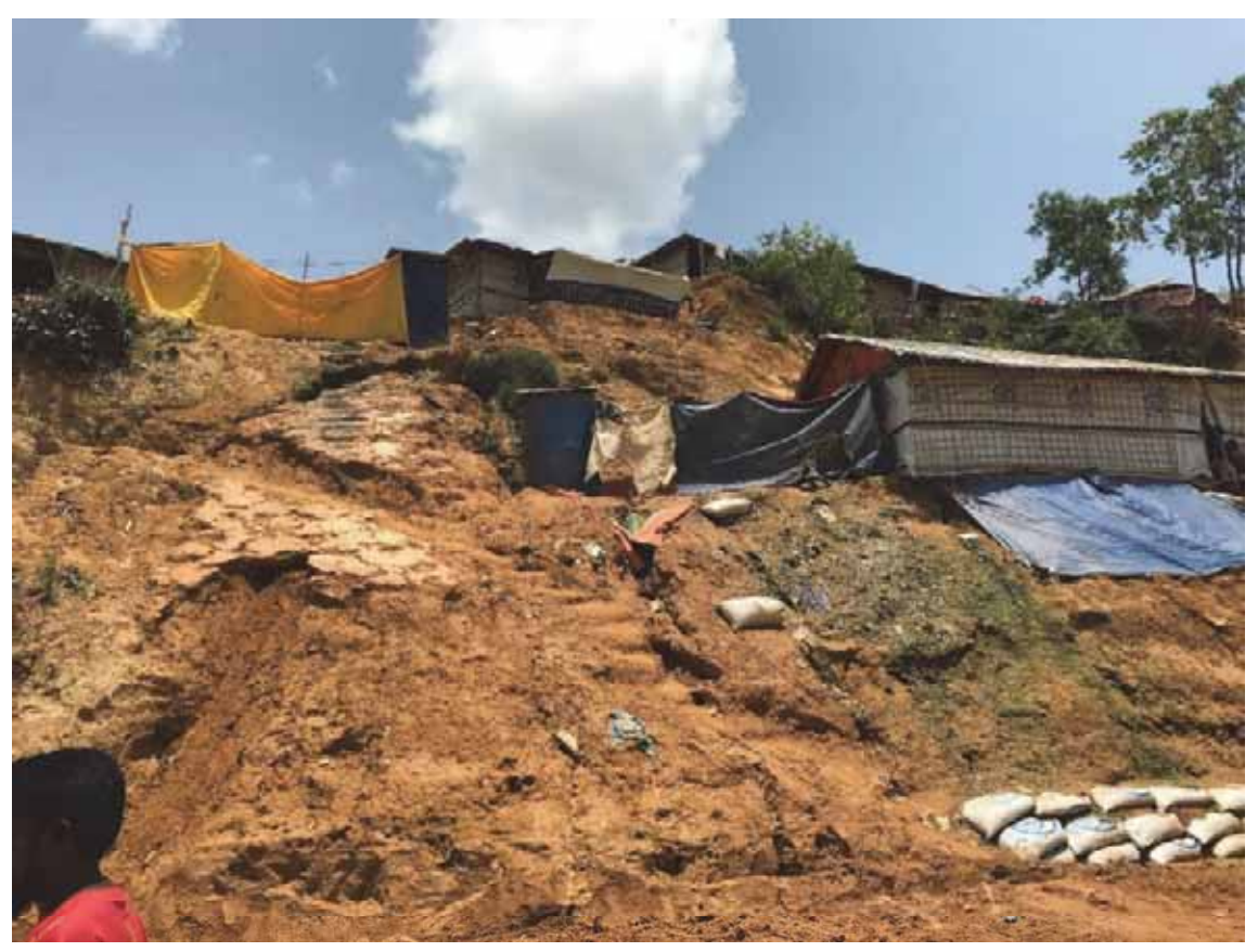
Trees on steep hillsides were cut down to make way for temporary huts when the Kutupalong-Balukhali Expansion Camp was hurriedly built in late 2017 in Cox's Bazar, Bangladesh. During monsoon season in 2018, some of those huts were washed away in landslides.

basic goods and other strains: "The local people, unable to use their land for cultivation, lose out to the Rohingyas in the labor market affected by lower wages accepted by the Rohingyas. Municipal services in the Cox's Bazar area has been unavailable to locals since the influx adding more sufferings." These broad-based and opened-ended grounds for confining Rohingya refugees to the camps do not meet the standards of necessity, legitimacy, and proportionality set out in international law for restricting the right of free movement.