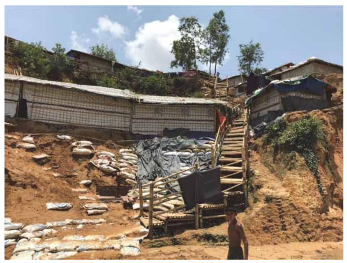
Walkways on the steep slopes of the Kutupalong-Balukhali Expansion Camp in Cox's Bazar, Bangladesh have been particularly treacherous. In May 2018, refugees in some places were starting to build stairs with handrails.

Bangladesh ratified the United Nations Convention on the Rights of Persons with Disabilities (CRPD) and its Optional Protocol in 2008. Under article 11 of the CRPD, Bangladesh is responsible for ensuring the protection and safety of persons with disabilities in situations of risk, including armed conflict, humanitarian emergencies, and natural disasters.94