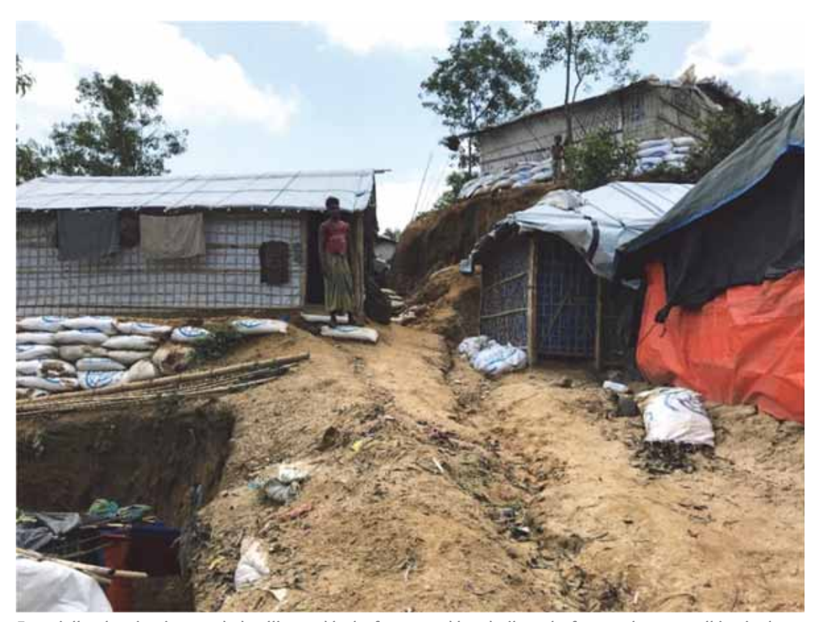
Especially when it rains, eroded gullies and lack of steps and handrails make for treacherous walking in the Kutupalong-Balukhali Expansion Camp in Cox's Bazar, Bangladesh, May 2018.

conditions are not yet in place" and welcomed the MOU as a "first step to address the root causes of the conflict in Rakhine." <sup>124</sup> Even with the secretary-general's assurances, the lack of transparency regarding the drafting and final terms of the MOU raises serious concerns about its provisions and does not engender trust for refugees anxious about their futures.