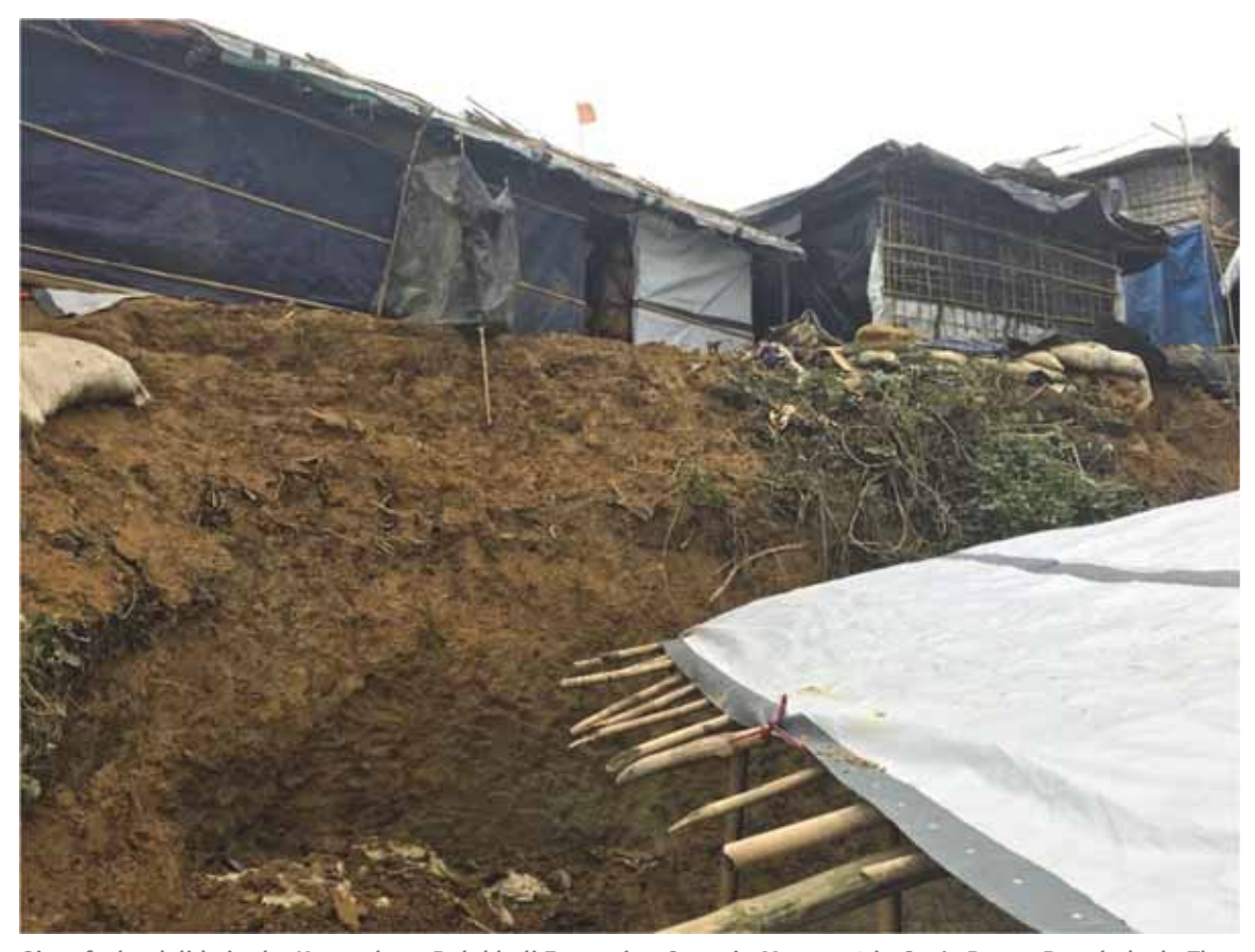
Site of a landslide in the Kutupalong-Balukhali Expansion Camp in May 2018 in Cox's Bazar, Bangladesh. The next day, the refugees began constructing a new hut—in the right foreground—where their former hut had washed away. They had asked permission to relocate to a safer place, but the local authority told them they had to stay in the same overcrowded block, where no other place was available.

refugees to maintain community ties and to move between the mega camp and the new smaller ones; and, of great importance to the refugees, they would still be relatively close to the border with Myanmar to maintain their aspirations for return.