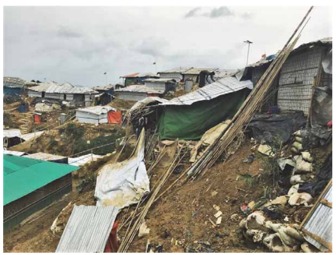
A landslide in the Kutupalong-Balukhali Expansion Camp in Cox's Bazar, Bangladesh on May 18, 2018 washed away a shelter housing 17 Rohingya refugees, all of whom were unharmed. The next day, shown here, refugees were working to put up a new hut on the same spot.

starting in late August 2017. "Our entire village came together and settled on this spot," said Amanat Shah, 19, who arrived on September 2. "At first this was a jungle, but we cleared it. Now there are no trees." His hut now sits on a densely packed steep slope with almost no vegetation to keep the clay-sand mix under him from eroding or suddenly sliding away, particularly during monsoon rains.