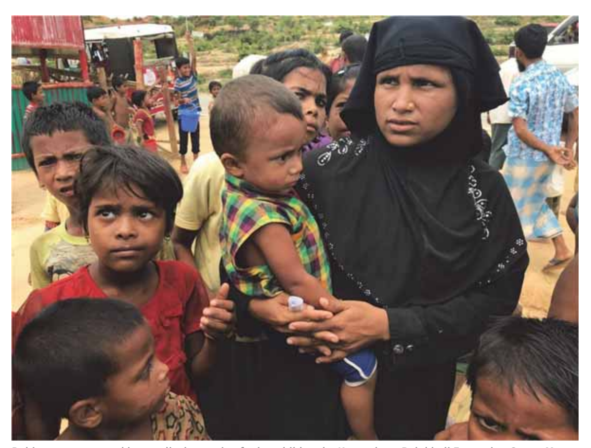
Rohingya woman seeking medical attention for her child at the Kutupalong-Balukhali Expansion Camp, May 2018.