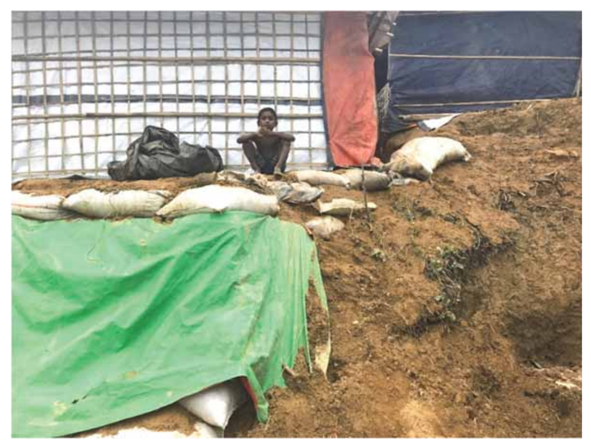
A Rohingya boy looks down on the place where his hut washed away the day before in the Kutupalong-Balukhali Expansion Camp in Cox's Bazar, Bangladesh, May 2018.

commonly shared well-founded fear of being persecuted on account of nationality, religion, and similar grounds. Under such circumstances, UNHCR is the only international organization mandated to protect and assist refugees. Yet, at the height of the influx in August and September, Bangladesh delayed delegating this responsibility to UNHCR, preferring to retain IOM as the lead agency, and continuing to treat all but the old, official refugee caseload as "forcibly displaced Myanmar nationals" rather than refugees. <sup>10</sup>