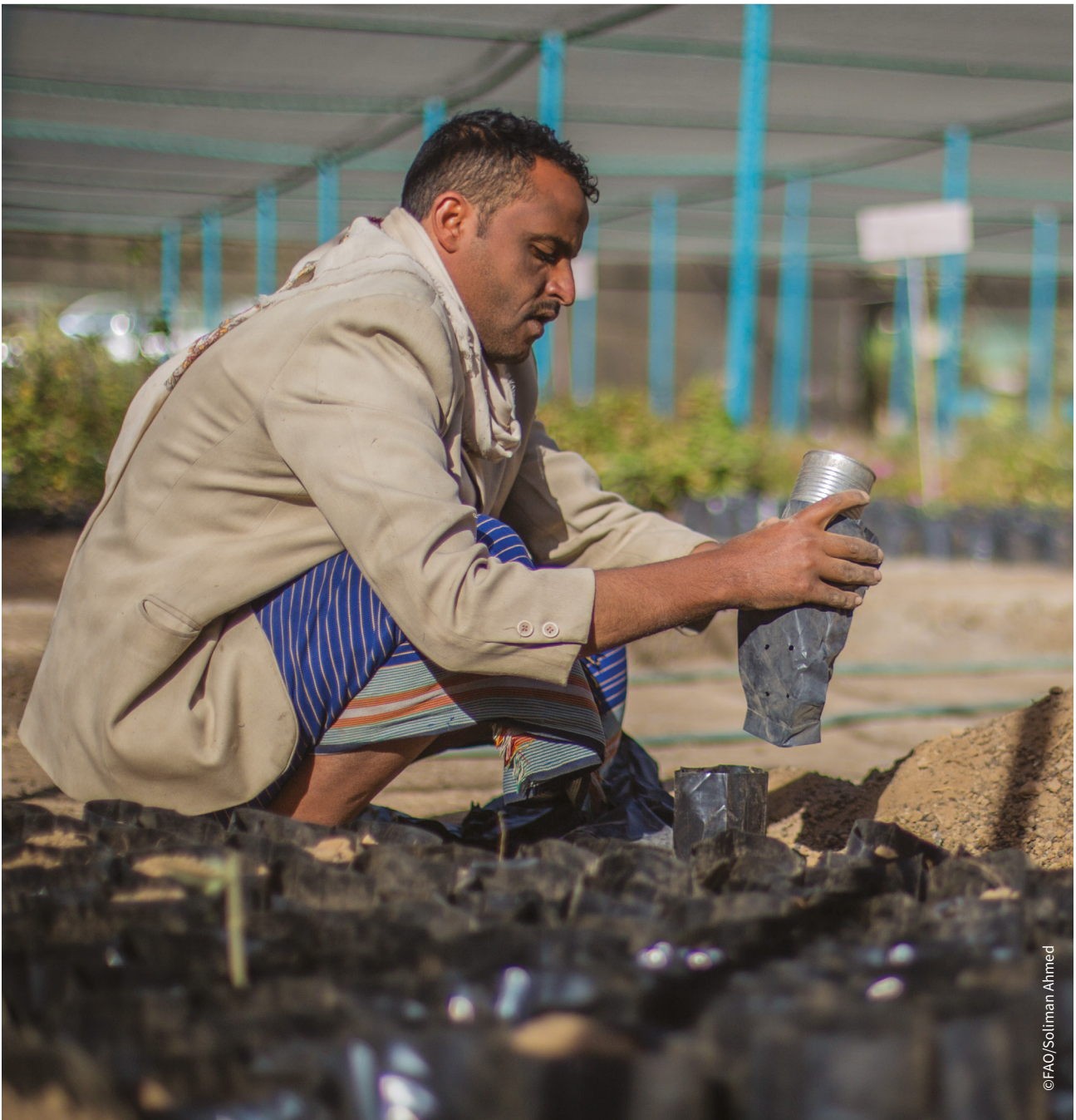
Photo: A farmer prepares seedlings for planting.

Investing in agricultural livelihood interventions will help food insecure households to produce much-needed and life-saving food, and reduce their dependency on food assistance and food imports.