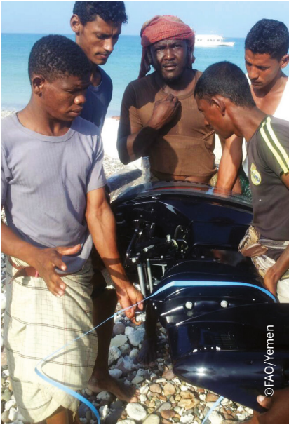
Photo: FAO is improving and diversifying livelihood opportunities for fishers, many of whom are isolated from regular humanitarian assistance.