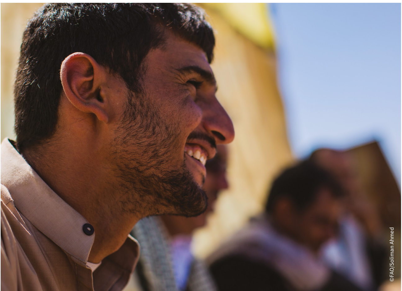
Photo: FAO's objective is to improve the food security and nutrition of the most vulnerable households in Yemen.

Given its mandate, technical expertise and more than 25 years of experience operating in Yemen, FAO is well positioned to take the lead on issues related to agriculture (crops, livestock and fisheries). It is currently operating in 16 out of the country's 22 governorates.