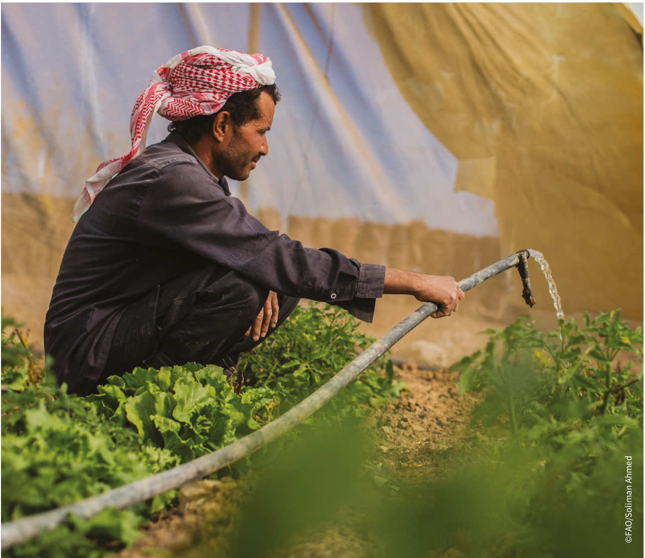
Photo: A farmer waters crops at a protected farm in Sana'a.

The sector most vulnerable to the effects of the phenomenon is agriculture, which is considered to be in need of immediate and urgent adaptation interventions. Climate change is causing increased periods of drought and unpredictable rainfall, while limiting the growth of sustainable, diversified and resilient rural livelihoods in Yemen. The already dire situation in the country is expected to worsen, with incidents of drought and extreme rainfall patterns becoming more frequent as the climate continues to warm.