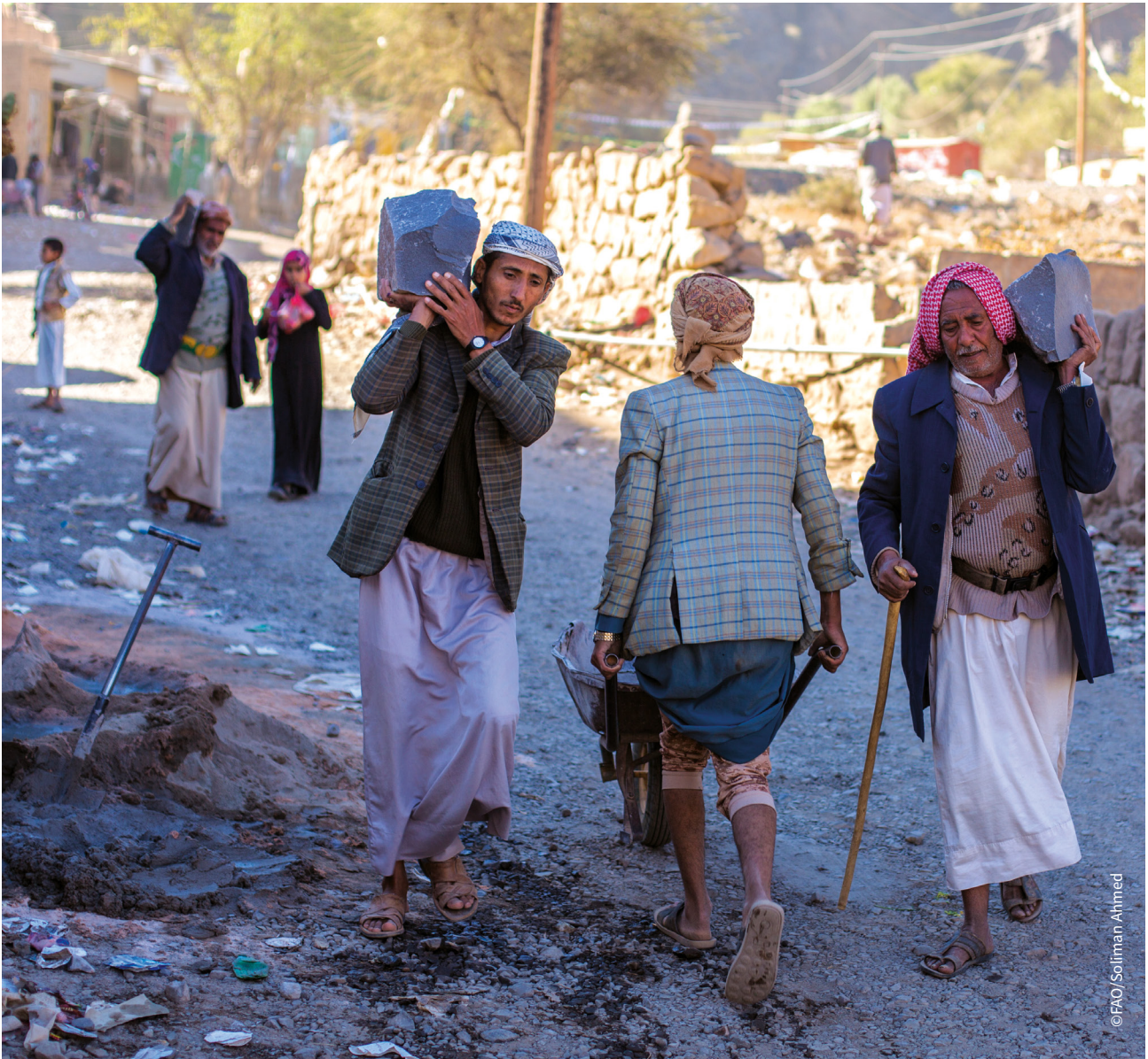
Photo: Villagers help to build a water storage facility in Sana'a.

people (IDPs) are sheltered in Hajjah, Taizz, Amanat Al Asimah and Amran governorates 2 . After three years of conflict, displacement is becoming protracted for the vast majority of IDPs, further deepening vulnerabilities. IDPs and host communities are rapidly exhausting their reserves. The prolonged displacement continues to put additional pressure on already scarce basic services.