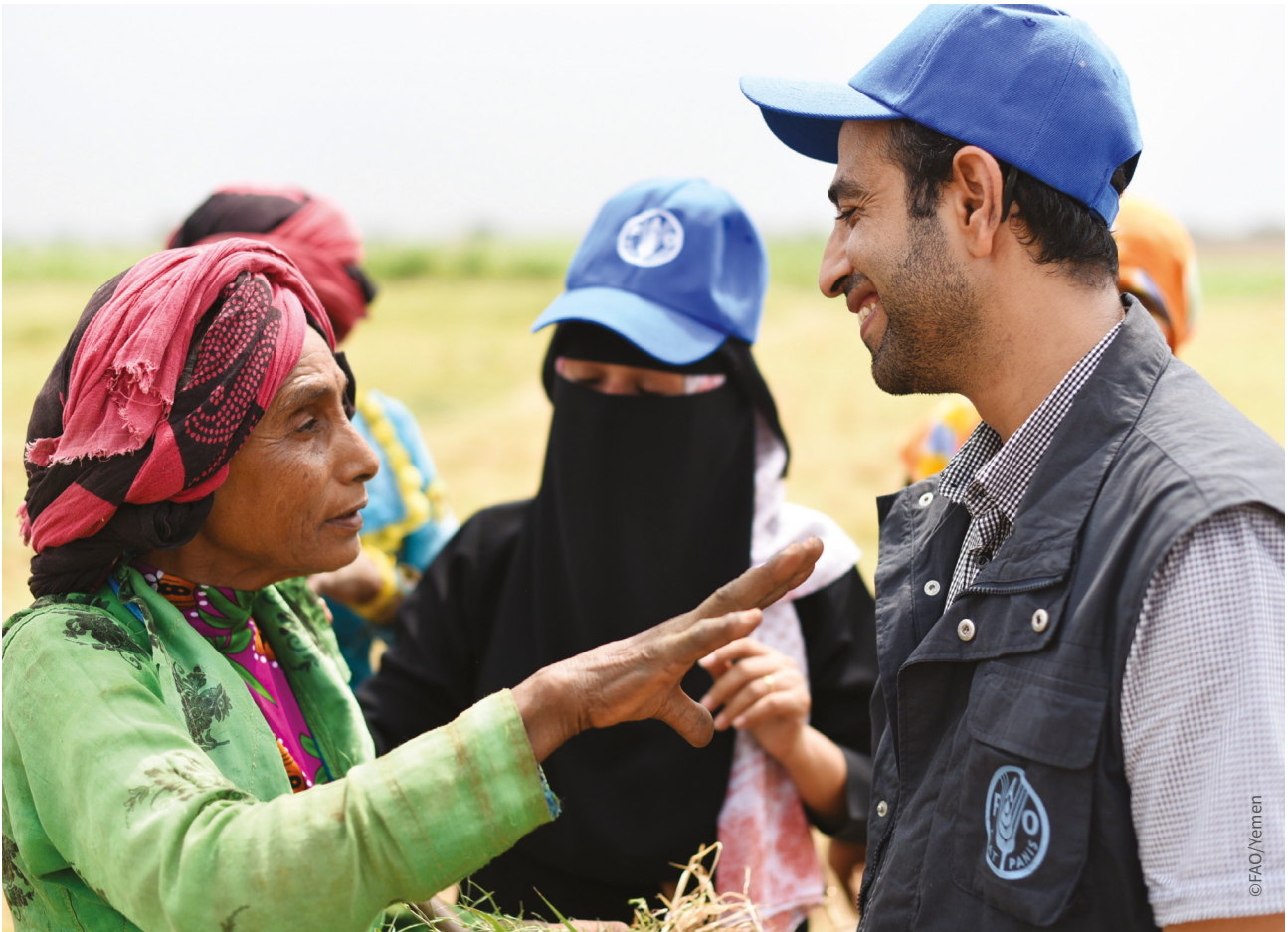
Photo: A woman speaks with FAO staff.