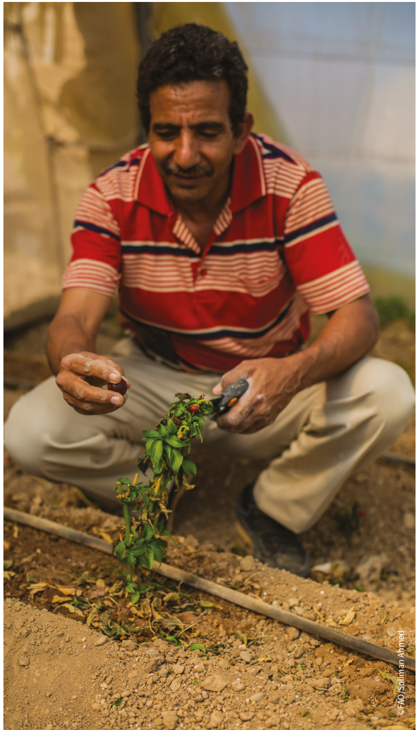
Photo: Agriculture has traditionally been a source of income for more than half of the population and a main pillar of Yemen's economy.

Agriculture, which has traditionally been a source of income for more than half the population of Yemen and a main pillar of the country's economy, has been severely impacted. FAO is increasing its efforts to support local food production, protect livelihoods and improve immediate household availability of and access to food for the most vulnerable people in the country.