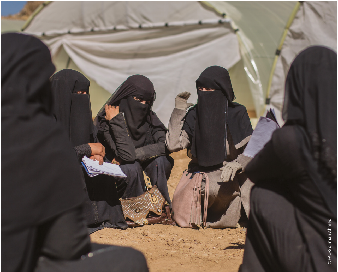
Photo: Engineers train women at a farmers' school.

To maximize reach, various groups will be targeted, including local institutions, government agencies, project partners (including NGOs and community-based organizations), the humanitarian community, local and international media, resource partners and beneficiaries.