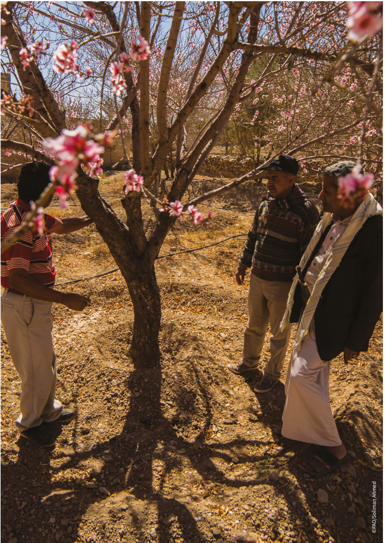
Photo: Farmers learn how to plant almond trees using modern methods.