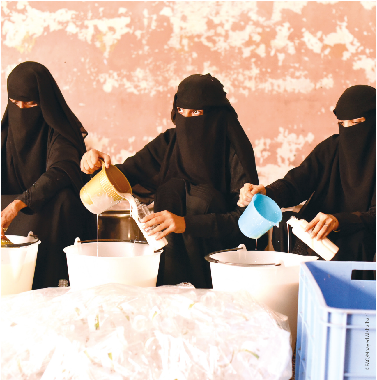
Photo: Women prepare raw milk to sell at the local market in Al Hudaydah.

The ELRP places special emphasis on safeguarding the livestock sector as it plays such an important role in nutrition and food security in Yemen, particularly for the most vulnerable