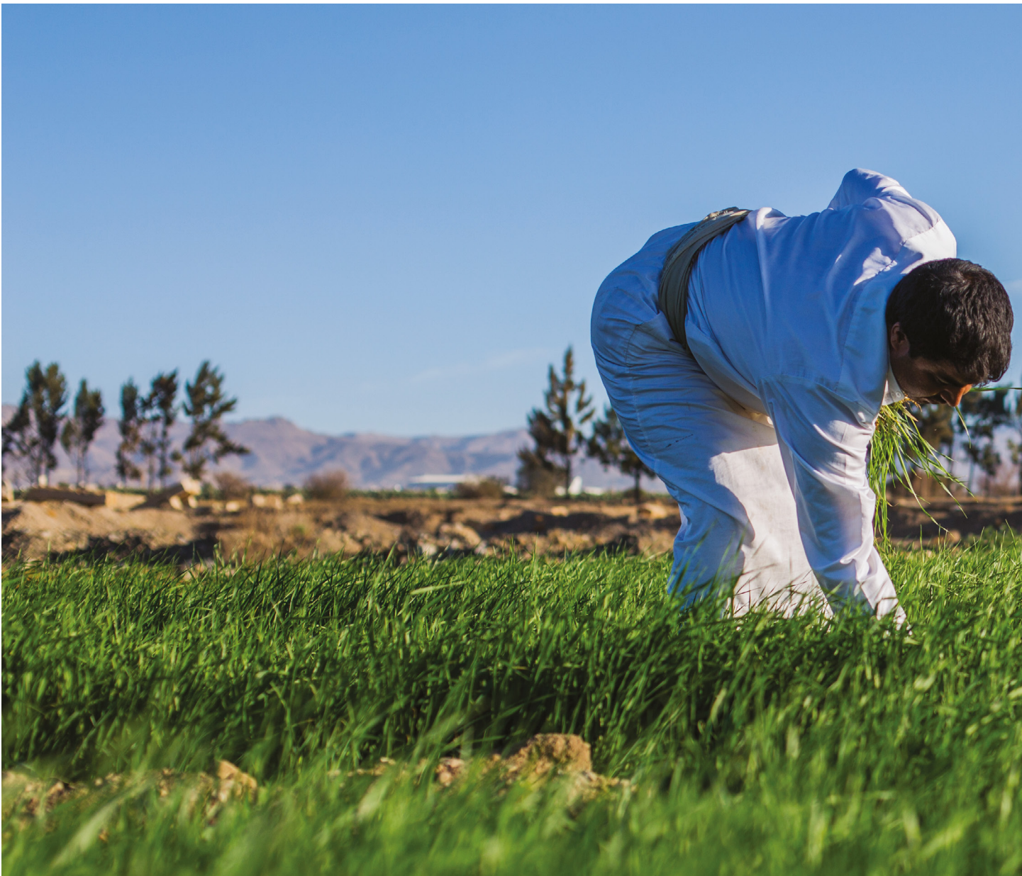
Photo: A farmer works in a wheat field.

In recent years, crop production has declined due to drought, insufficient and erratic rainfall, declining soil quality, poor crop management, crop