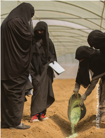
Photo: Engineers train women in planting and preparing protected farms.

Incomes in Yemen have fallen sharply and many public sector workers have gone for more than a year without being paid. As a result, 80 percent of Yemenis are now in debt, and more than half of all households buy food on credit. Most households – 60 percent – have resorted to negative coping mechanisms such as reducing their food portions or skipping meals.