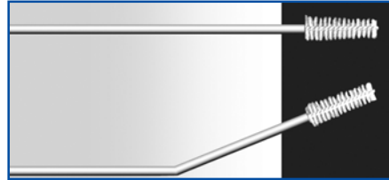
Fig. 3 : Endo-cervical brush