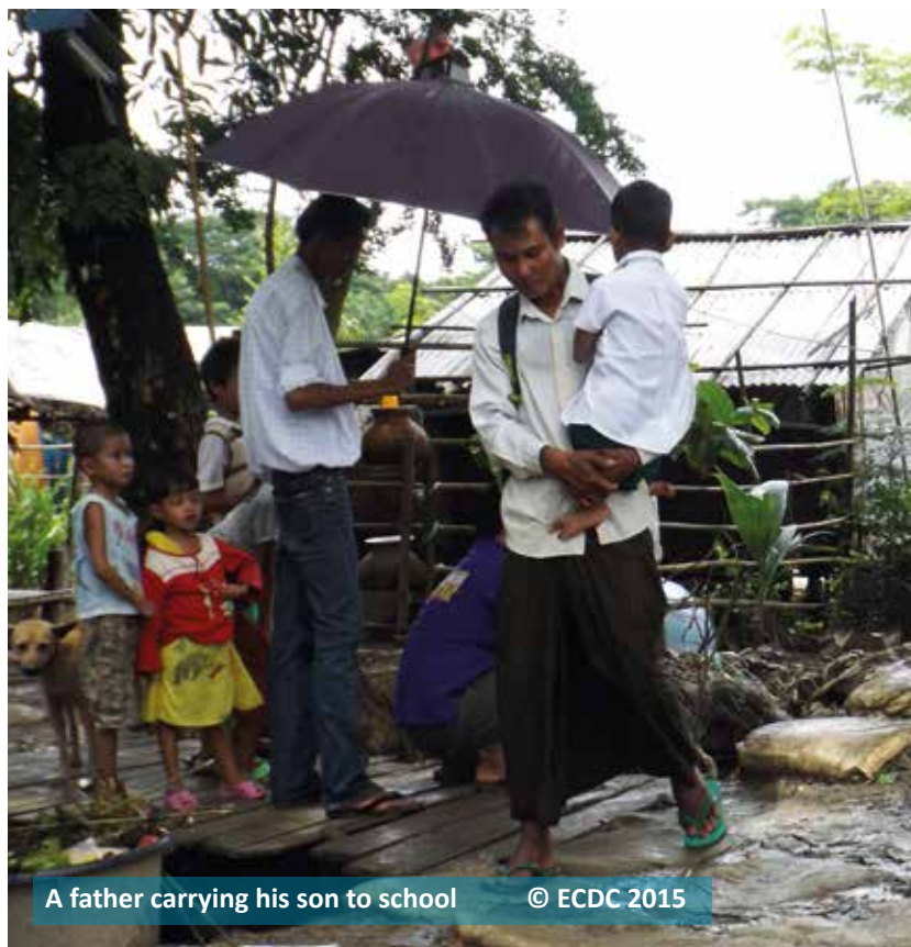
A father carrying his son to school

This evidence suggests that children's rights to accessing the general education system under CRPD Article 24 (2006) are not being fully met. Although EFA Review Report suggests that "children with disabilities are accepted in basic education schools" (MOE 2014b), this evidence suggests otherwise. By not clearly defining inclusive education nor protecting the rights of children with disabilities to education in regular schools, the new Education Law may have missed the opportunity to protect the rights of children with disabilities to accessing the general education system.