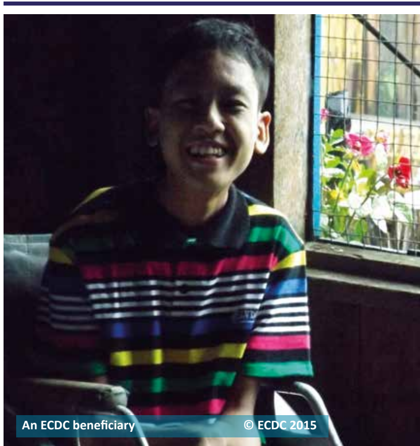
An ECDC beneficiary

Overall the research found that the current centralized nature of the curriculum and examination system did not allow schools to make modifications based on student needs. This presented difficulties particularly as children progressed towards the national examinations and matriculation. These findings may provide some insights into the low retention of children with disabilities in education as well as the reduced likelihood of children with disabilities passing matriculation.