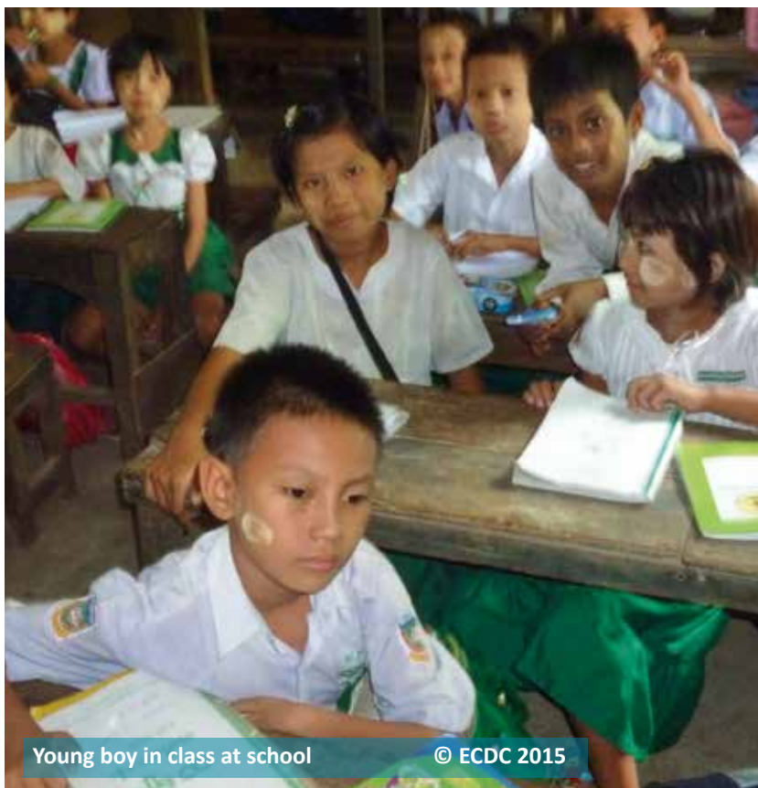
Young boy in class at school

children's participation in education. The evidence suggests an interaction between parent attitudes and socio-economic factors, access to medical services in relation to disability and experiences of formal education services. This highlights the need to address both parent attitudes as well as poverty and access to and quality of medical and education services. Moreover the findings illuminate the nature of parent attitudes, which can help in the development of interventions such as parent education programmes and supports the need for the participation of parents in their children's education.