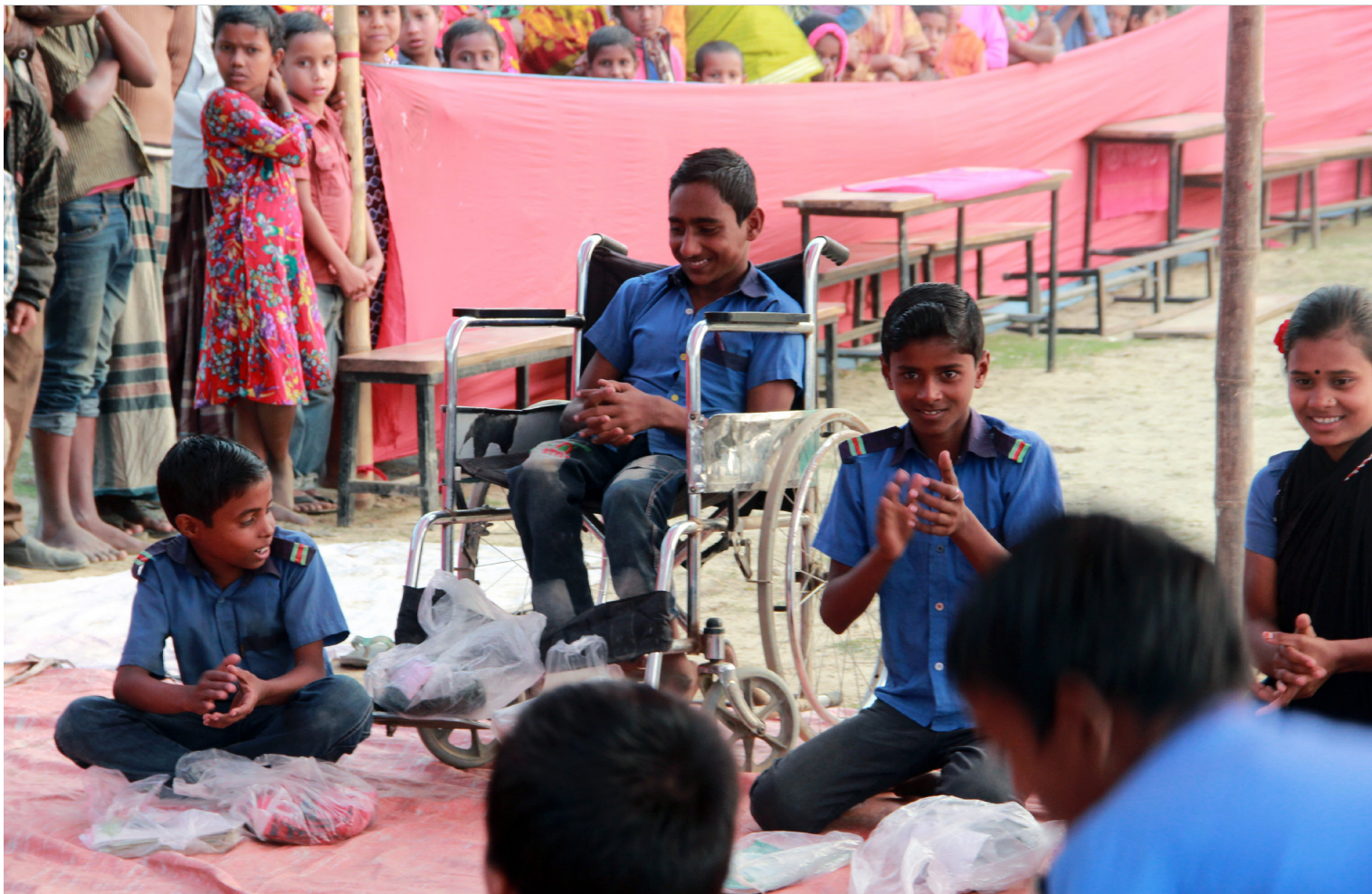
Children participate in a mock drill.

ENHANCE staff expertise. In addition to consultations with the World Bank’s Global Disability Advisor as appropriate, and ensuring that there is a corps of staff available for internal “just in time” consultation (including staff with disabilities), guidance notes and other training, information, and professional development tools should be made available to guide staff in ensuring that DRM-related projects incorporate disability from the earliest phases onwards.