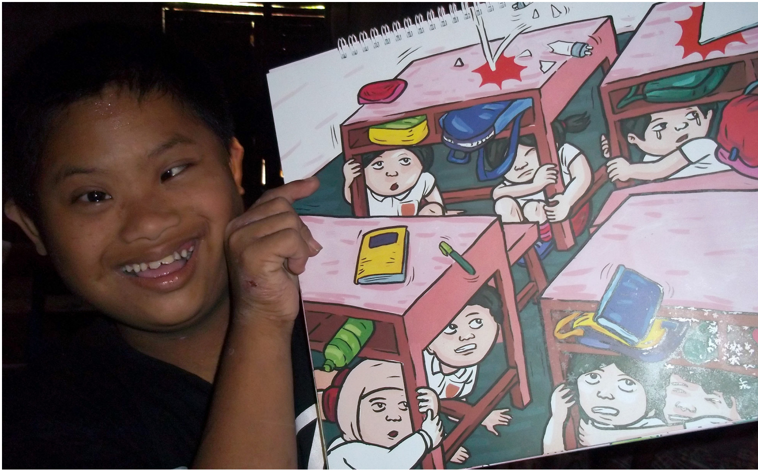
Indonesia: Building resilience for children with disabilities. Disaster Risk Reduction training has to include all members of society, especially the most vulnerable.

unable to find, count, assess, or communicate with persons with disabilities. If DRM personnel do not see any persons with disabilities, it can lead to the assumption that “there are no persons with disabilities,” or that “all persons with disabilities must have died,” excluding persons with disabilities from DRM activities, including relief and recovery efforts.