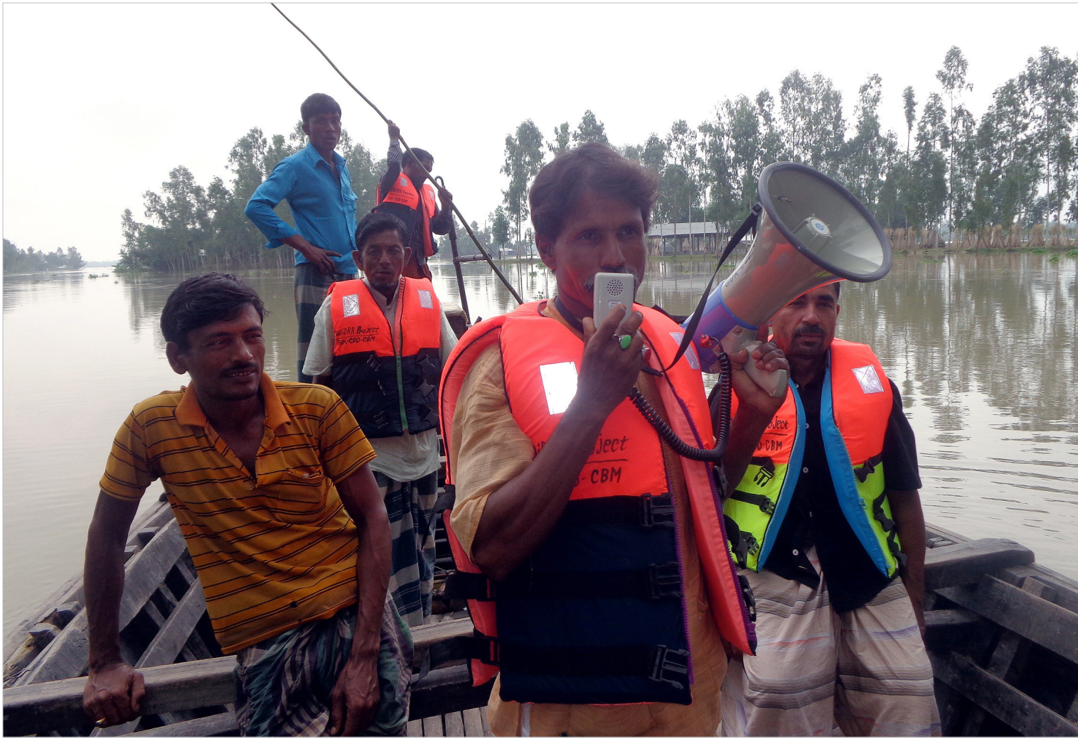
Evacuation in process in Bangladesh.

certainly not with persons with disabilities. Though in some cases specific attention is given to households with disabled persons, such interventions are rare. Moreover, such an approach only addresses accessibility of the house and not the wider societal context in which the person lives. Although an admirable start, such restrictive approaches fall short of achieving the vision of “building back better.”