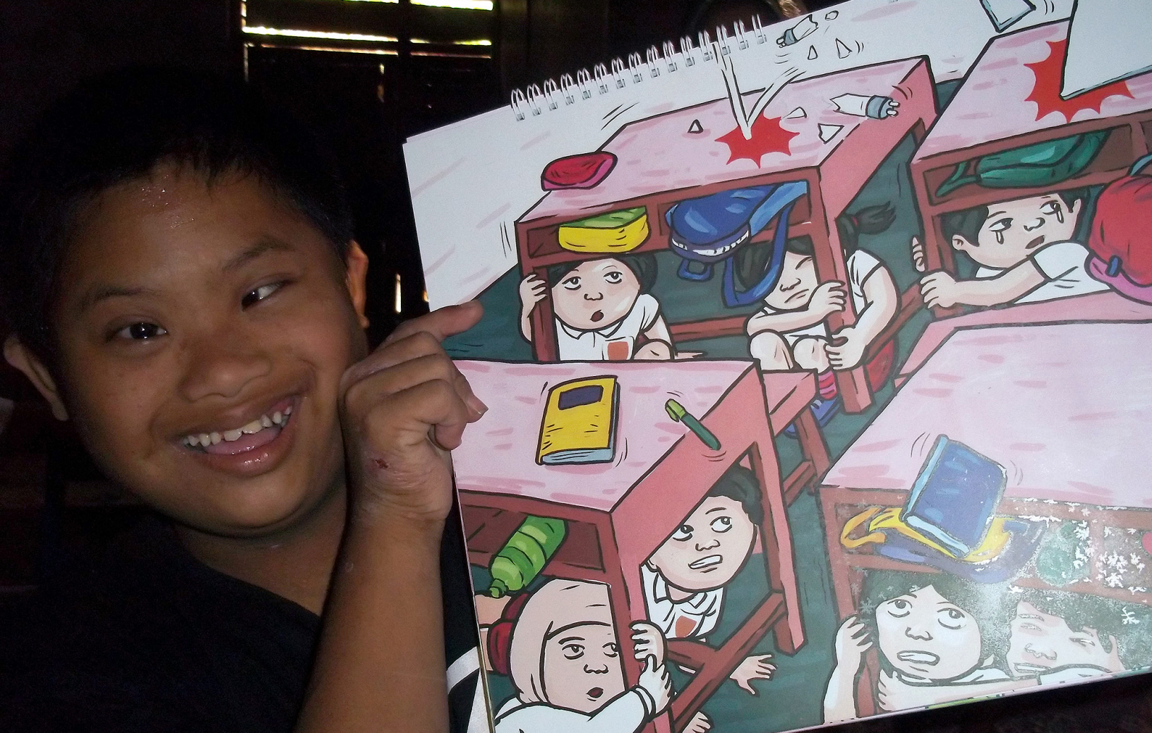
Indonesia: Building resilience for children with disabilities. Disaster Risk Reduction training has to include all members of society, especially the most vulnerable.

Together, these frameworks and mechanisms provide a foundation for mainstreaming inclusive disaster risk management into development. Such mainstreaming could help reverse the rising trend of disaster losses. One important mechanism that supports work in this area is the Global Facility for Disaster Reduction and Recovery (GFDRR), a global partnership managed by the World Bank, that supports disaster risk management projects worldwide. GFDRR helps countries to better understand and reduce their vulnerability to natural hazards and climate change. GFDRR also contributes to the effective implementation of the Sendai Framework by helping countries integrate disaster risk management and climate change adaptation into development strategies and investment programs, as well as recover from the impacts