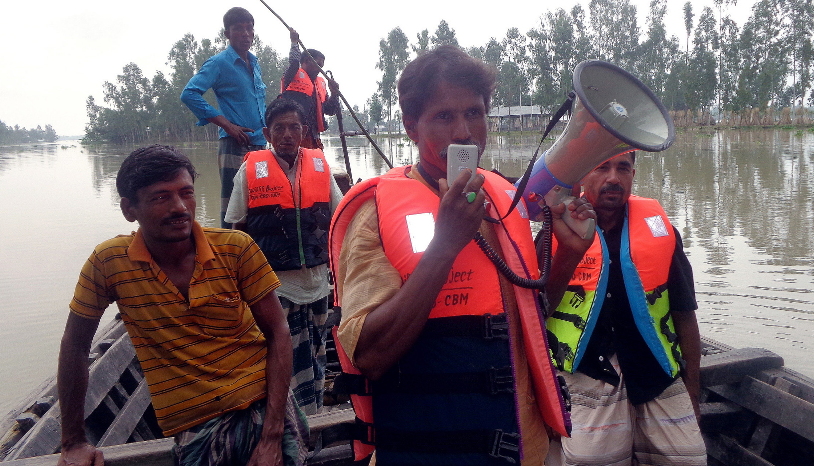
Evacuation in process in Bangladesh.

Policy barriers can reduce the options for persons with disabilities in an emergency. Policies that promote separate facilities or services for persons with disabilities may result in their being turned away from general shelters or being separated from family. Similarly, policies that prohibit evacuation or housing of animals in shelters may discourage those who rely on support animals from choosing to evacuate to stay with their animals. Policies that are based on the medical model of disability can leave persons with disabilities without adequate or timely support to assist them in eating, getting dressed, going to the bathroom, or other activities of daily life and thus less independent. Such policies can also result in referrals to specialized disability services that are often inadequate for routine or emergency medical care that would be better handled by a general health center.