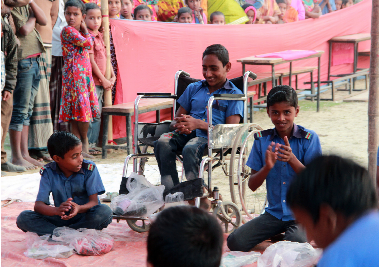
Children participate in a mock drill.