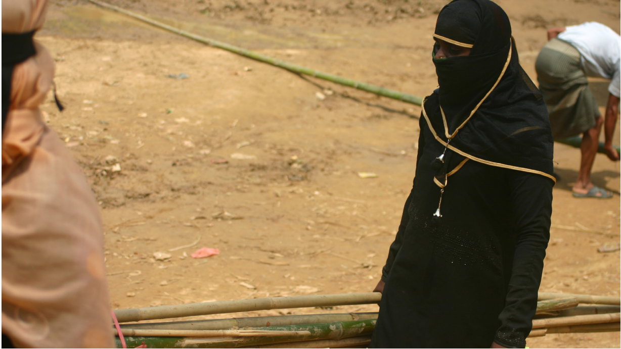
Rohingya woman carrying bamboo in Cox's Bazar, Bangladesh.

hingya women, why the local markets are flooded with dignity kits, and what women's experiences have been when they access services. It is clear that an updated and comprehensive gender assessment is of paramount importance to inform programming. The humanitarian community currently has a limited capacity to understand how to meet the differentiated needs of women, girls, men, and boys. Programming may also be reinforcing harmful gender norms.