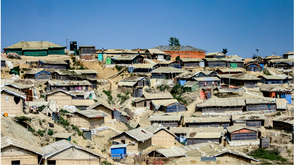
Snapshot of the Rohingya refugee mega-camp in Cox's Bazar, Bangladesh.

crisis—fewer than half the refugee sites in Bangladesh had access to GBV response services. The number of service points at which an incident could be reported, or where a survivor could seek assistance, were far from adequate. A few months later, in June 2018, the coordinating humanitarian body for GBV in Cox's Bazar, known as the GBV Sub-Sector, reported that there are comprehensive GBV referral pathways established at 22 refugee sites, and there are 63 safe entry points for GBV case management, including 48 safe spaces for women and girls. The Sub-Sector estimated that an additional 137 GBV entry points are needed to fully cover the population. 15 But even where services exist, there are serious concerns about programming quality and respect for the guiding principles that underpin GBV interventions.