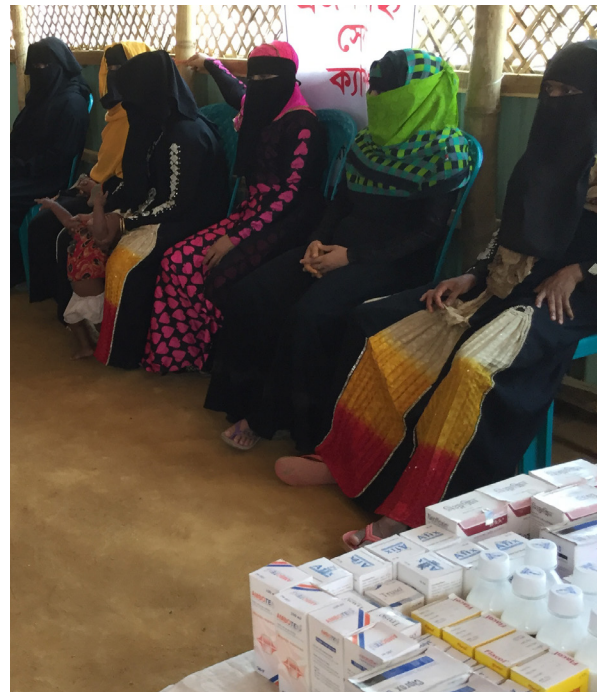
Reproductive Health Camp in Cox’s Bazar where Rohingya women seek medical supplies and services.