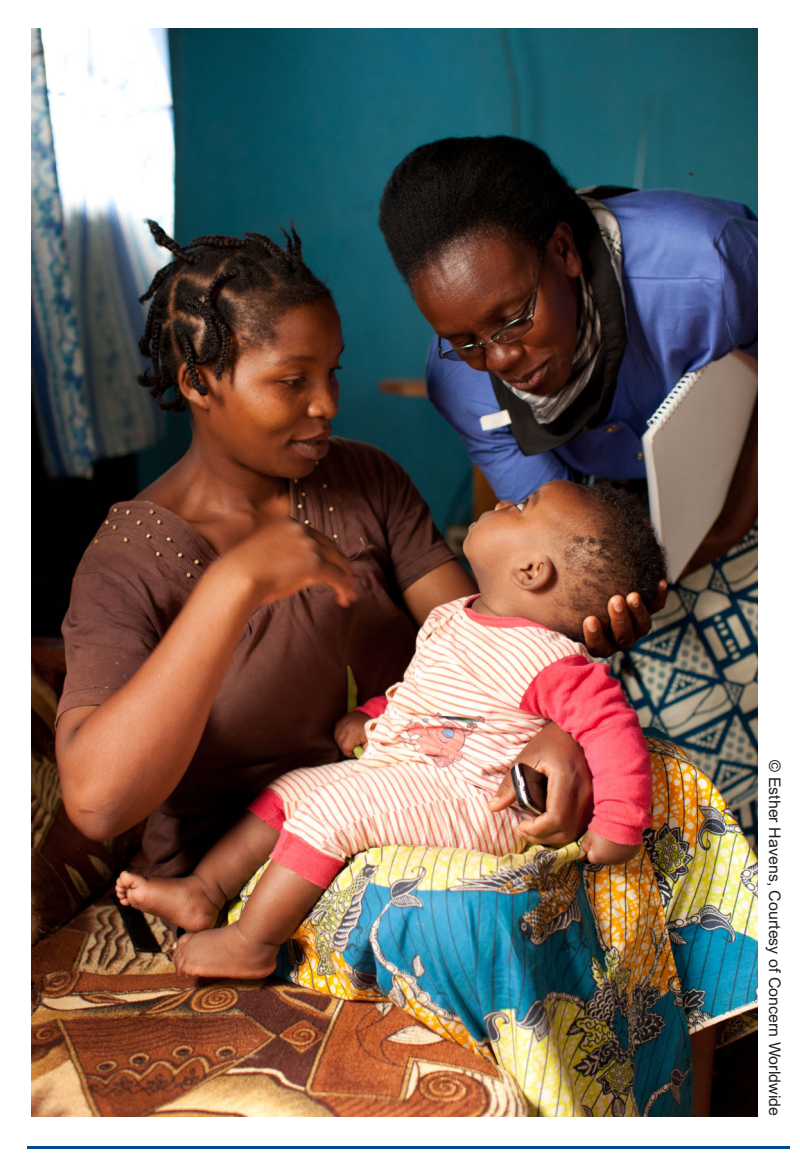
A community health worker and member of a Peer Support Group on a routine home visit.

ensure appropriate storage and drug management, and review the CHW register on a quarterly basis. In addition, the cell coordinator was expected to conduct peer supervision visits to all CHWs on a monthly basis. The position of cell coordinator was initially created by the project and ultimately scaled up nationally. Barriers to supervision by both the in-charges and cell coordinators were lack of sufficient time, transport, and human resources. Interviewees noted that PSGs lessened these barriers by enabling supervisor access to CHWs at an