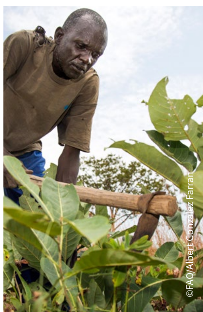
Farmer weeding his crops planted with seeds received during FAO emergency livelihood response programme distribution in Greater Upper Nile area.

In addition, malnutrition levels are very concerning. Rates of Global Acute Malnutrition remain critical, and in many areas above the emergency threshold of 15 percent. A worsening nutrition situation – not typical in the harvest season – has been observed in Greater Equatoria (particularly in Central Equatoria) and parts of Greater Bahr el Ghazal and Warrap.