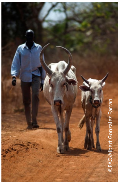
In South Sudan, where livestock are an important social and economic asset, endemic diseases undermine livestock production. Protecting them from animal diseases is vital to food security.

Community resilience, as well as the elimination of hunger, cannot be achieved without closing the gap between women and men in agriculture and food production, as well as ensuring the protection of vulnerable women. Reducing malnutrition is also crucial to strengthening resilience. When people are well nourished, they are healthier, can work harder and have greater physical reserves. Moreover, households that are nutrition secure are better able to withstand, endure longer and recover more quickly from external shocks.