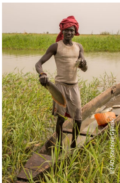
Fisher in Bahr el-Ghazal area showing his catch after receiving fishing inputs from FAO. Fishing inputs offer immediate relief to households experiencing food shortages, as it enables a fresh catch to feed a family from day one.

Driven largely by conflict and related food insecurity, by the end of 2017 about 4 million South Sudanese had fled to other areas of the country or to other countries in the region. Massive displacement is having wide implications. Around one-third of the population have abandoned their homes, and many are unable to continue their livelihoods without assistance. As farmers leave typically surplus-producing areas – most notably Greater Equatoria – food availability is being severely compromised across South Sudan.