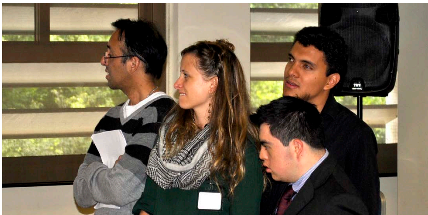
iiDi, UNICEF and IDA side event youth participants