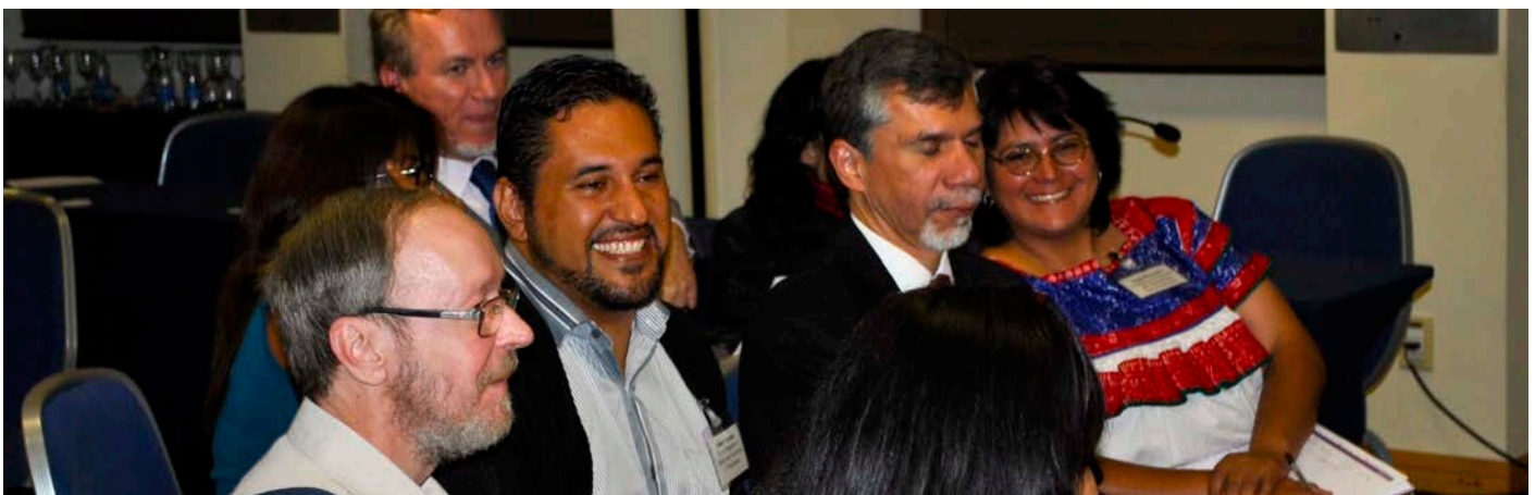
Declaration Drafting Working Group