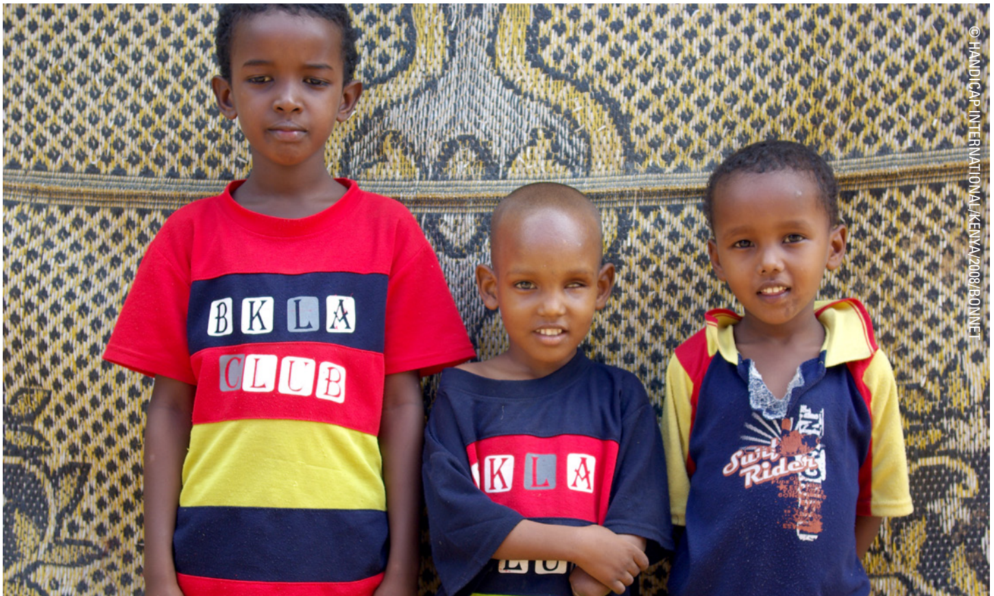
Somali refugee boys in Dadaab refugee camp in Kenya. The boy in the centre lost one eye and his left hand in an explosion of unexploded ordnance when he was four.

The final PDF file, Chapter 6, contains resources and references that users may find helpful.