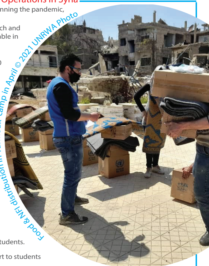
Food & NFI distribution in Yarmouk camp in April