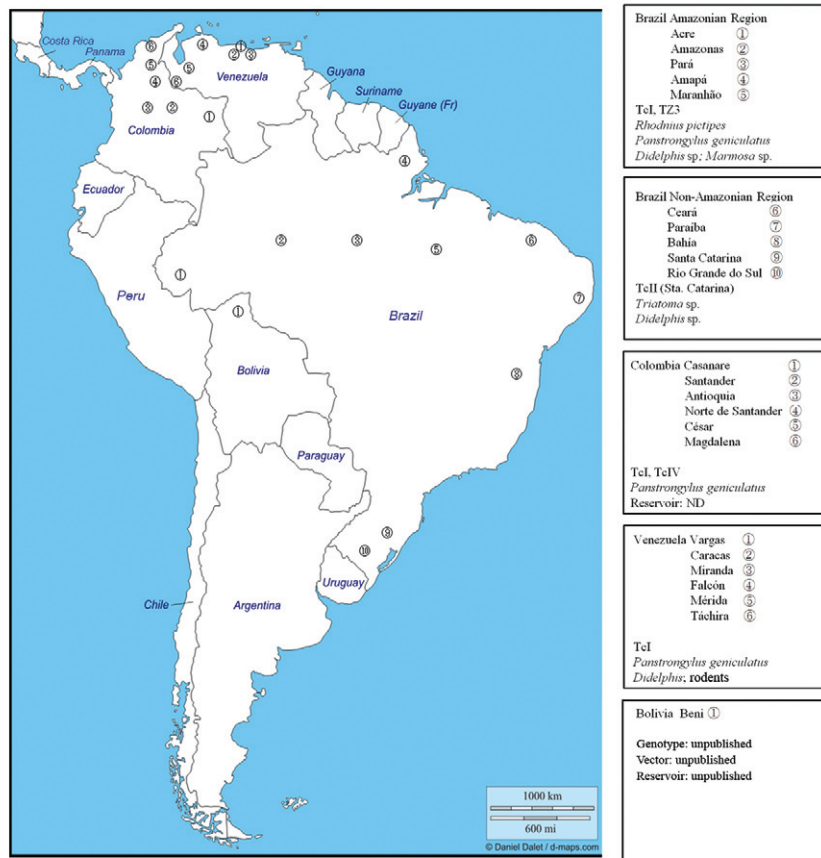
Fig. 1: geographical distribution of oral transmitted Chagas disease outbreaks occurred in America: Brazil Amazonian Region [1: Acre (SVS 2011); 2: Amazonas (SVS 2011); 3: Pará (Valente et al. 2001, Beltrão et al. 2009, Nóbrega et al. 2009); 4: Amapá (Pinto et al. 2008, SVS 2011); 5: Maranhão (Pinto et al. 2008)], Brazil Non-Amazonian Region [6: Ceará (Cavalcanti et al. 2009); 7: Paraíba (Shikanai-Yasuda 1987); 8: Bahia (Maguire et al. 1986); 9: Santa Catarina (Steindel et al. 2008); 10: Rio Grande do Sul (Nery-Guimarães et al. 1968)], Colombia [1: Casanare (ProMED-mail 2014); 2: Santander (Hernández et al. 2009); 3: Antioquia (Ríos et al. 2011); 4: Norte de Santander (Bohórquez et al. 1992); 5: César (ProMED-mail 2010b); 6: Magdalena (Cáceres et al. 1999)], Venezuela [1: Vargas (Alarcón de Noya & Martínez 2009); 2: Caracas (Alarcón de Noya et al. 2010b, ProMED 2010a, 2012); 3: Miranda (2014, unpublished observations); 4: Falcón (2013, unpublished observations); 5: Mérida (Añez et al. 2013); 6: Táchira (Benítez et al. 2013, 2014, unpublished observations)] and Bolivia [1: Beni (Santalla-Vargas et al. 2011)].

The study of orally transmitted Chagas disease should be analysed under different perspectives: