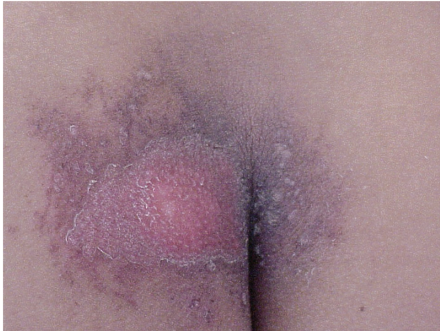
Figures 5 Moist desquamation

Moist desquamation. This patient is the wife of the previous case study, 26 days postexposure. She was exposed to the 192 Ir source when she sat on her husband's pants (still containing the source) for approximately 20 minutes after he had changed clothes that evening.