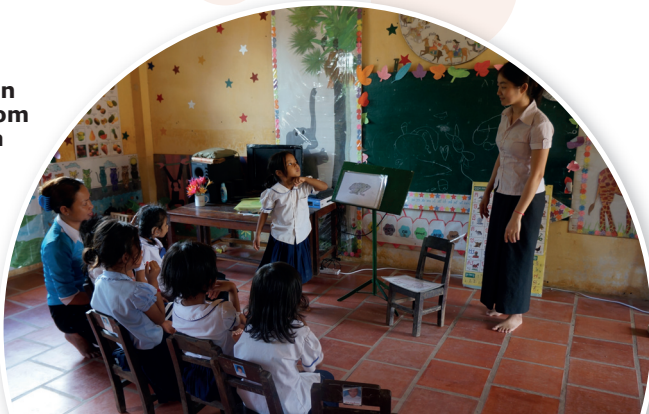
Deaf children in a classroom in Cambodia

CBM collaborates with partners on local, national, regional and global levels, by providing technical and financial support as well as engaging in Alliance Building and Advocacy. Partners on the Global level include IDA (International Disability Alliance), IDDC (International Disability and Development Consortium), WHO (World Health Organisation), UN (United Nations) bodies, and professional associations.