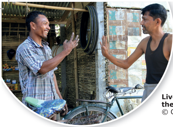
Livelihood in the community