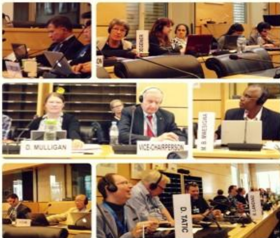
Members of the CRPD committee during the 12th session in Geneva, September 2014.

There were also a number opportunities at the UN and also at country level during 2014 for CBM to continue raising awareness and influencing outcomes on inclusive development. Some examples include; input from CBM at the Conference of State Parties to a side event on Human Rights and Development Cooperation ; input from CBM at a roundtable on the impact of the CRPD on Dutch Foreign Policy and an event organised by CBM at the UN in New York on the ' Intersectionality between the CRPD and the Convention on the Elimination of All Forms of Discrimination against Women (CEDAW) ' in relation to women and girls with disabilities."