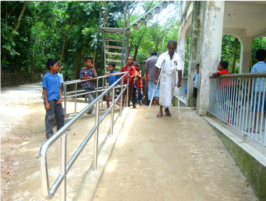
The new ramp at the Mahanagor cyclone shelter gives people with disabilities better access and led to higher evacuation rates of people with disabilities during cyclone 'Mahasen' in 2013.