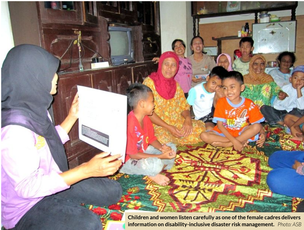
Children and women listen carefully as one of the female cadres delivers information on disability-inclusive disaster risk management.