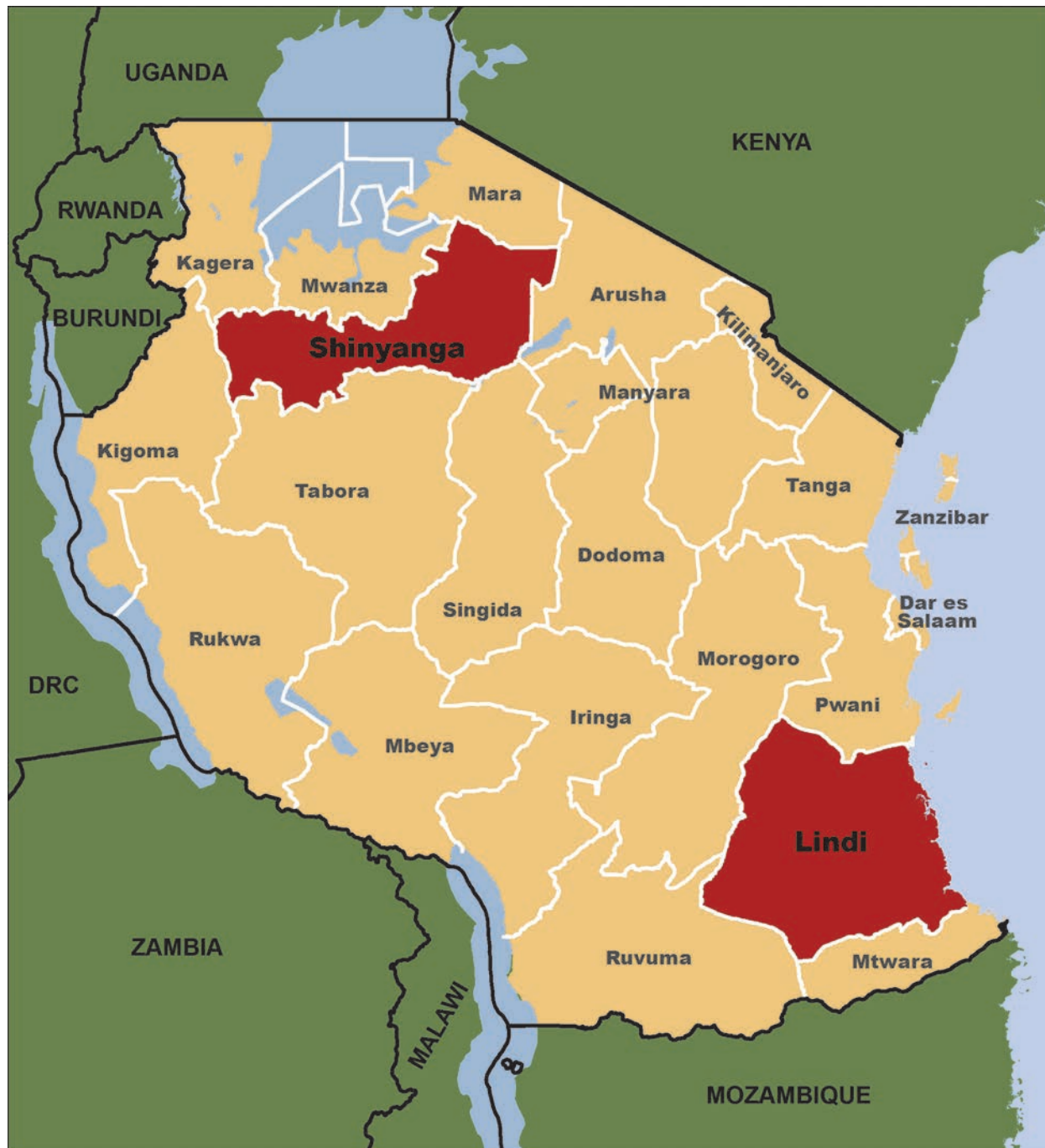
Plate 1. Map of Tanzania

indirect effects, or proximate ones, included education, urban/rural residence, religion, being in a monogamous union, and reported desire for many children.