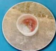
REHOKA MISY RA na LIO

RAHA MISEHO NY IRAY AMIN'IREO FAMBARA IREO, MANATONA HAINGANA NY TOBIMPAHASALAMANA