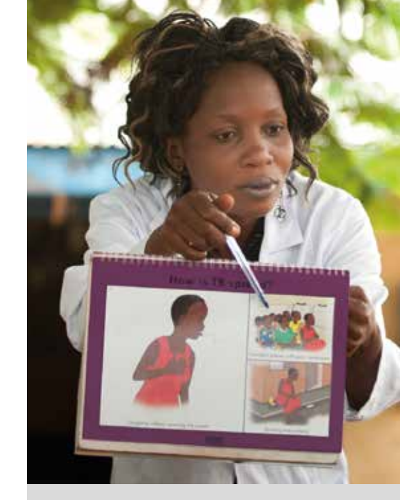
A community health worker in Uganda is explaining the symptoms of Tuberculosis.