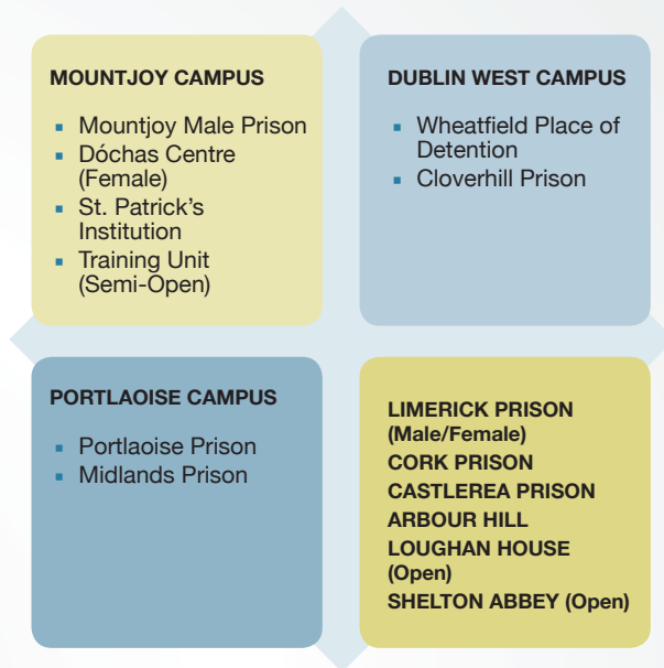
Fig. 1 Prisons in Ireland (2015)

At the beginning of July 2015 there were 3,771 individuals in custody in Ireland. Of the 14 institutions operated by the Irish Prison Service, 4 were operating at a capacity above that recommended by the Inspector of Prisons 51 . The rate of imprisonment in Ireland is approximately 88 per 100,000. The prison population increased by 400% between 1970 and 2011. 60% of those serving sentences in Ireland of six months or less are poor and often homeless. There are currently 15 children imprisoned in adult prisons in Ireland 52 , which is in breach of international human rights standards 53 .