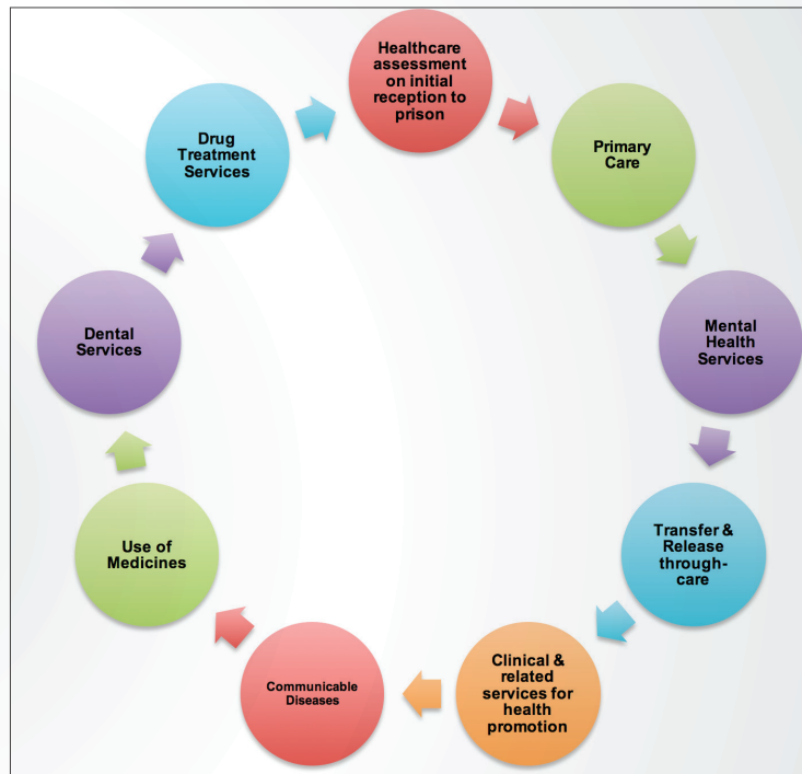
Fig. 2 Nine healthcare standards of the Irish Prison Service

The healthcare standards for the Irish Prison Services were completed in 2011 and the aim is to provide prisoners with access to the same quality and range of health services as those that are available to the general population. Nine healthcare standards were developed: