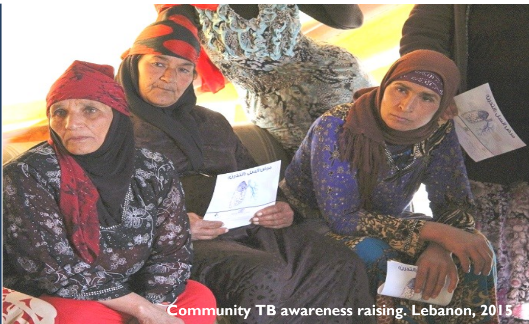
Community TB awareness raising. Lebanon, 2015