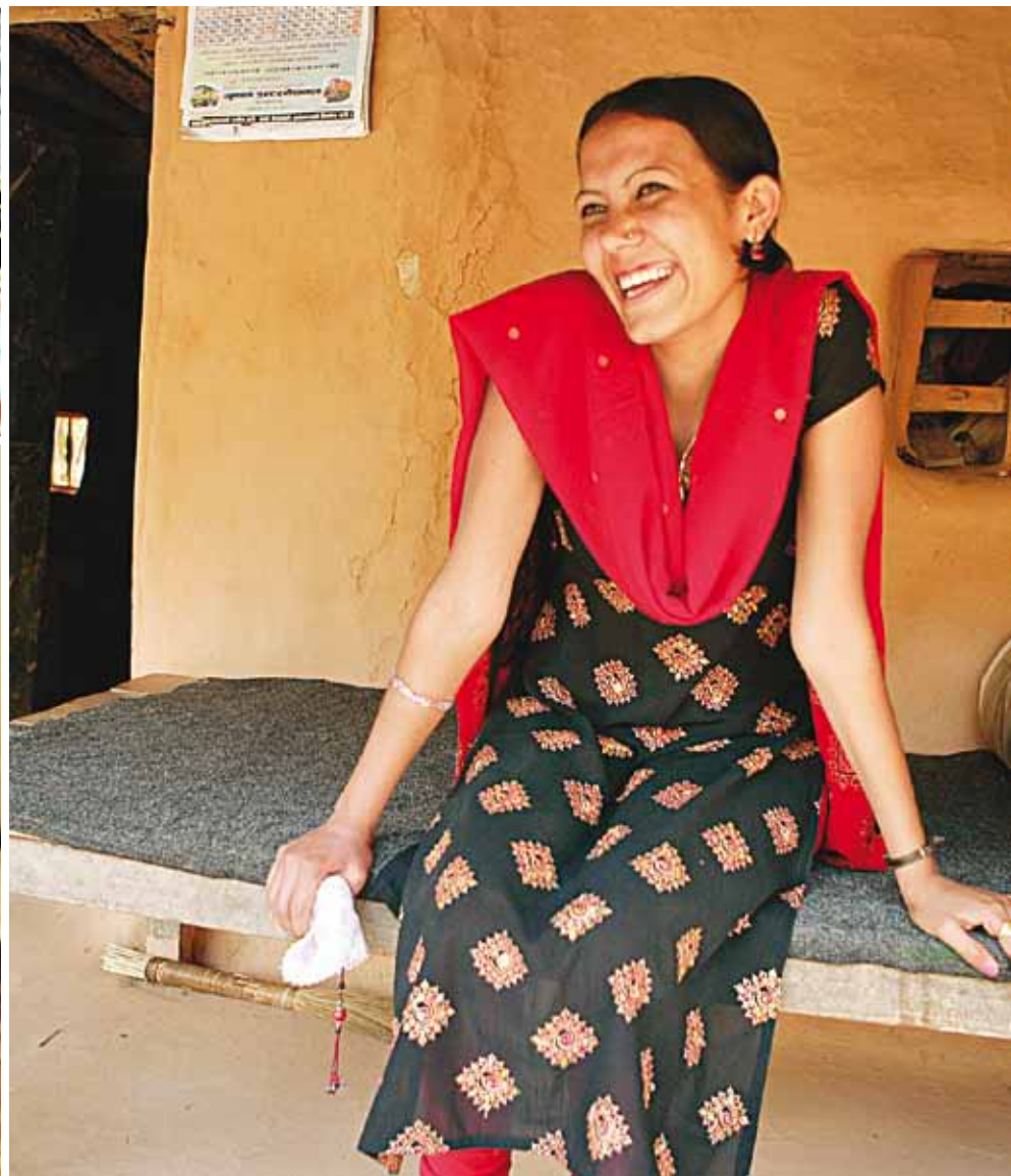
THE GLOBAL FUND TO FIGHT AIDS, TB AND MALARIA