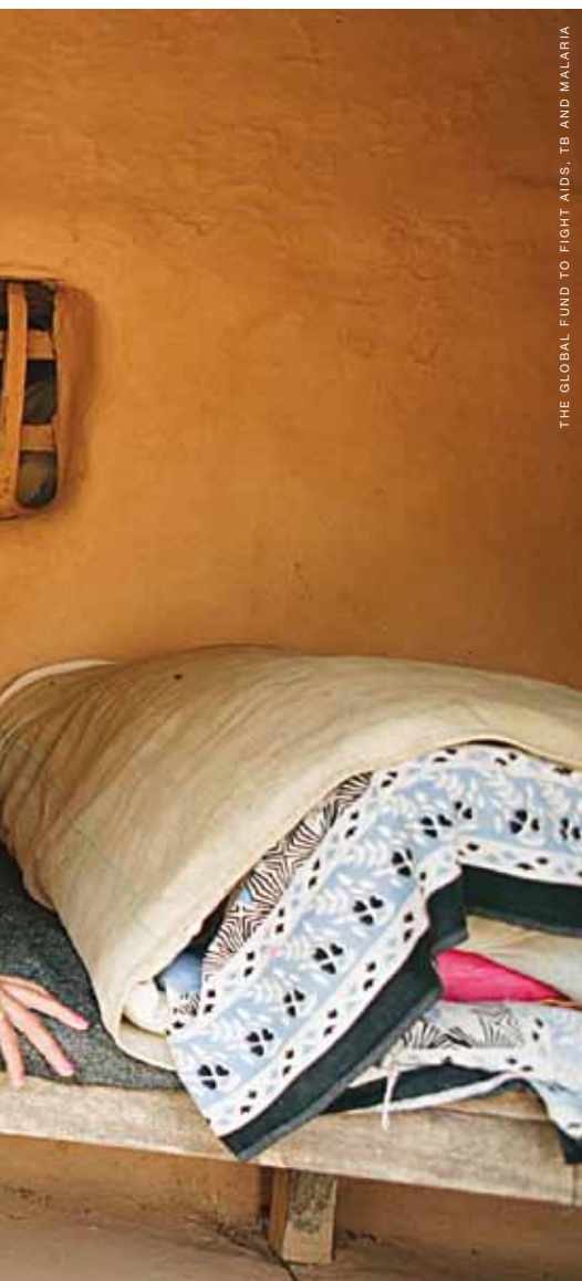
THE GLOBAL FUND TO FIGHT AIDS, TB AND MALARIA